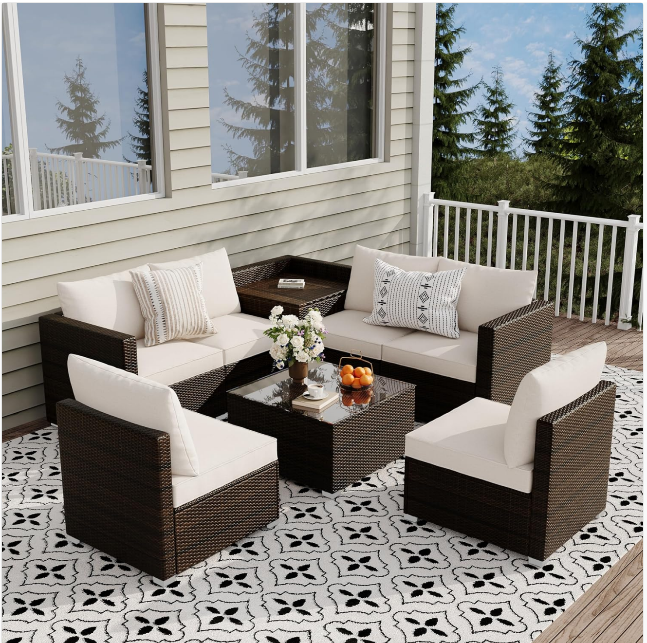
Figure 5.2: GarveeLife patio set arranged on a deck.