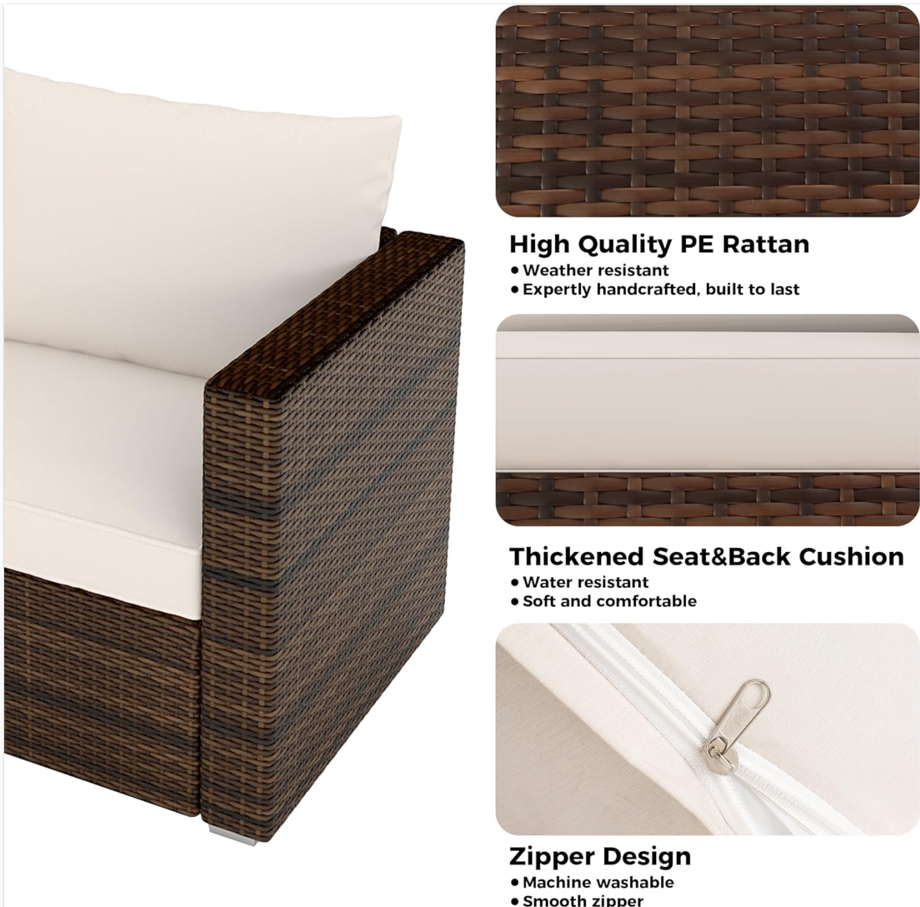
Figure 6.1: Details of PE rattan, cushions, and zipper for maintenance reference.