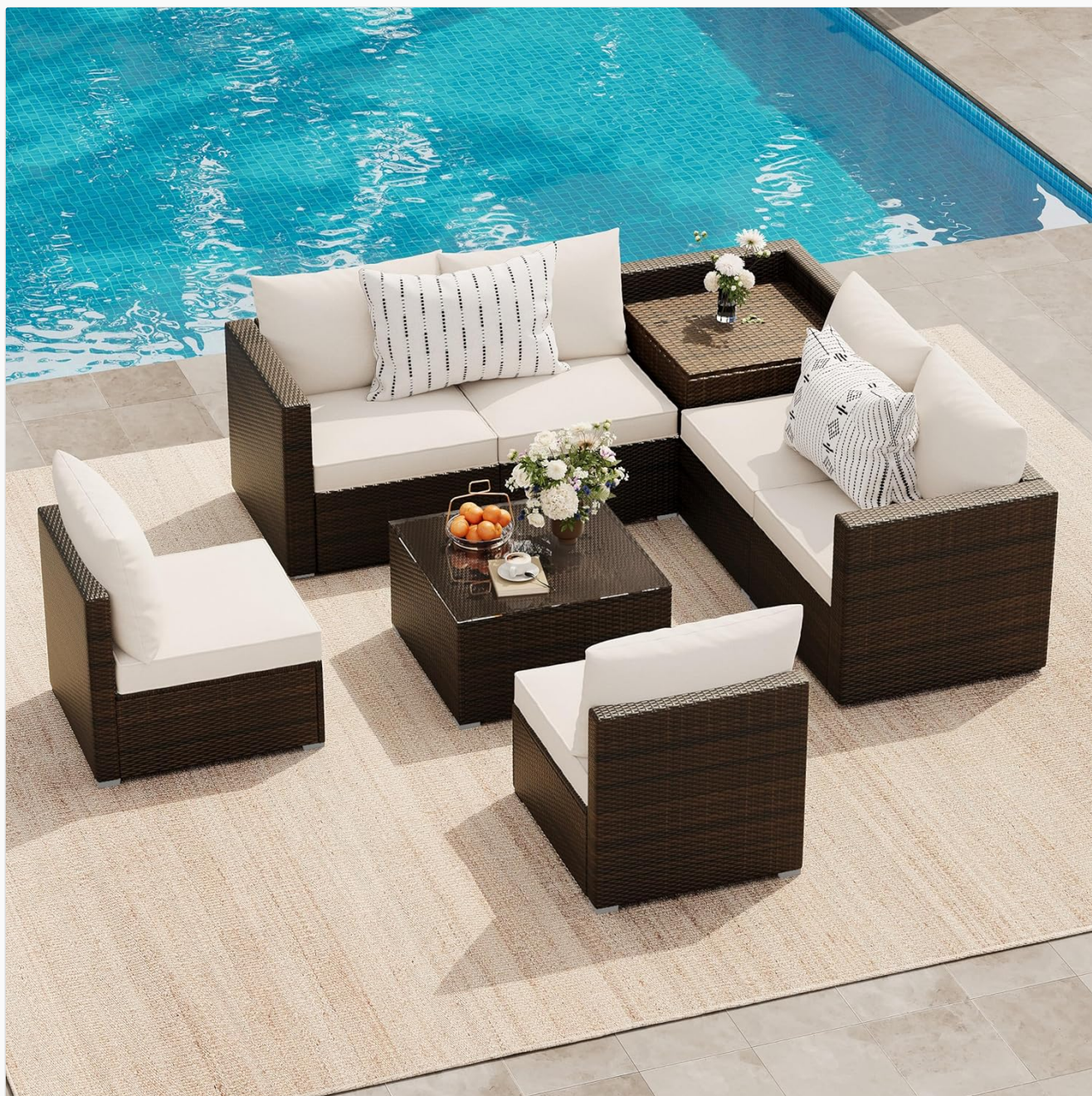
Figure 5.1: GarveeLife patio set in a poolside arrangement.