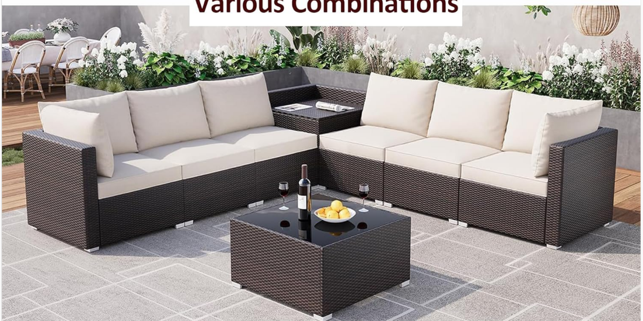
Figure 4.1: Examples of flexible configurations for the sectional furniture.