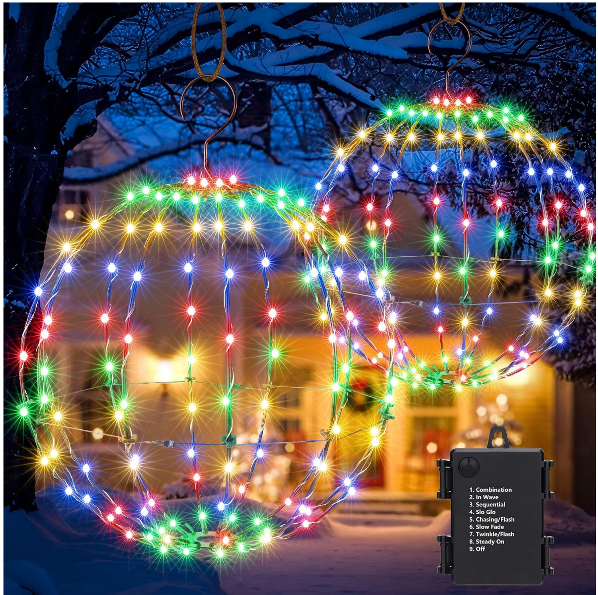
Image: Two Flacchi hanging ball lights illuminated in a snowy outdoor environment.