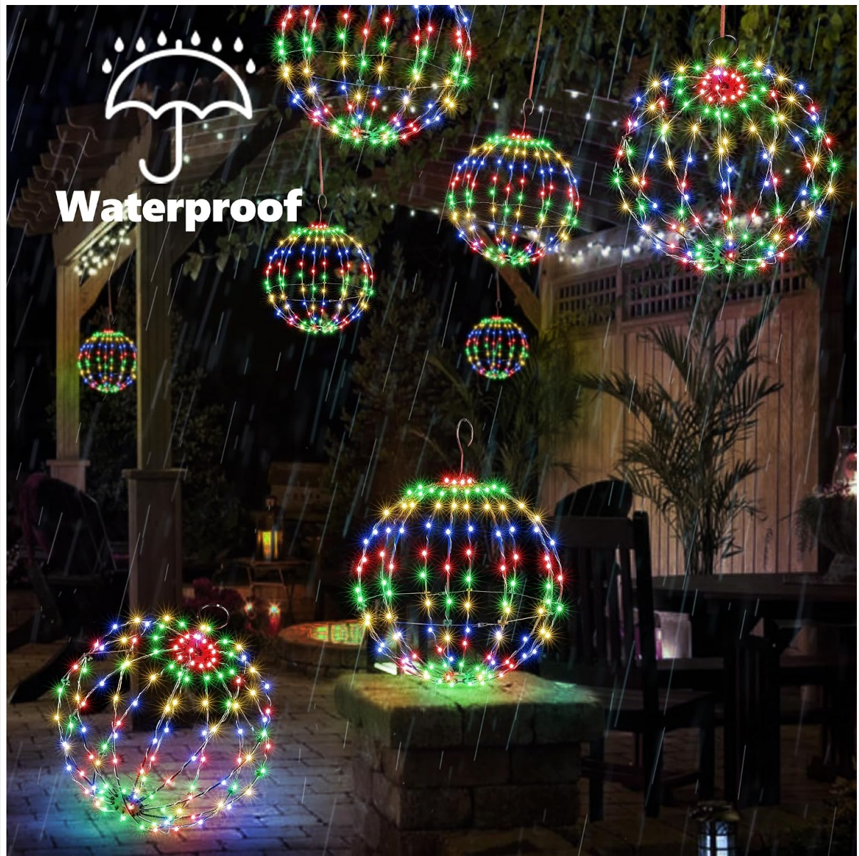
Image: The waterproof feature of the lights is demonstrated under simulated rain.