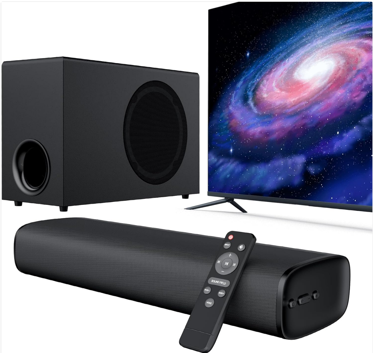
Figure 1.1: vibeadio Sound Bar and Subwoofer System