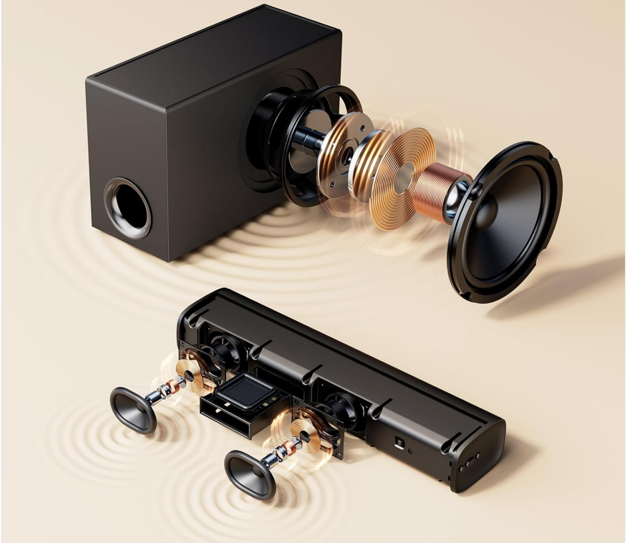
Figure 4.1: Internal Components for Deep & Powerful Sound