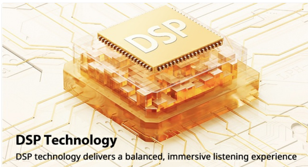
Figure 4.2: Advanced DSP Technology