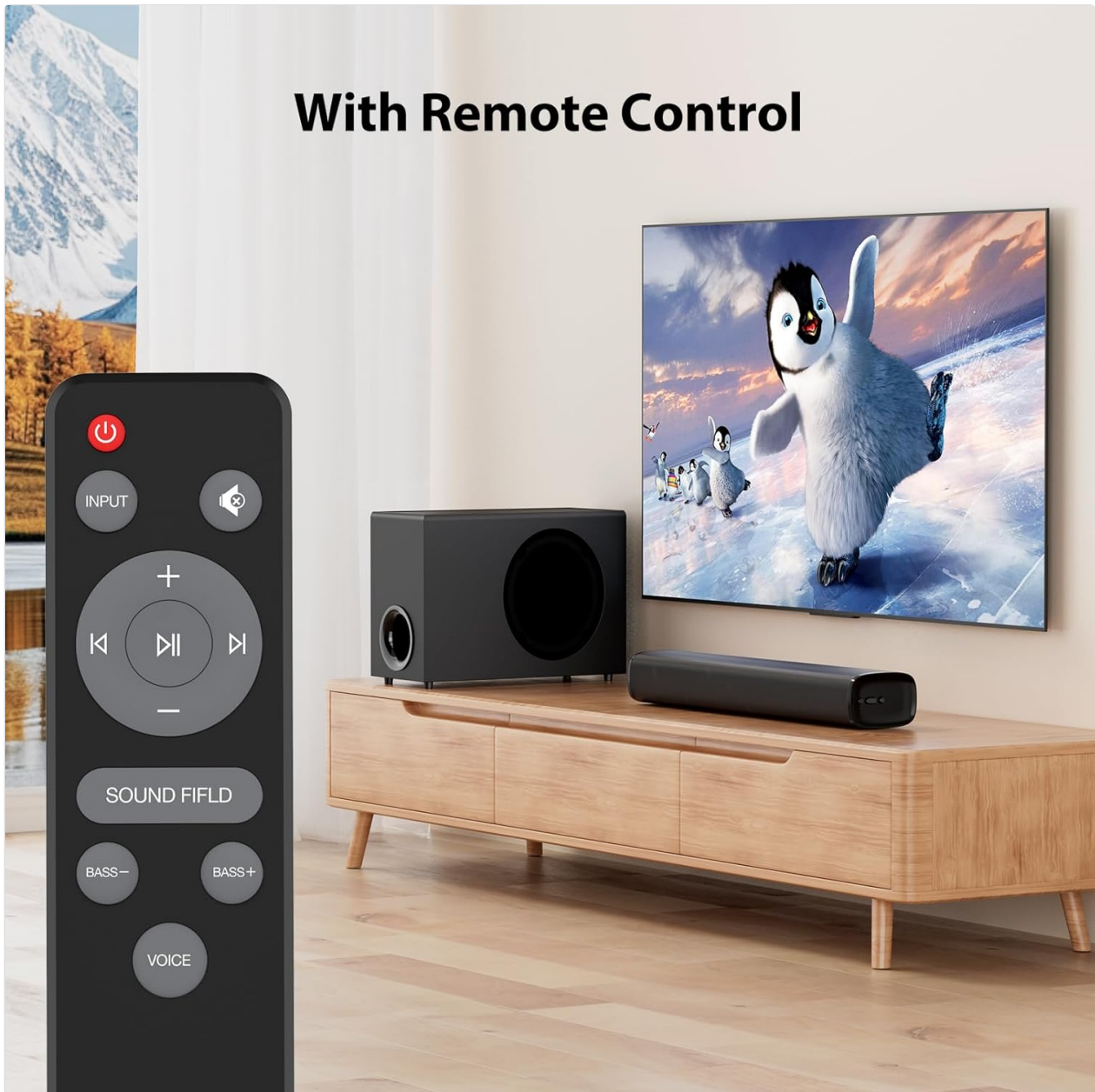
Figure 6.1: Remote Control