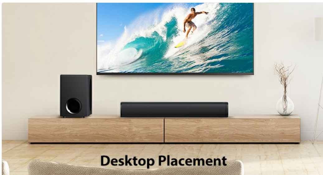
Figure 5.1: Desktop Placement