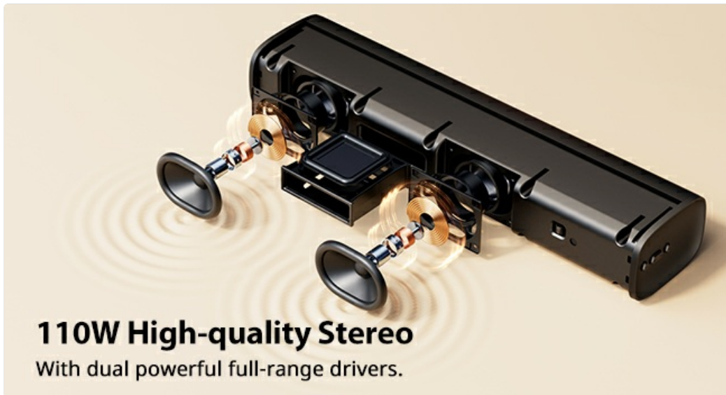
Figure 4.3: 110W High-Quality Stereo with Dual Full-Range Drivers