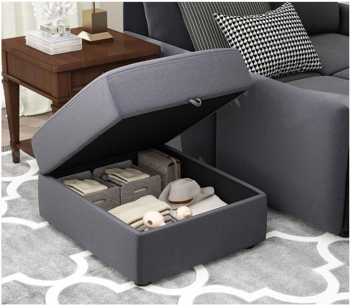
Image: A modular unit with its seat lifted, revealing a spacious storage compartment.