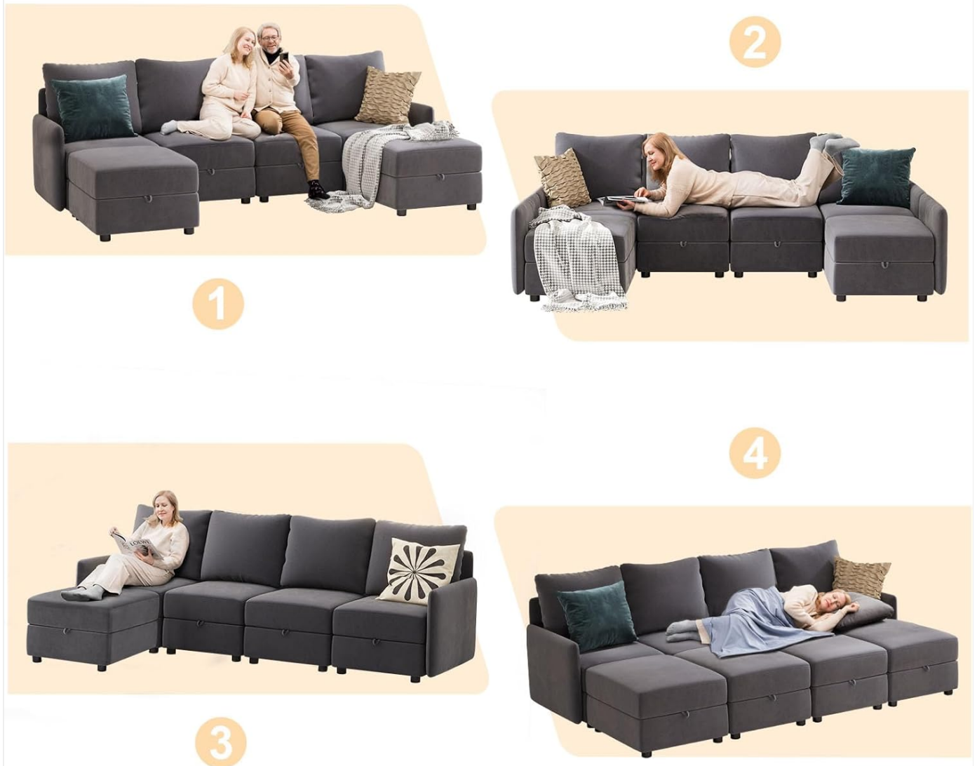
Image: Illustration of the modular design allowing for various sofa configurations.