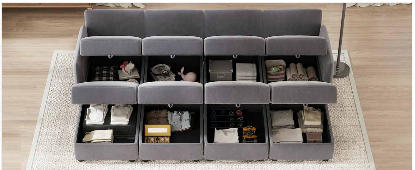
Image: An overhead view demonstrating the multiple storage compartments available under each seat.