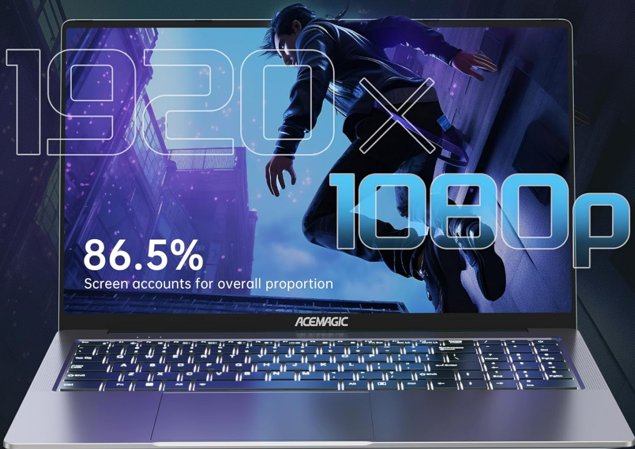
Image: The laptop's 16.1-inch display showcasing its 1920x1080 FHD resolution, IPS technology, bright view, and eye protection features for comfortable viewing.