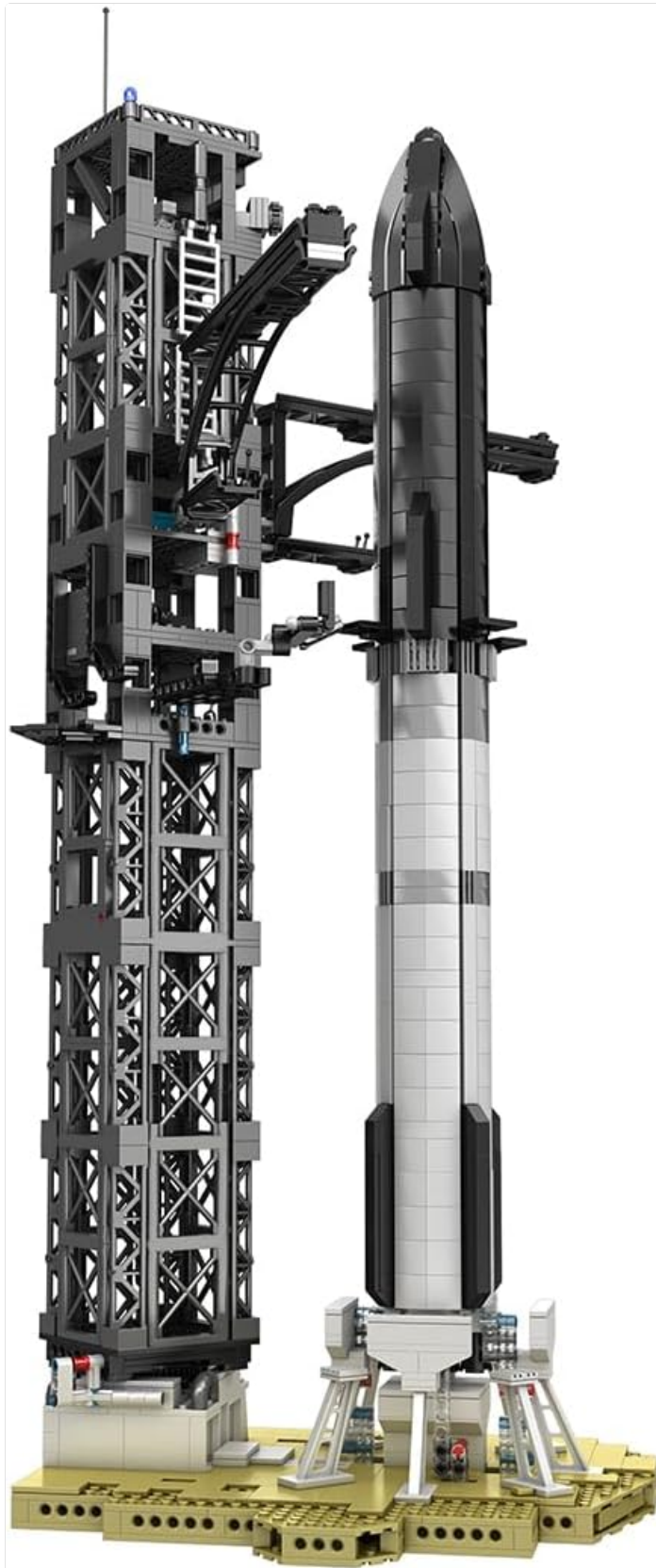
Image: A detailed view of the base of the GoAssemb Starship Rocket, showing its landing legs and connection to the launch pad structure.