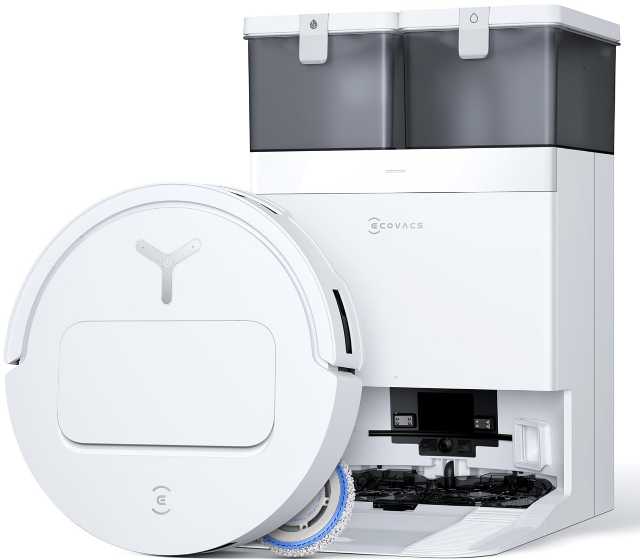
The DEEBOT T50 PRO Omni Robot Vacuum and Mop, shown with its accompanying Omni Station.