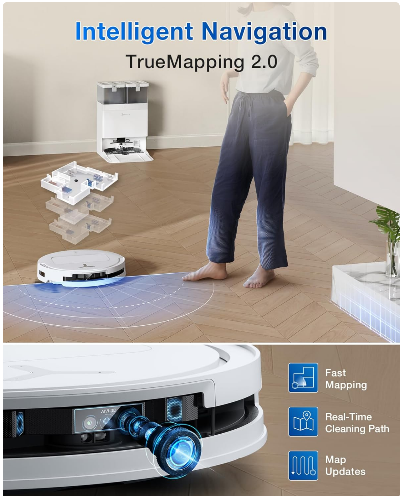
The 10-in-1 OMNI Station automates various maintenance tasks for convenience.

The station automatically handles 167°F hot water mop washing, 113°F hot air drying, auto dustbin emptying, water refilling, and dirt detection. It also auto-dispenses cleaning solution for a deep clean every time.