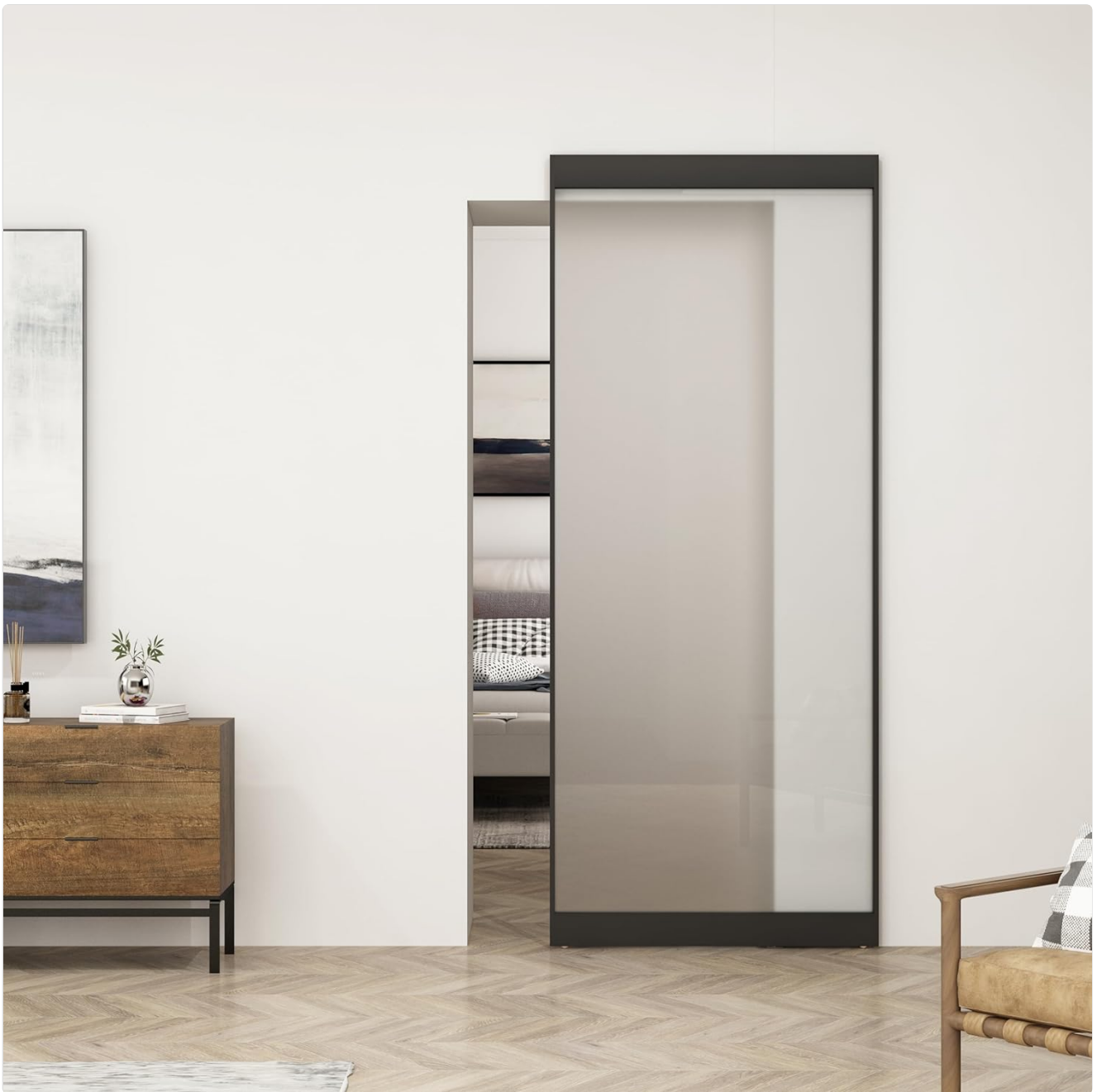
Image 1.1: The CALHOME Full Lite Frost Glass Black Steel Frame Interior Sliding Barn Door shown installed, demonstrating its minimalist design and functionality as a room divider.