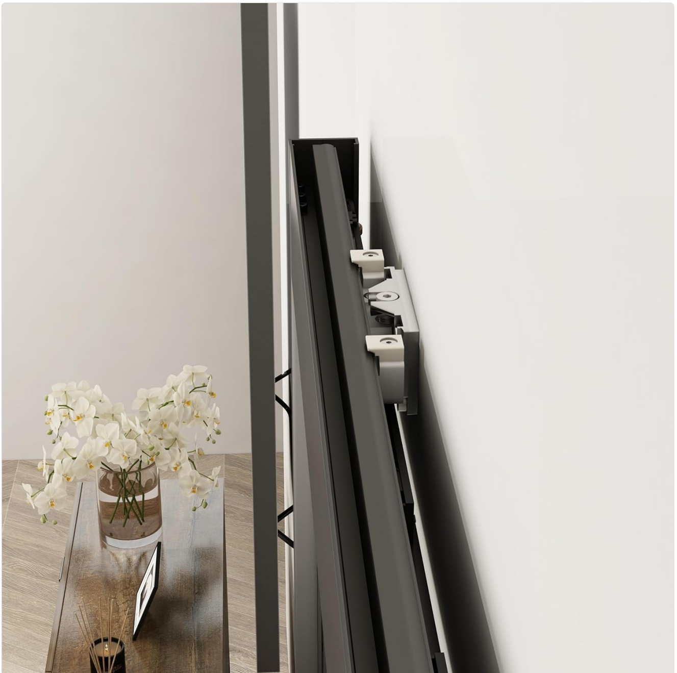
Image 4.1: A detailed view of the concealed sliding track system, showing the rollers and soft-close mechanism integrated into the track.