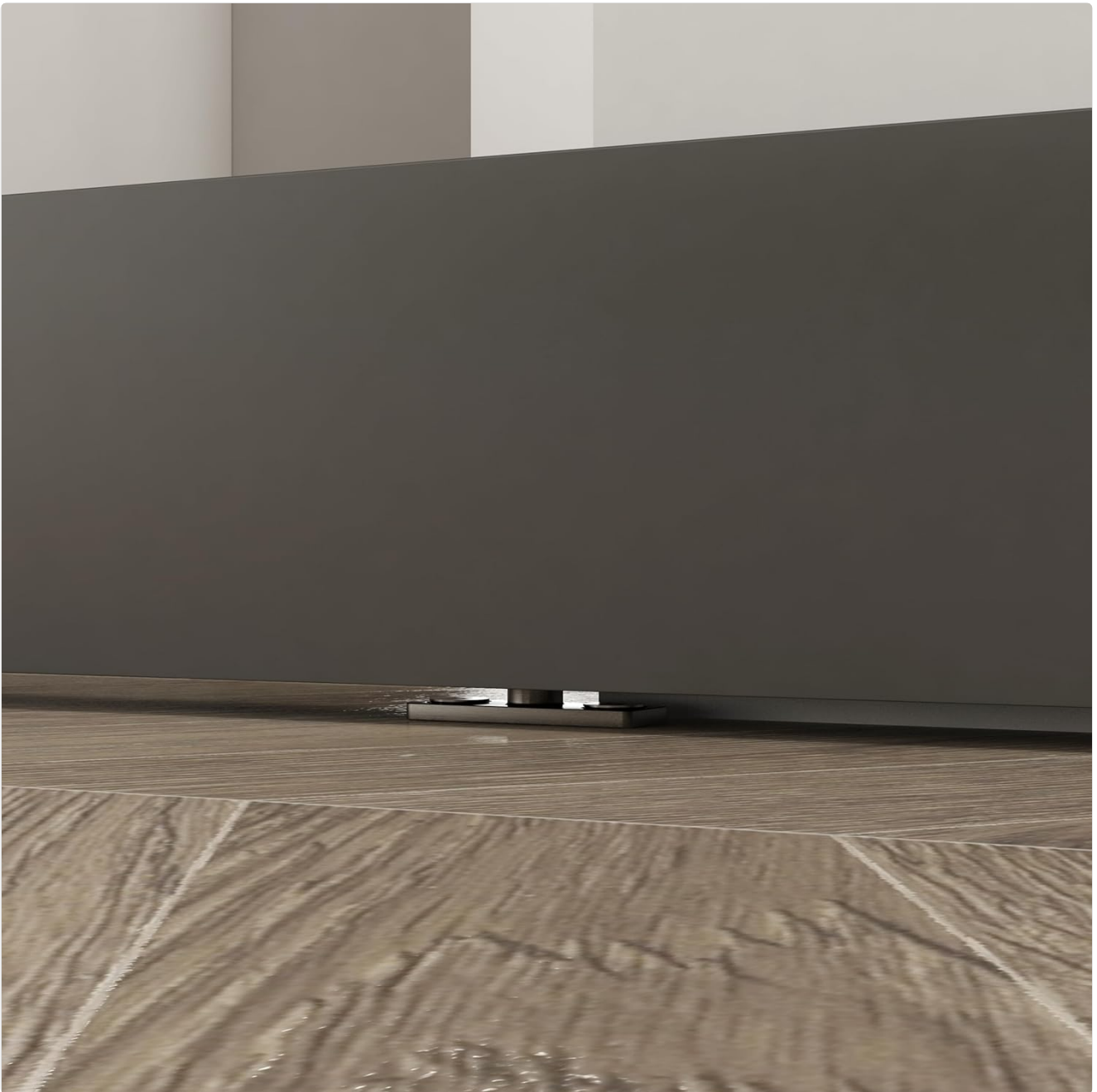
Image 4.2: The floor guide, designed to keep the bottom of the door stable and aligned during sliding operation.