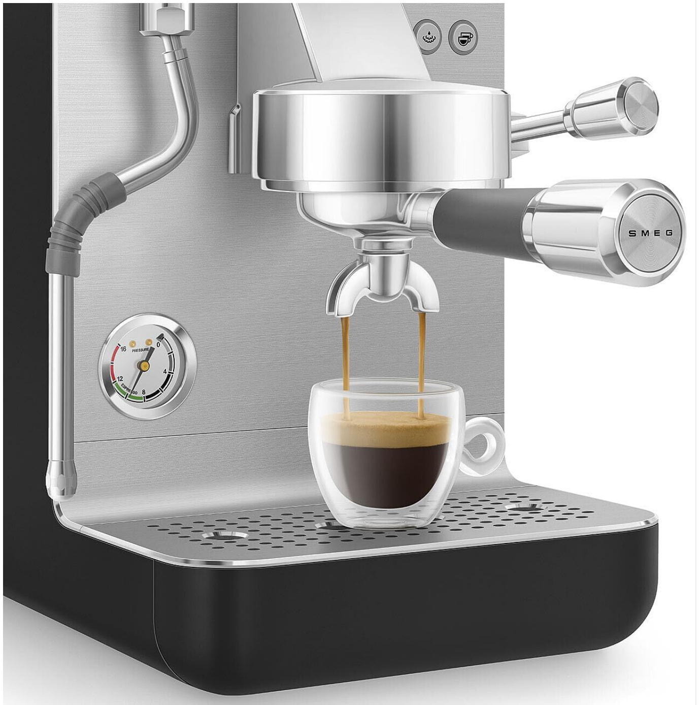
A close-up view of rich espresso being extracted from the portafilter, showcasing the quality of the shot.