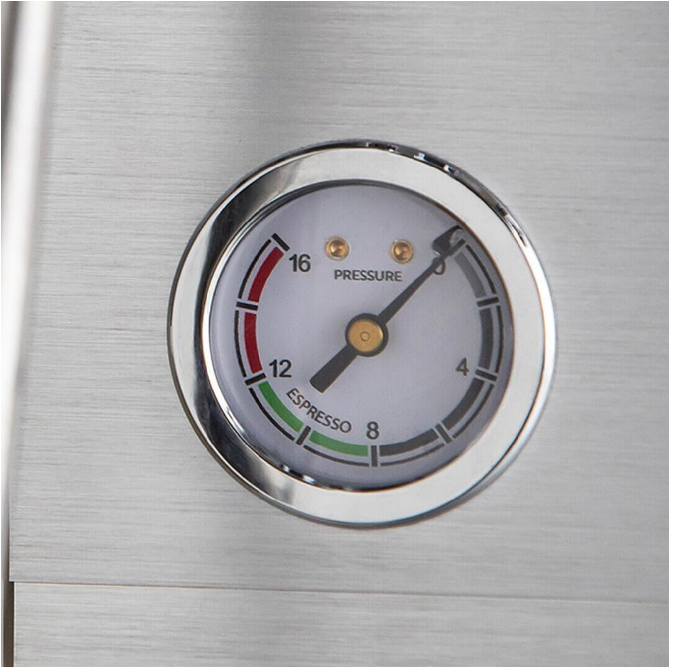
A detailed shot of the integrated pressure gauge, allowing precise monitoring of the extraction process.