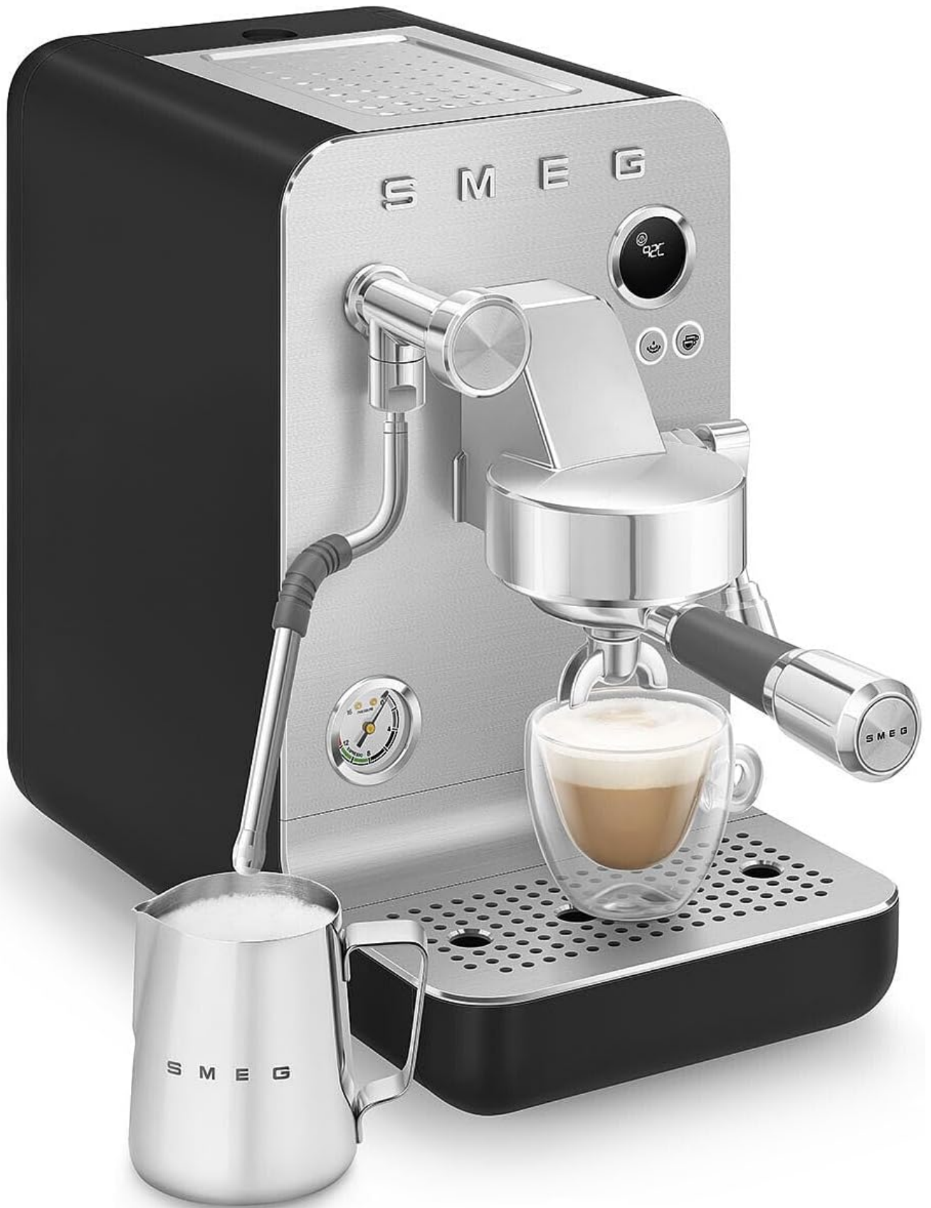
The machine with a glass of latte, demonstrating its milk frothing capabilities for specialty drinks.