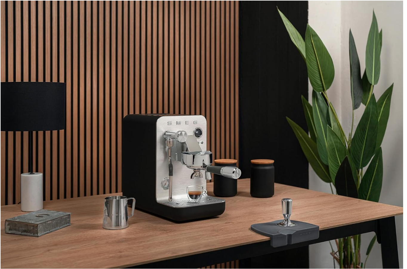
The espresso machine positioned on a wooden countertop, accompanied by a milk pitcher and tamper.