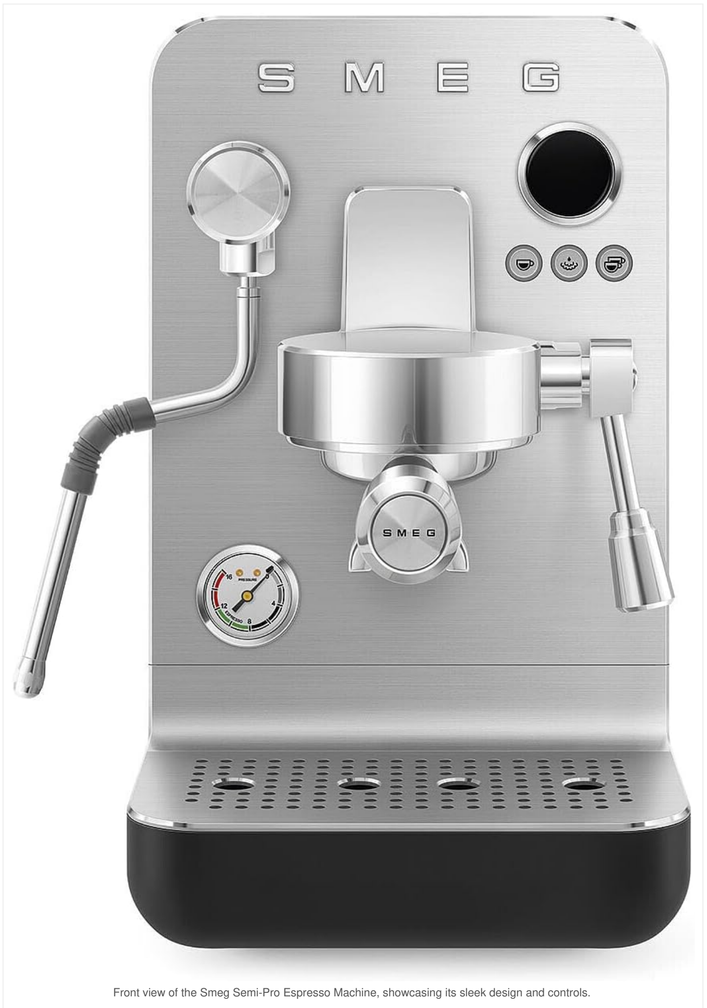
Front view of the Smeg Semi-Pro Espresso Machine, showcasing its sleek design and controls.