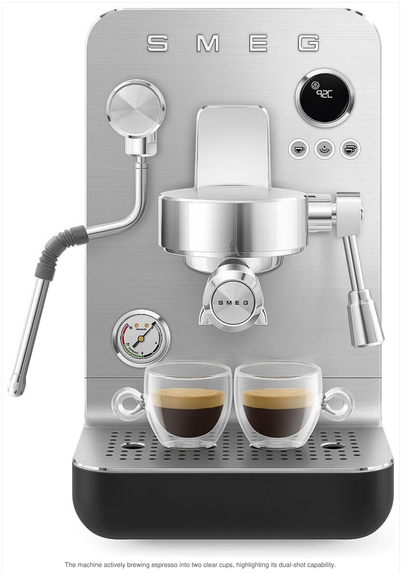
The machine actively brewing espresso into two clear cups, highlighting its dual-shot capability.