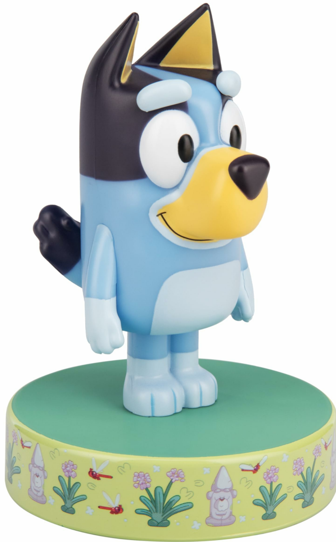
Image: The Paladone Bluey Icon Light in its off state, showcasing the character design.