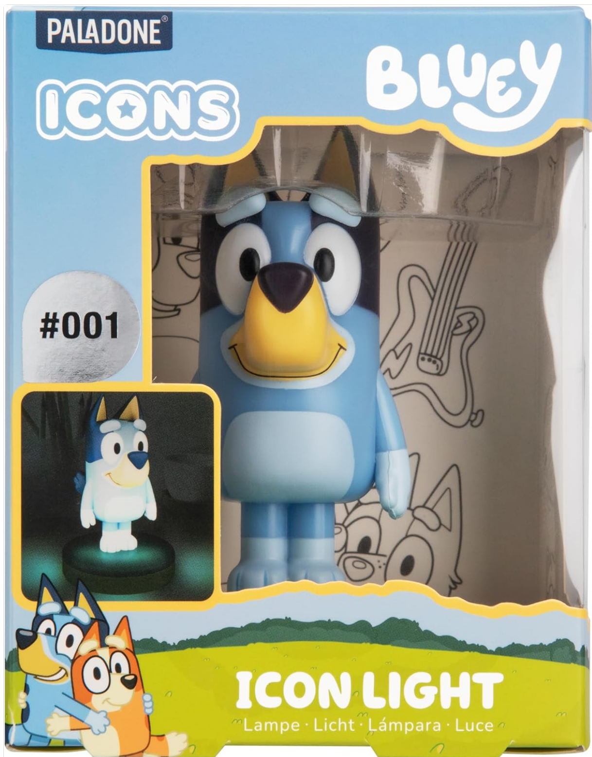
Image: The Paladone Bluey Icon Light in its retail packaging, highlighting the colour-in feature.