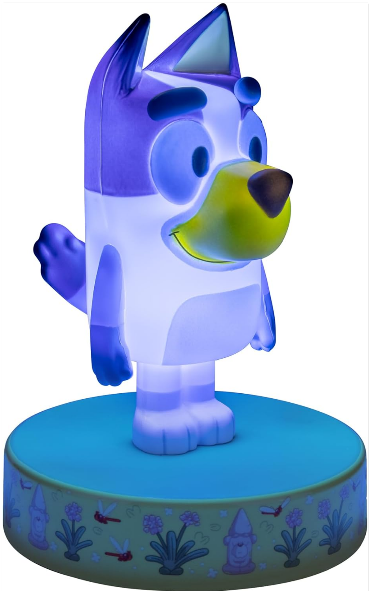
Image: The Paladone Bluey Icon Light illuminated, providing a soft, warm glow.