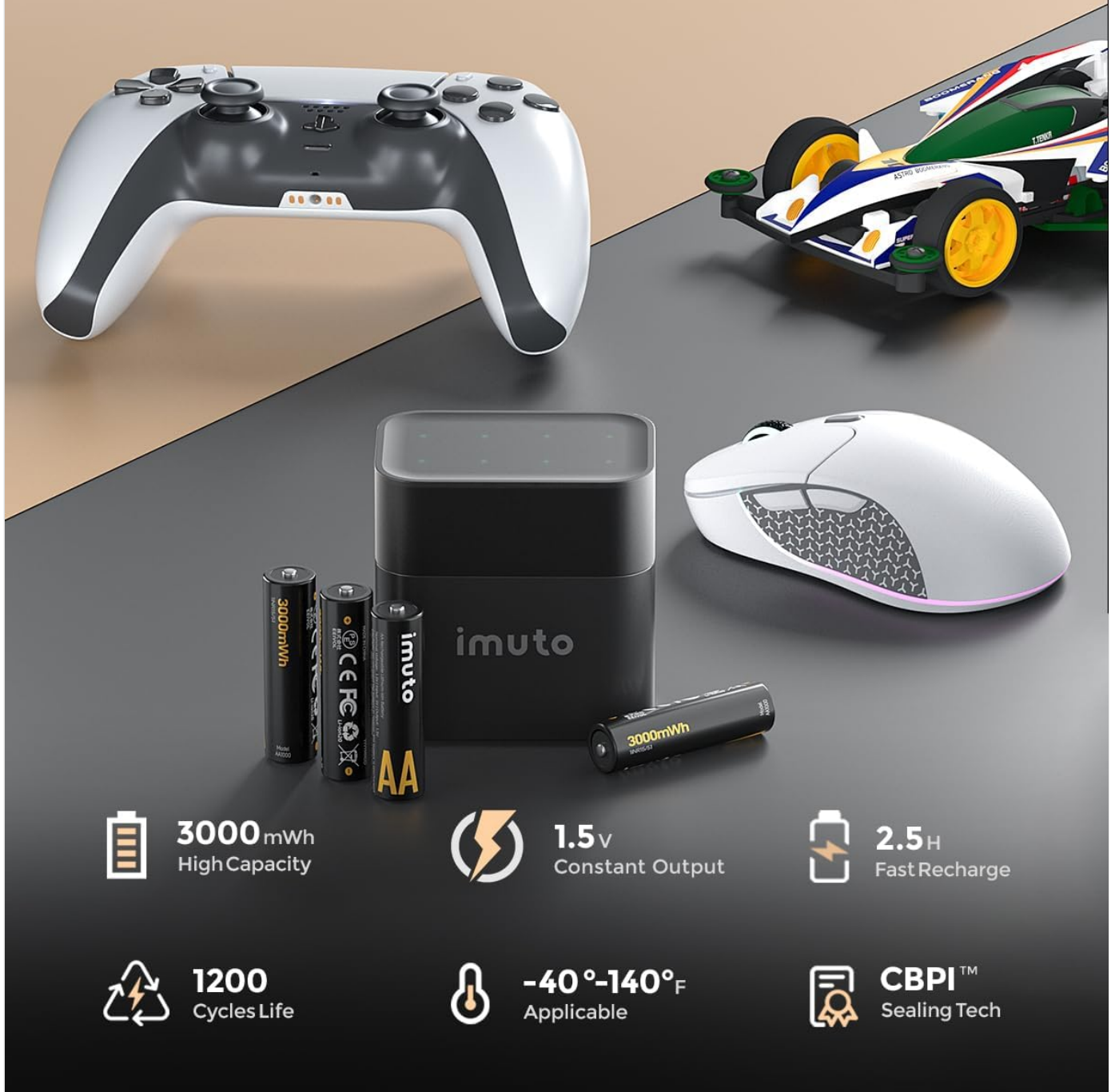
Image: An illustration showing imuto AA batteries being used in a game controller, a remote control car, and a computer mouse, highlighting their versatile applications.