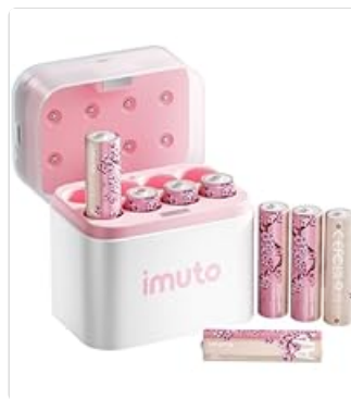
Image: Visual representation of imuto batteries' ability to function across a broad temperature range, from -40°F to 140°F.

These batteries can operate reliably in a wide temperature range of -40°F to 140°F (-40°C to 60°C), offering superior performance compared to alkaline and NiMH batteries in extreme conditions.