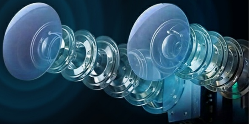
Image: An exploded view diagram illustrating the components of the 16 Watt speaker system, designed for an engrossing aural experience.