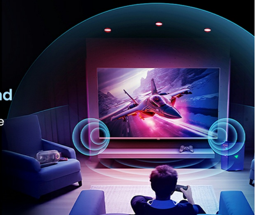
Image: Visual representation of Dolby Audio with Surround Sound, showing sound waves emanating from the TV, indicating an immersive audio experience.