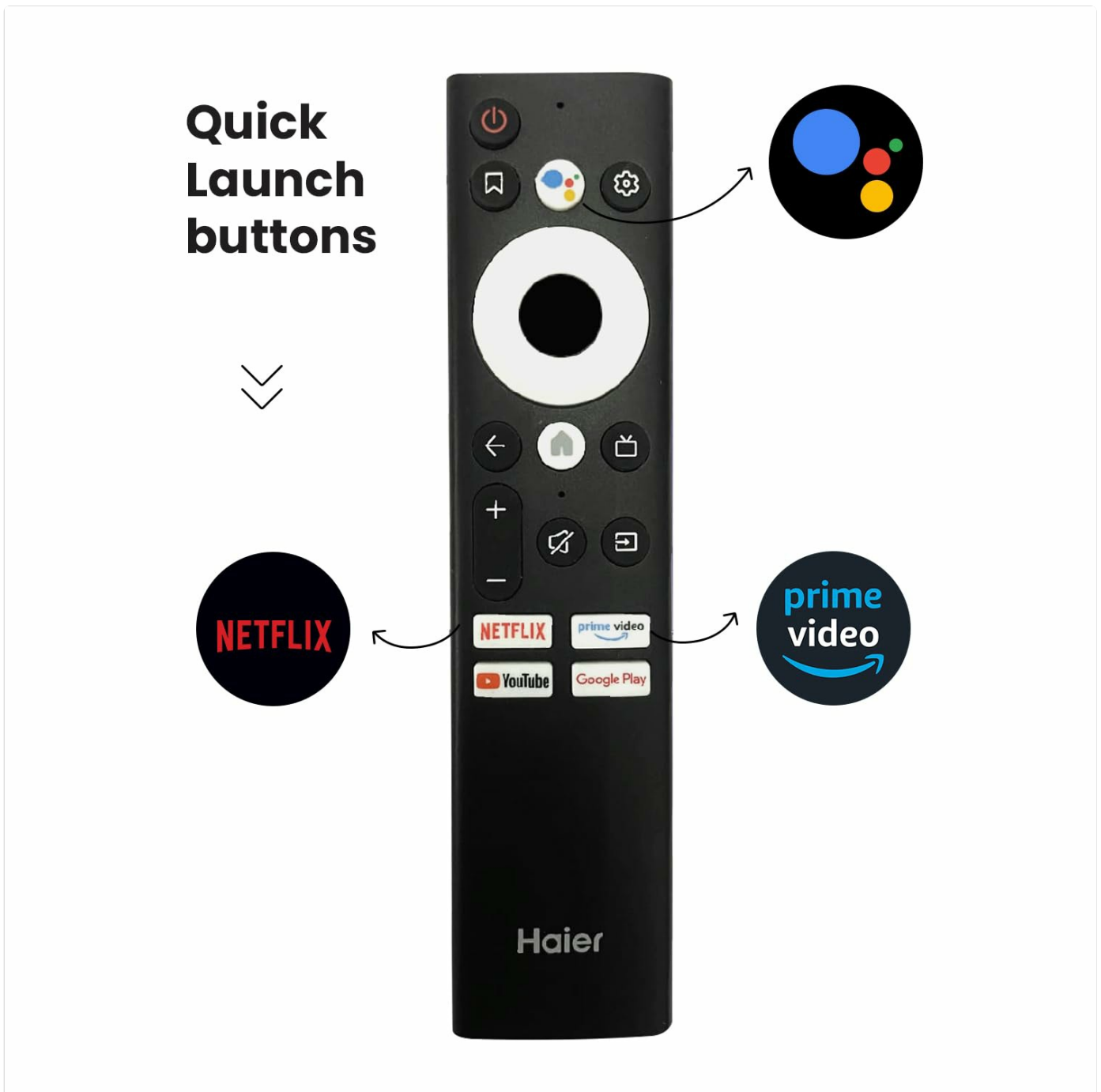
Image: The Google TV interface displayed on the Haier TV, illustrating easy access to various streaming applications like Netflix, Prime Video, YouTube, and more.