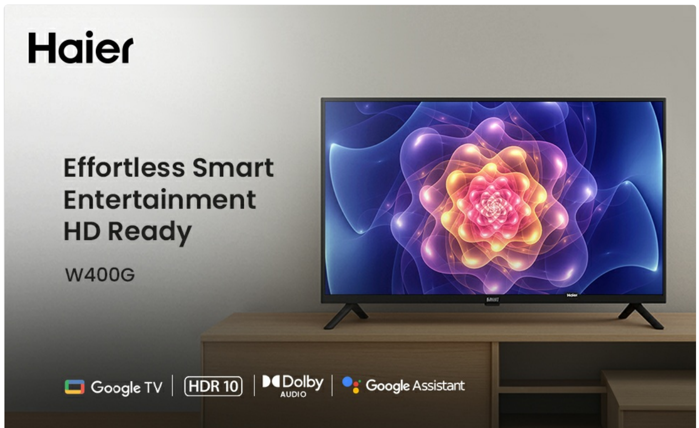
Image: Haier 32-inch HD Ready Smart LED Google TV, model LE32W400G-N, showcasing its sleek design and Google TV interface.

This manual provides essential information for the safe and efficient operation of your new Haier 80cm (32) HD Ready Smart LED Google TV, model LE32W400G-N. Please read this manual thoroughly before using the television and retain it for future reference.