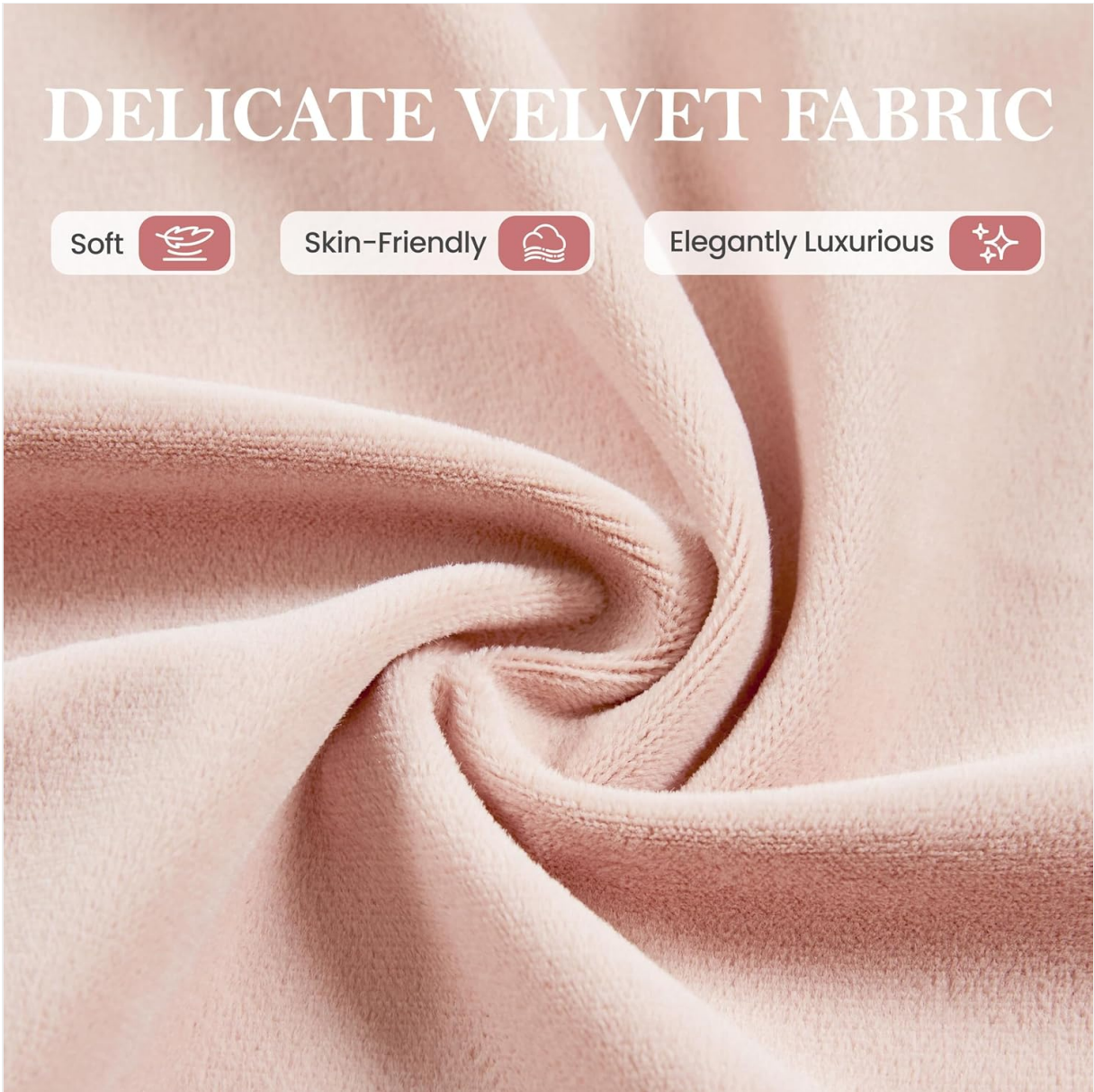
Image: A detailed view of the velvet fabric, emphasizing its texture and quality.