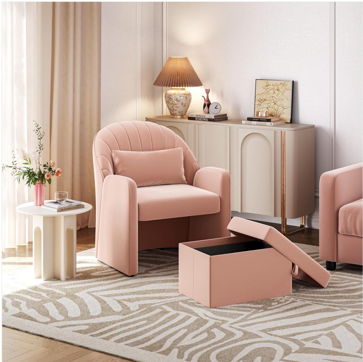
Image: The Yaheetech Small Barrel Accent Chair with its accompanying footrest, showcasing its design and compact nature.