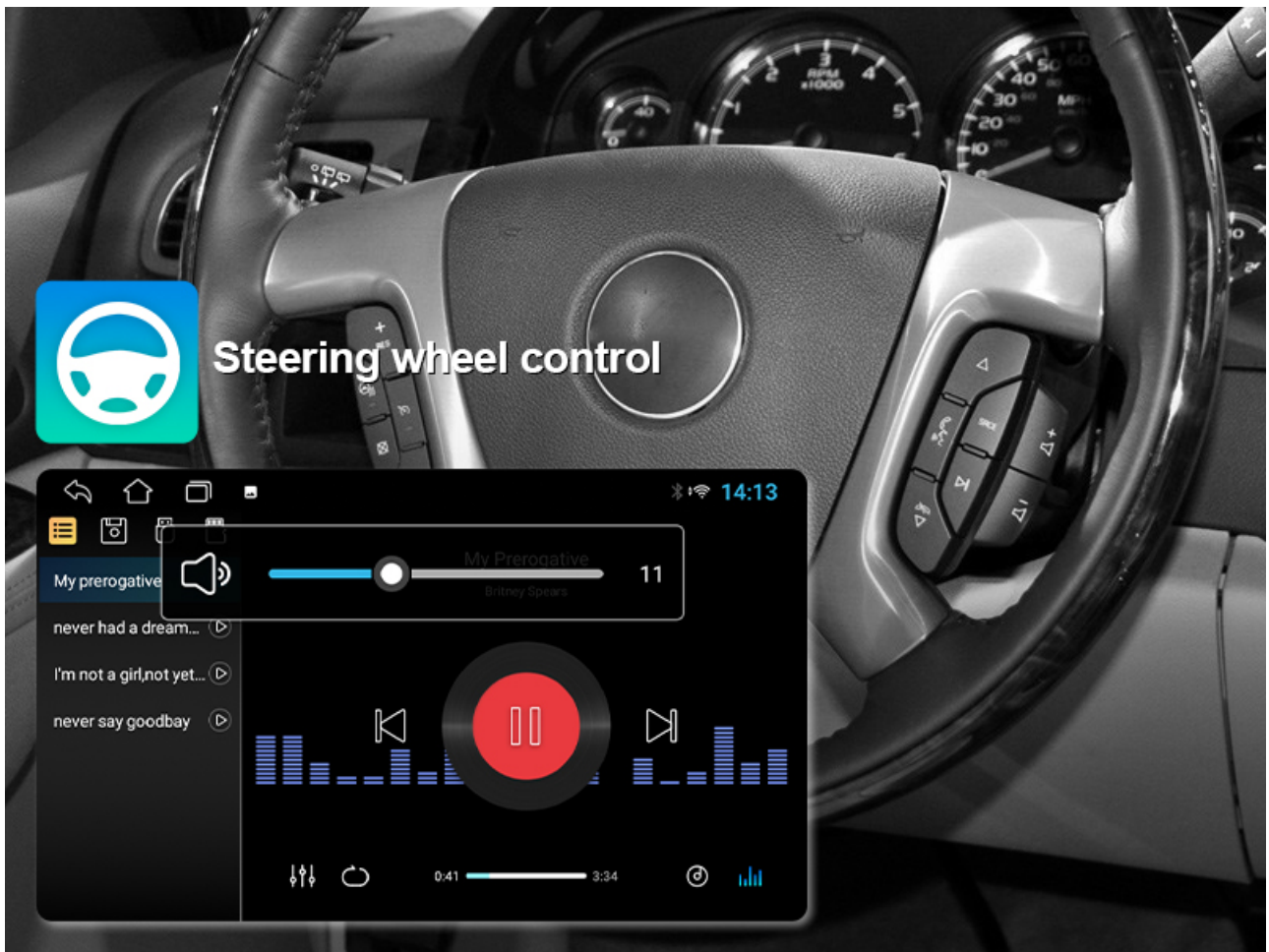
Image: The car stereo screen showing the interface for configuring steering wheel controls, allowing users to assign functions to physical buttons.