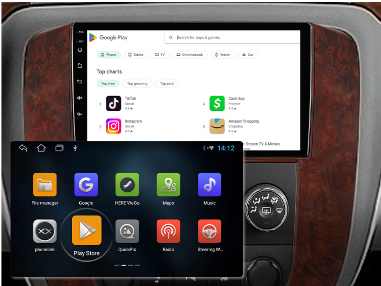
Image: The car stereo screen showing the Google Play Store interface, indicating the ability to download various Android applications.