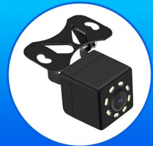
Image: Overview of the FeirTon car stereo package contents, showing the main unit, various cables, GPS antenna, and a backup camera.