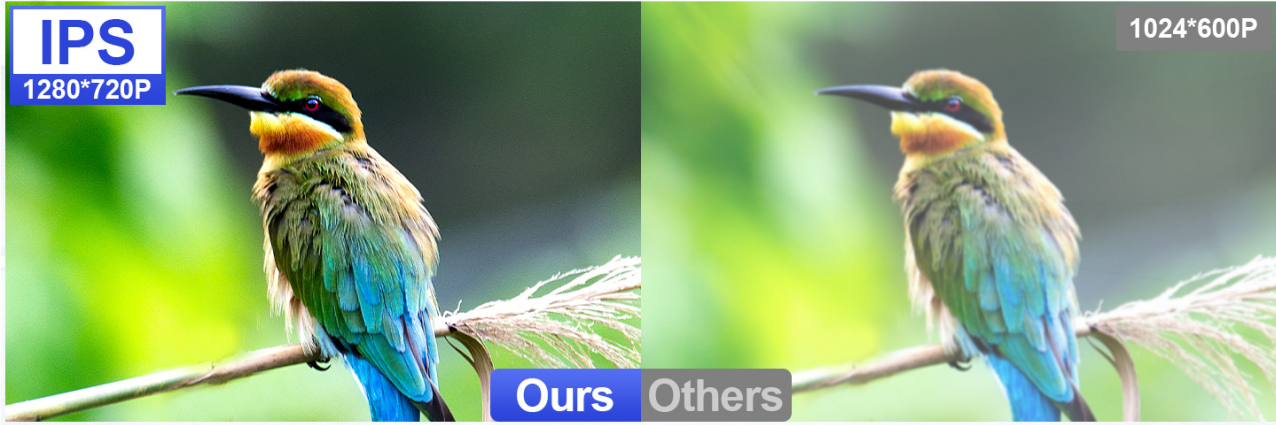
Image: A comparison showing the clarity and resolution of the 1280x720P IPS HD screen versus a lower resolution screen.

With IPS HD Screen, Resolution: 1280*720P