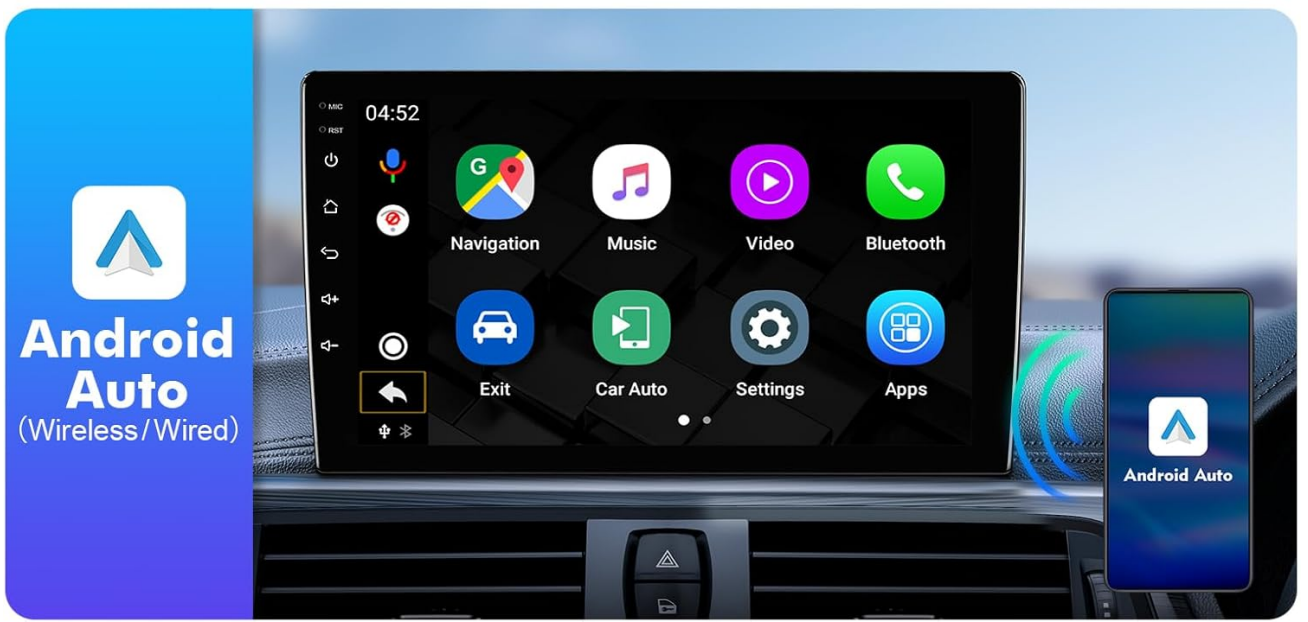
Image: The car stereo displaying both Apple CarPlay and Android Auto interfaces, showing various app icons and navigation.