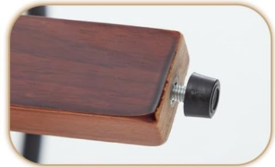
Chair leg nail