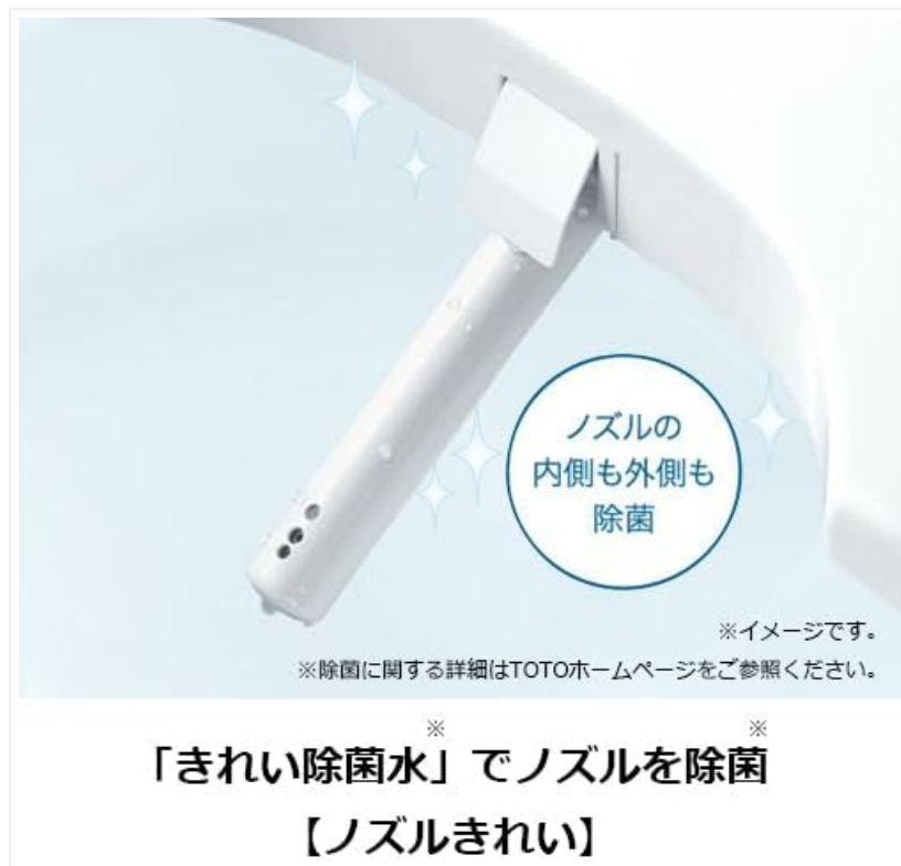
Image: Close-up view of the Washlet nozzle, illustrating the "Nozzle Clean" function where both the inner and outer surfaces of the nozzle are sterilized with Kirei Water.