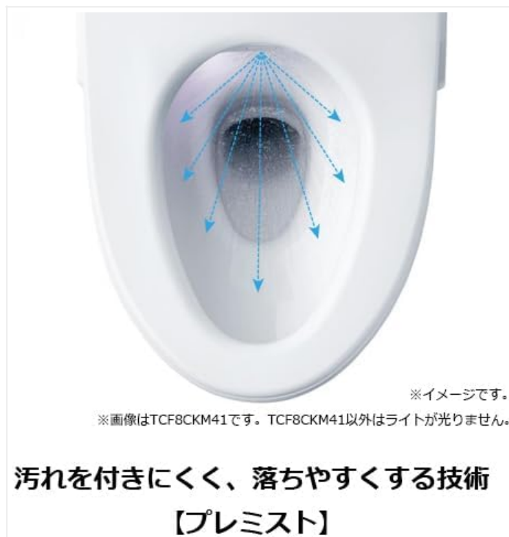
Image: Diagram showing the "Premist" function, where water is sprayed into the toilet bowl to prevent dirt adhesion. Note: This image is for TCF8CKM41; models other than TCF8CKM41 do not have the light feature.