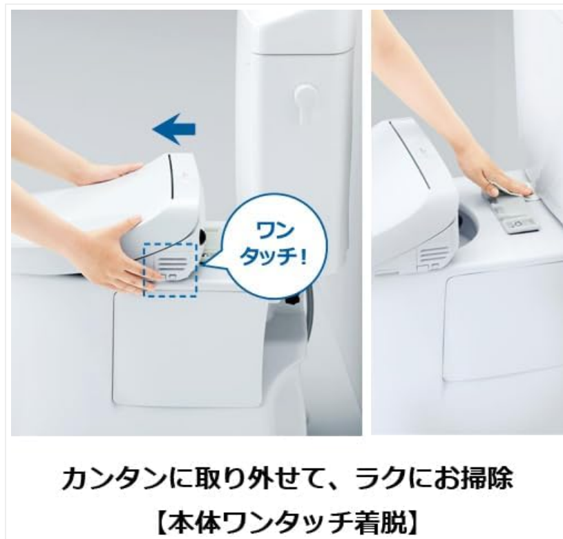
Image: Illustration of the "One-Touch Seat Removal" feature, showing how to easily detach the toilet seat for cleaning by pressing a side switch and sliding it forward.