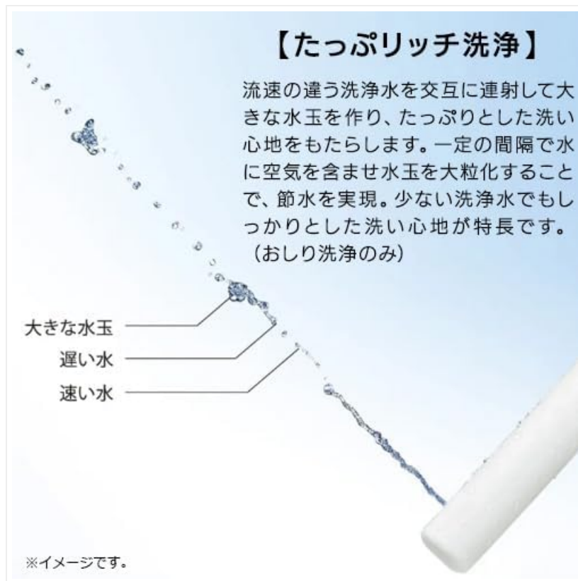
Image: Diagram illustrating the "Rich Wash" function. It shows large water droplets formed by alternating slow and fast water streams, designed for a comfortable and water-saving wash. This feature applies to rear wash only.