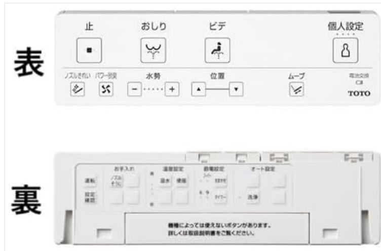
Image: Front and back view of the TOTO Washlet TCF8CKM11 remote control. The front shows buttons for stop, rear wash, bidet wash, personal settings, nozzle cleaning, power deodorizer, water pressure adjustment, nozzle position adjustment, and move function. The back shows maintenance and setting buttons.

batteries, base plate set, warranty card, instruction manual.