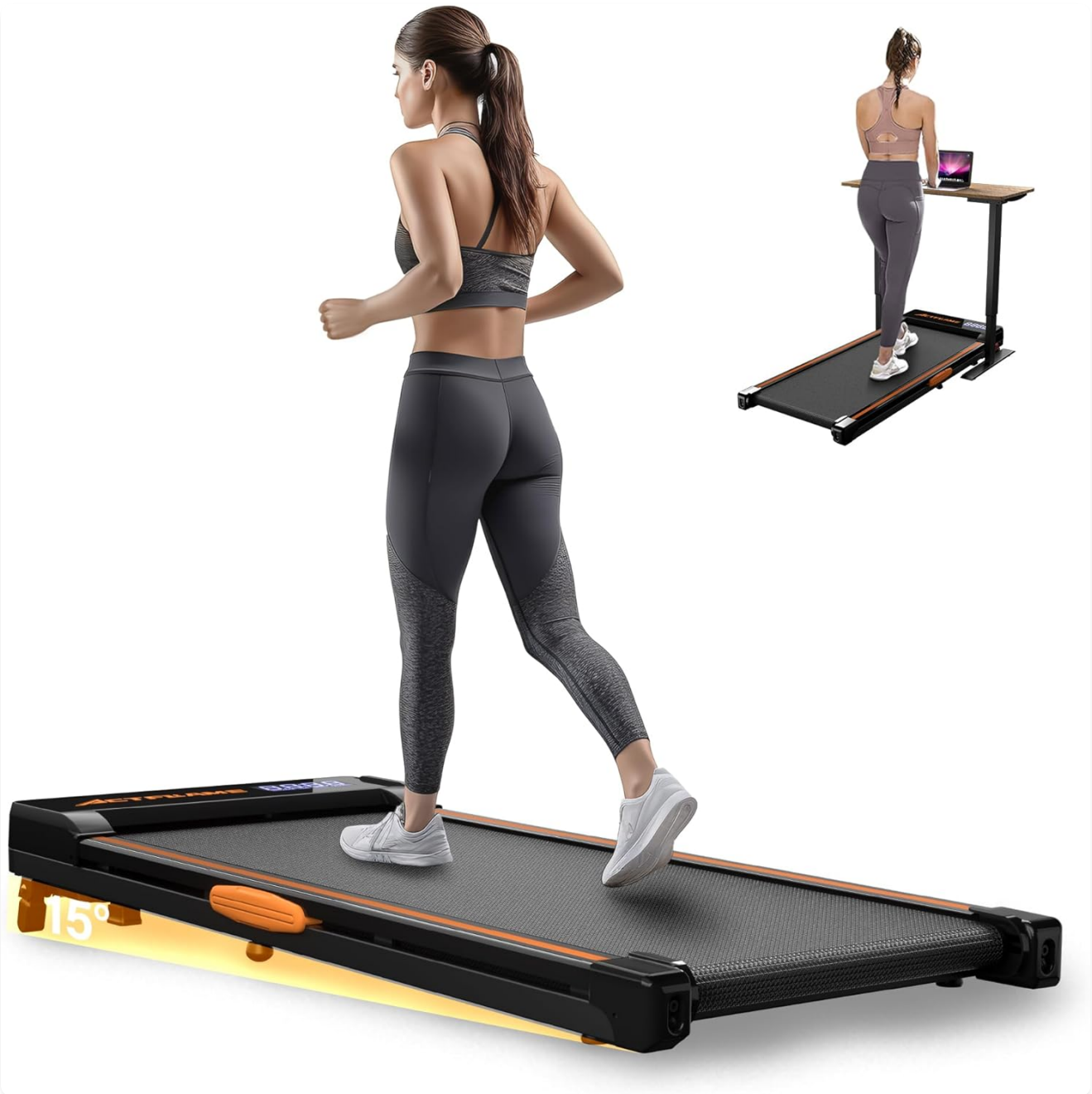
Figure 2.1: The ACTFLAME Walking Pad with Incline, showcasing its compact design and integrated display.