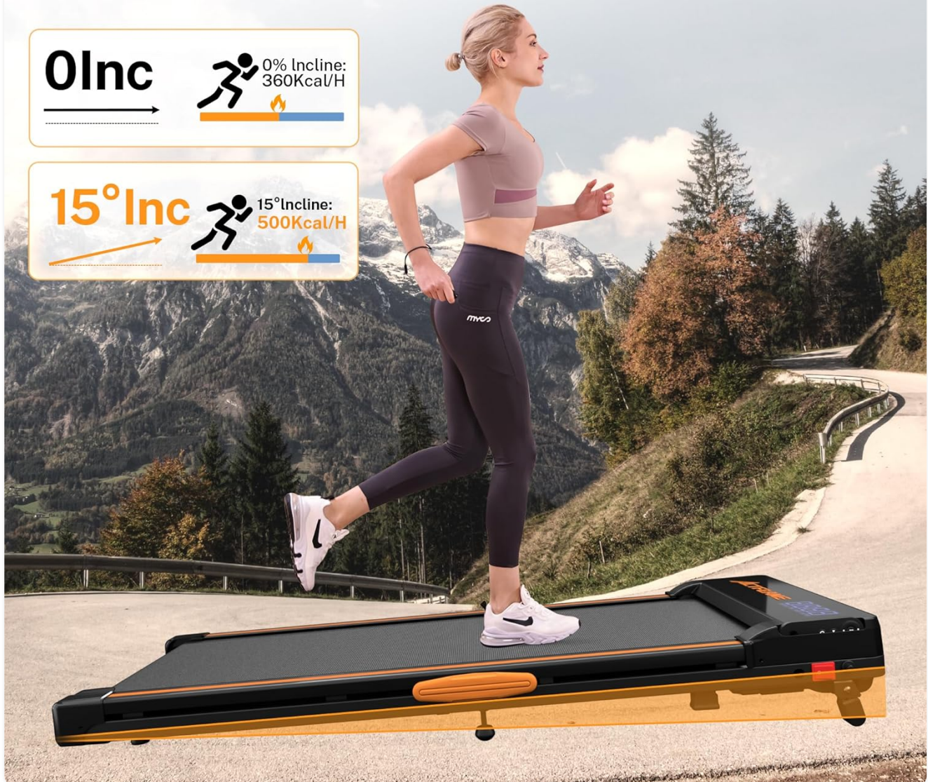
Figure 4.1: Demonstrating the manual incline adjustment mechanism.