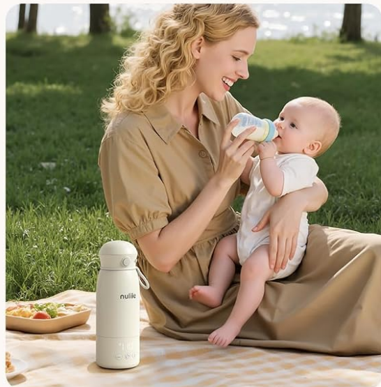
Figure 7: Versatile use of the Nuliie warmer for preparing baby formula anytime, anywhere.