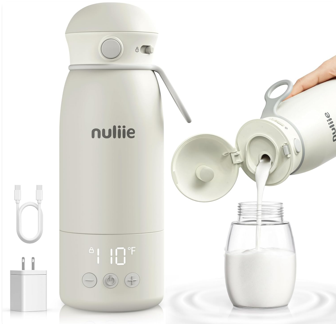
Figure 2: Contents of the Nuliie Portable Milk Warmer package.