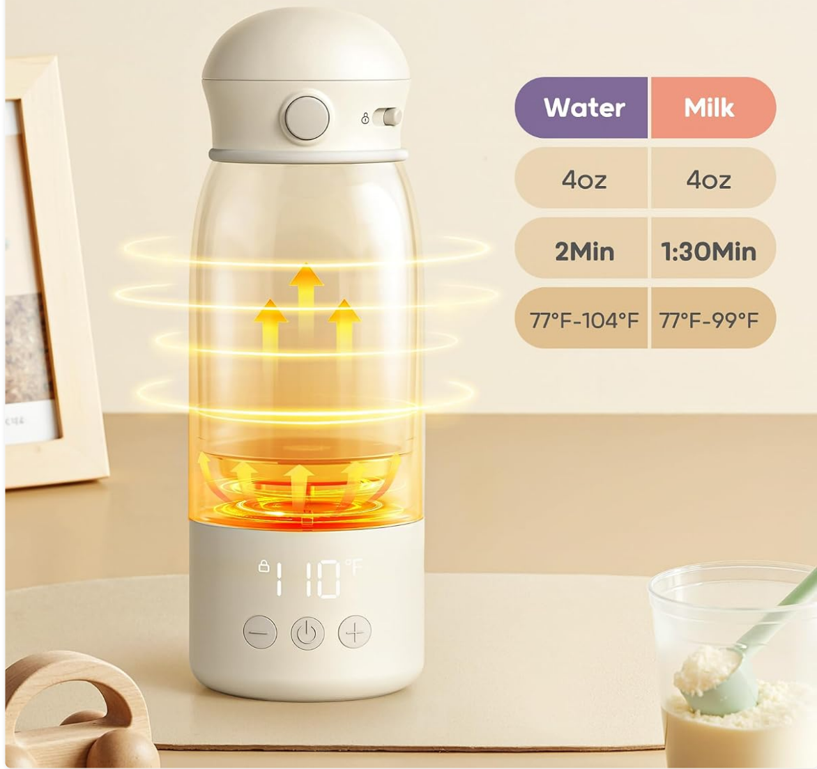
Figure 3: Fast heating capabilities of the Nulii warmer.

More Time for Moms, Instant Comfort for Babies