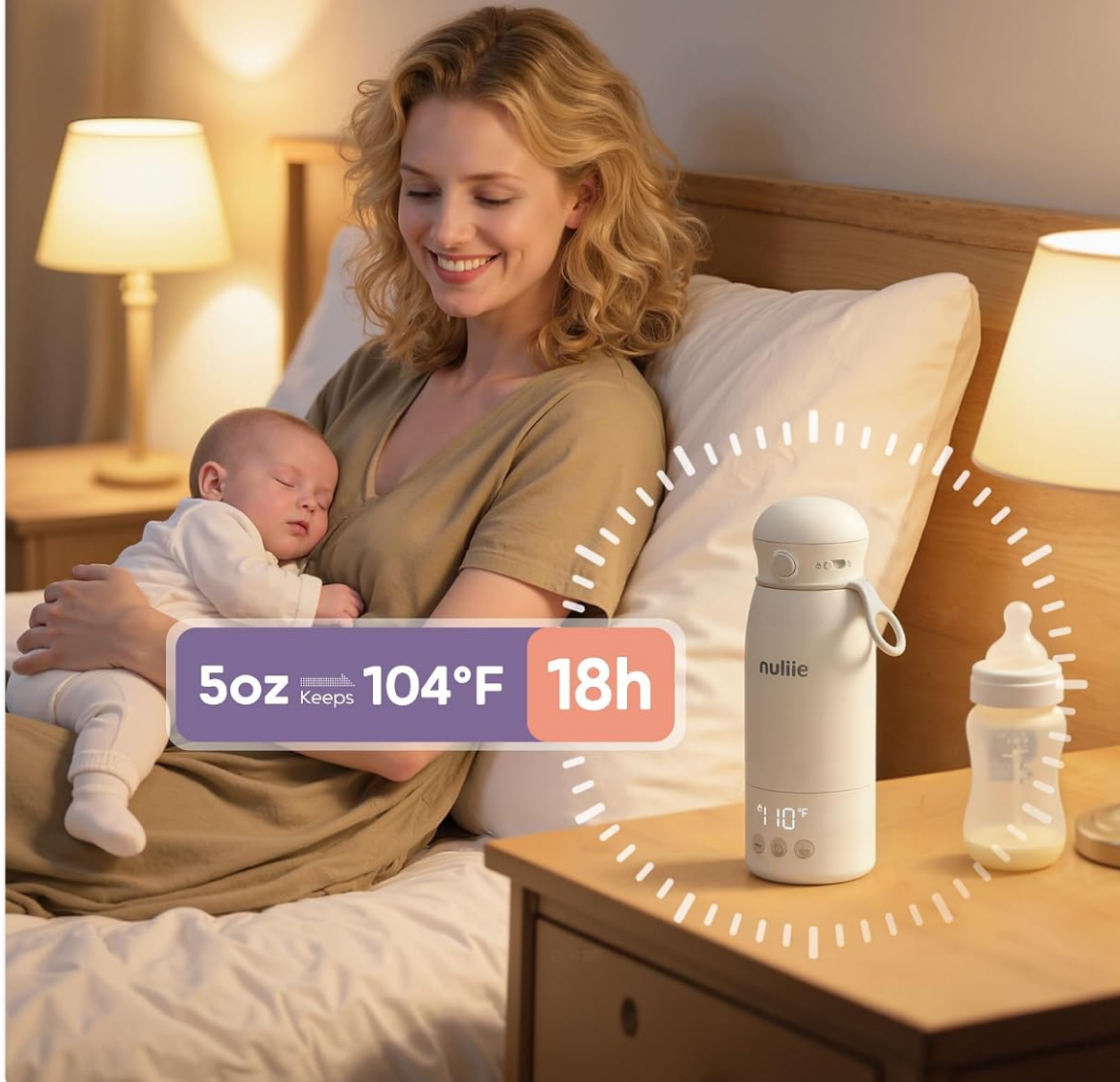
Figure 4: The warmer's excellent heat retention for convenience.