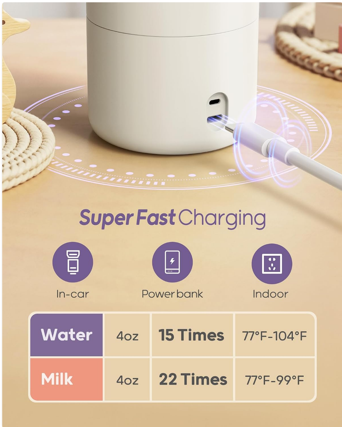
Figure 5: Charging options for the Nullie warmer.