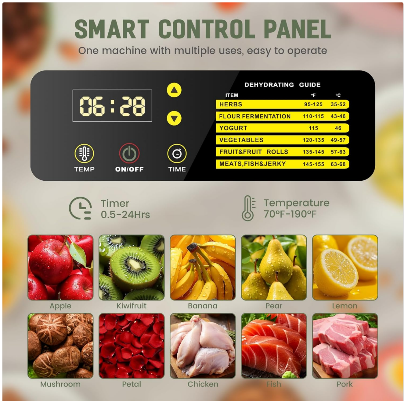
Image: Close-up of the dehydrator's smart control panel, showing digital display for time, buttons for temperature and timer adjustment, and a guide for recommended drying temperatures and times for different food types.

The Cercker dehydrator features a smart control panel for precise temperature and time management.