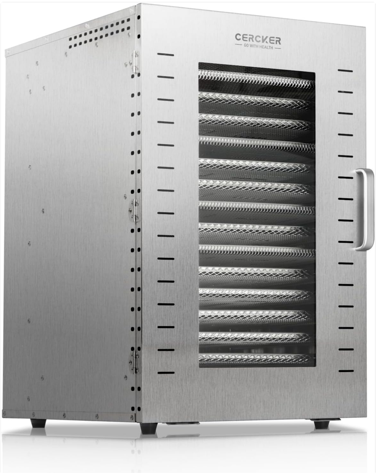
Image: Front view of the Cercker Commercial Food-Dehydrator Machine, showcasing its stainless steel construction and clear door for viewing contents.