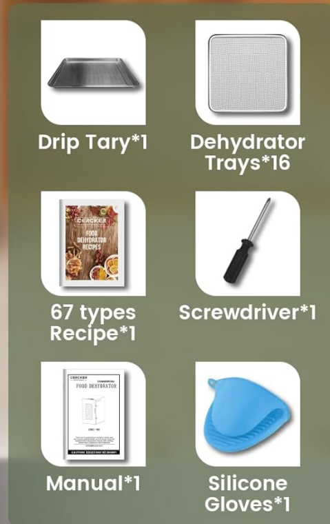
Image: A visual representation of the items included with your dehydrator: the main unit, 16 dehydrator trays, a drip tray, a recipe book, a screwdriver, and silicone gloves.