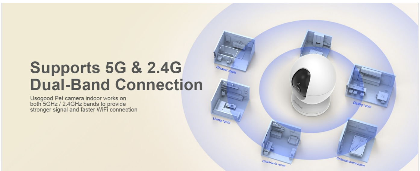
Image: The camera's pan and tilt function provides 360-degree coverage, ensuring no corner of your home is missed.