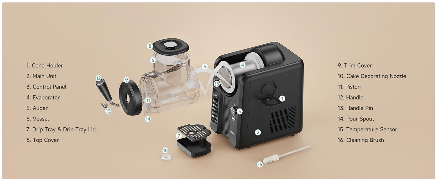
Figure 2.2: Exploded view of HiCOZY F3 components.