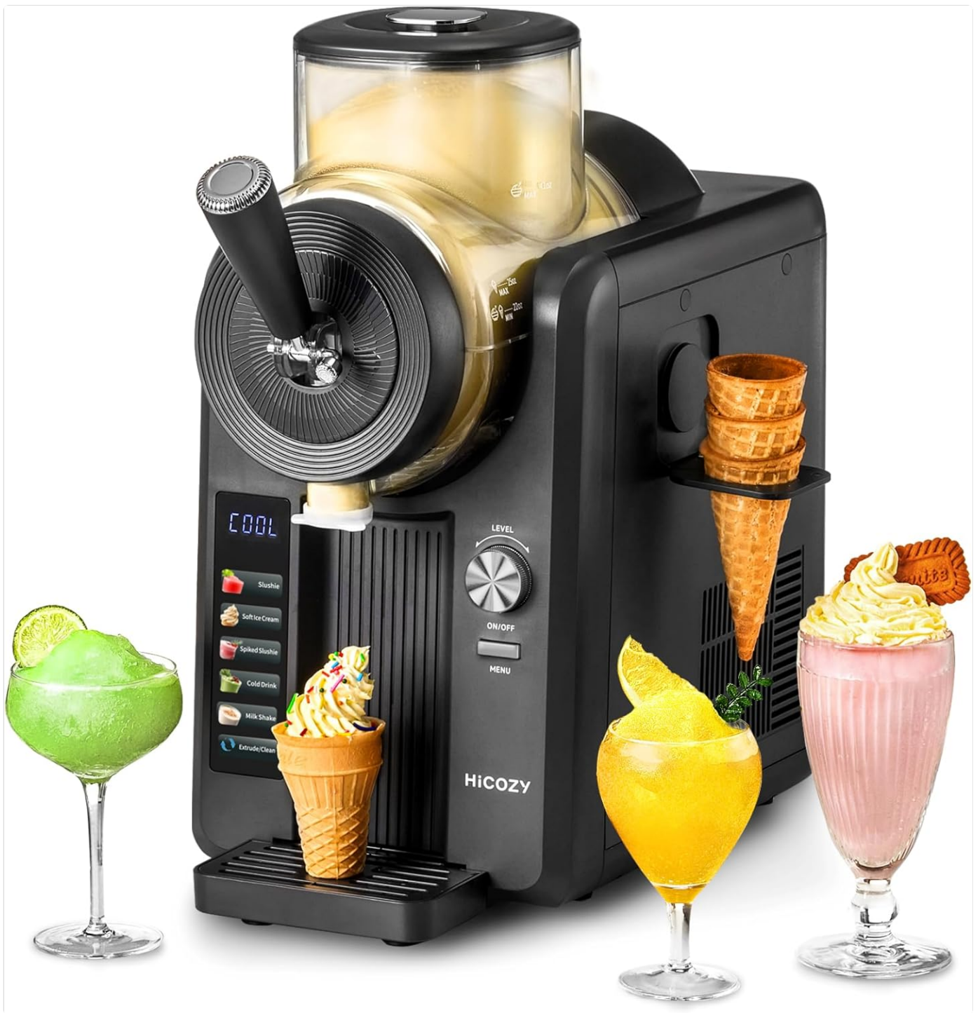
Figure 2.1: HiCOZY F3 Machine with example frozen beverages.