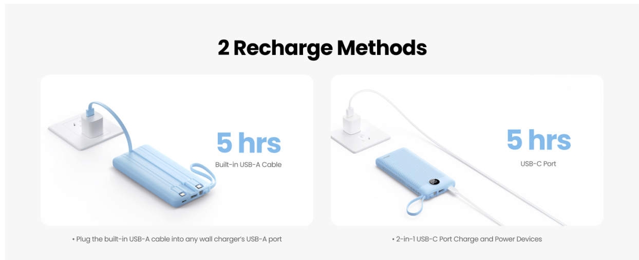
Image: This illustration shows two ways to recharge the power bank. One method shows connecting the built-in USB-A cable to a wall adapter. The second method shows connecting an external USB-C cable to the power bank's USB-C input port. Both methods are indicated to take approximately 5 hours.