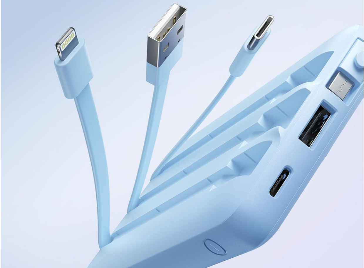
Image: The top side of the power bank, highlighting the four integrated cables (USB-C, USB-A, Micro USB, Lightning) and the two external ports (USB-C Port, USB-A Port) for versatile connectivity.