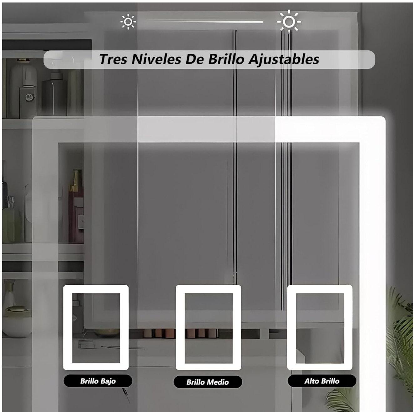
Image: The LED mirror offers three distinct brightness settings: Low, Medium, and High, controlled by a touch sensor.