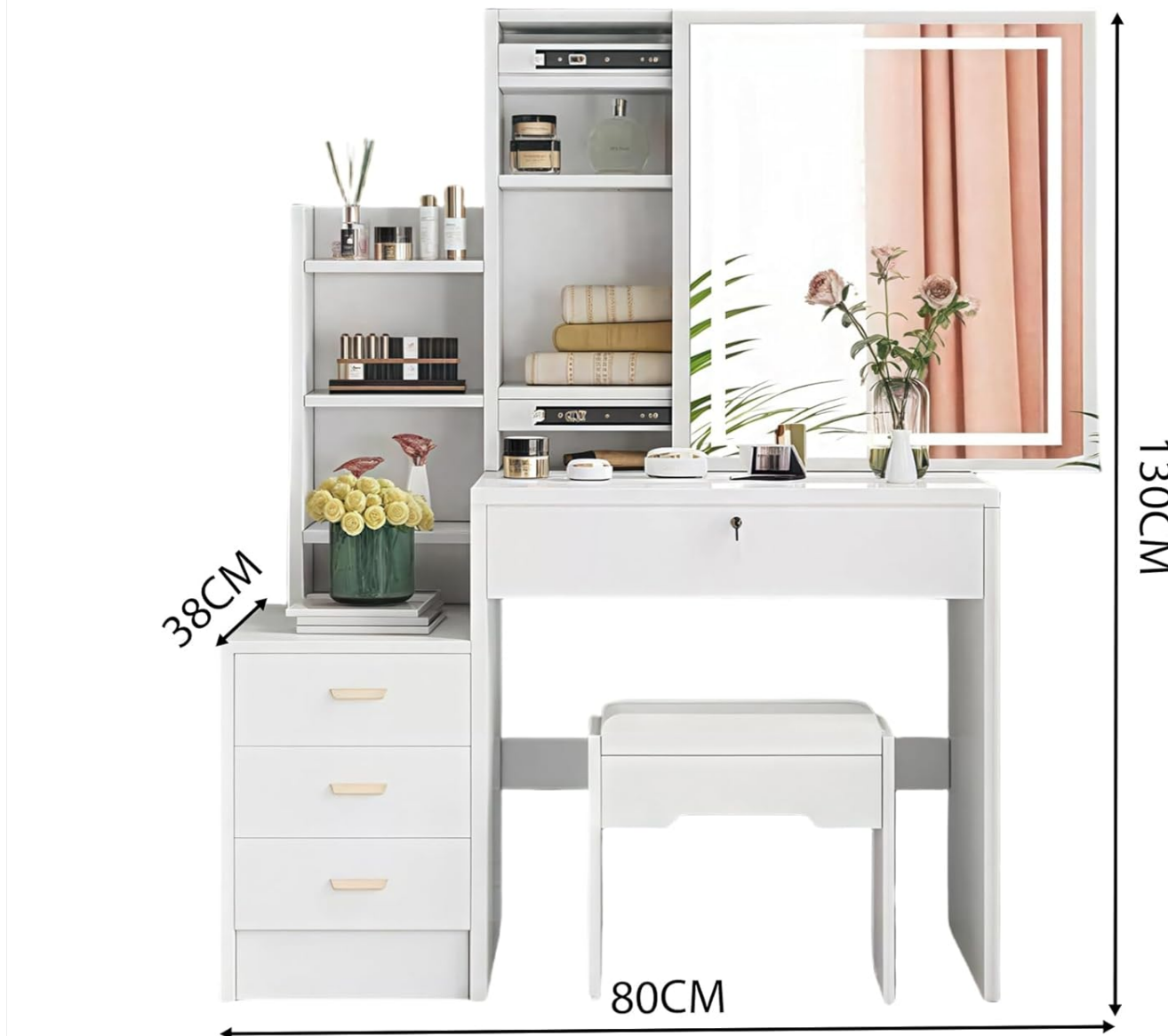
Image: Diagram illustrating the overall dimensions of the TRIUMPHKEY Vanity: 80cm width, 38cm depth, and 130cm height.