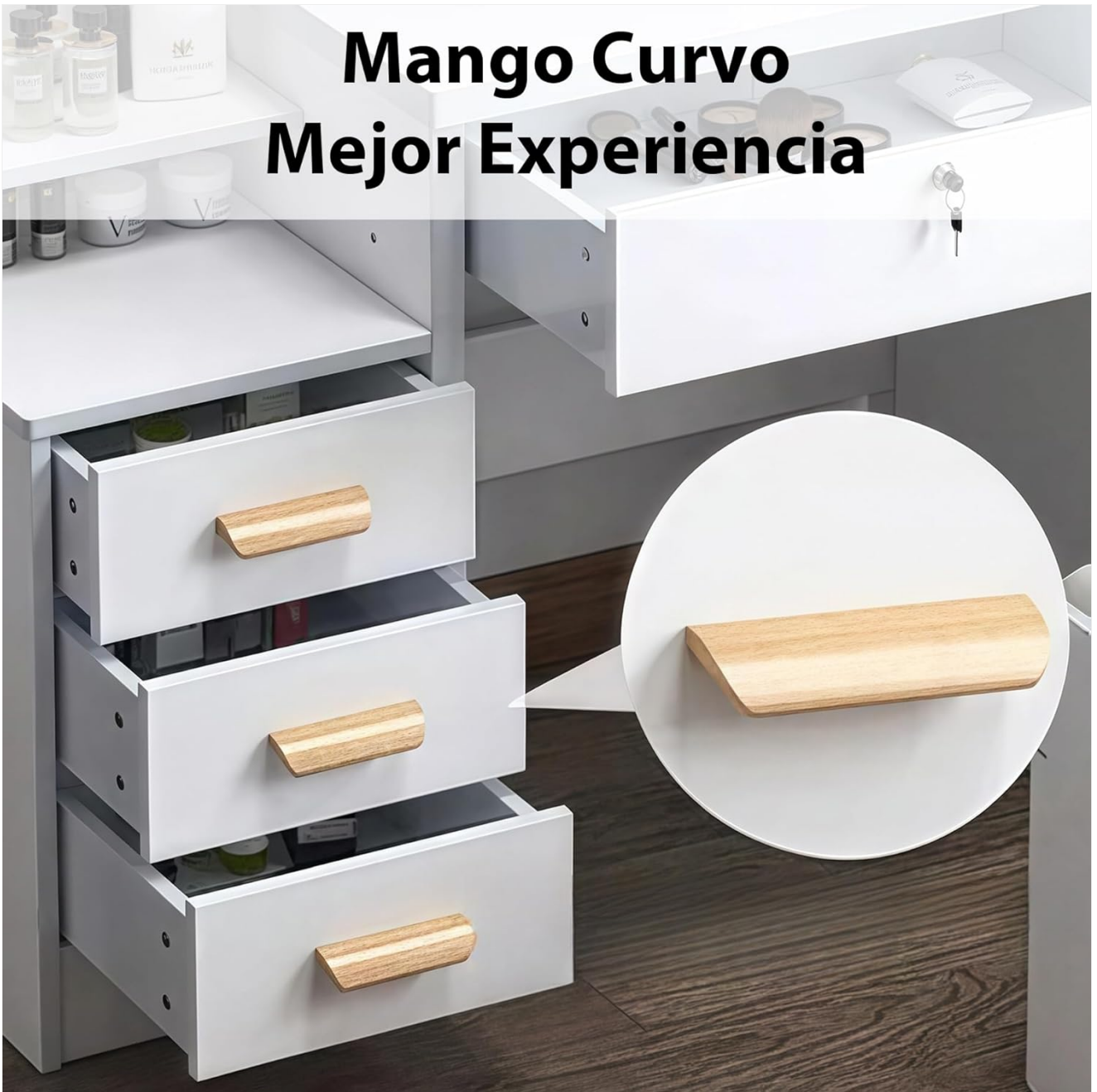
Image: Close-up of the ergonomically designed curved wooden handles on the vanity drawers, providing a comfortable grip.