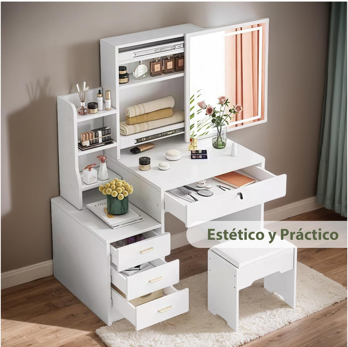
Image: Overview of the TRIUMPHKEY Vanity with LED Light Mirror, storage, and accompanying stool.