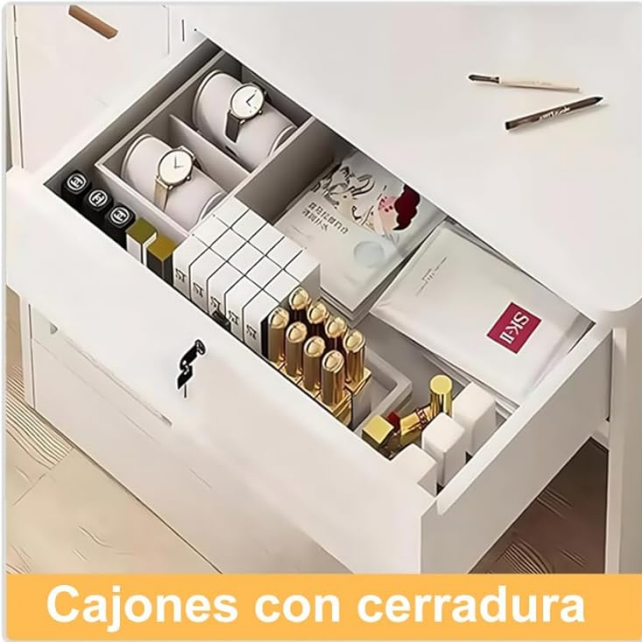
Cajones con cerradura