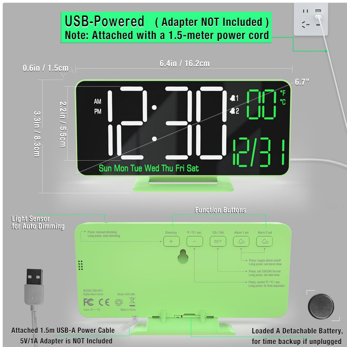
Image: Rear view of the digital clock showing function buttons and ports. Buttons include Dimming (+/-), °F/°C/Sec (-), 12h/24h (SET), Alarm 1 Set, and Alarm 2 Set. A light sensor is visible on top.