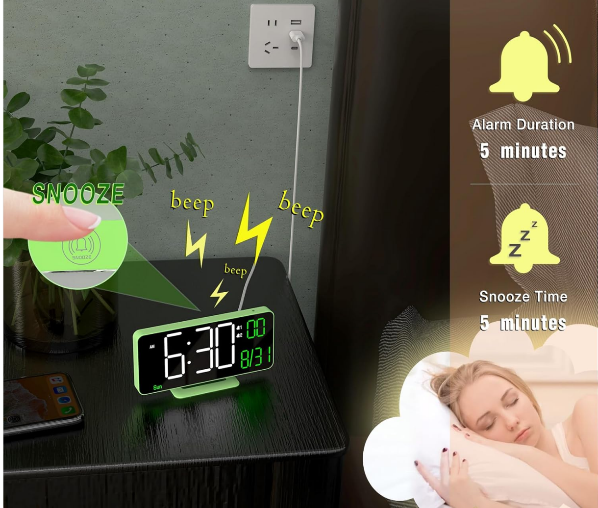
Image: The digital clock displaying an alarm time of 6:30 with a snooze function indicated. The alarm duration is 5 minutes, and snooze time is 5 minutes.