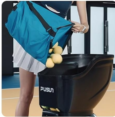
2 Load Tennis ball