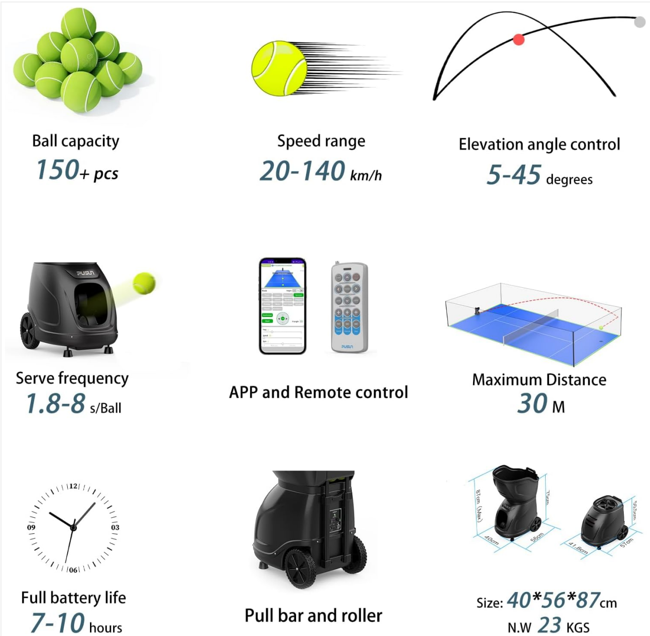
Image 8.1: An infographic summarizing key specifications such as ball capacity, speed range, elevation angle, serve frequency, control methods, maximum distance, and battery life.