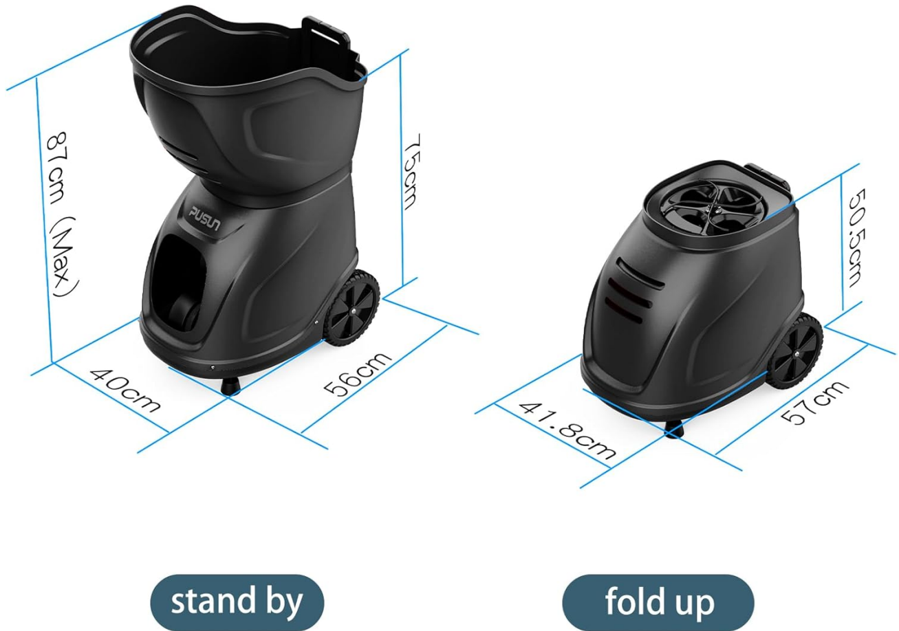
Image 8.2: Dimensions of the PUSUN PT 9001 in both its operational (stand-by) and compact (folded) states, with measurements in centimeters.