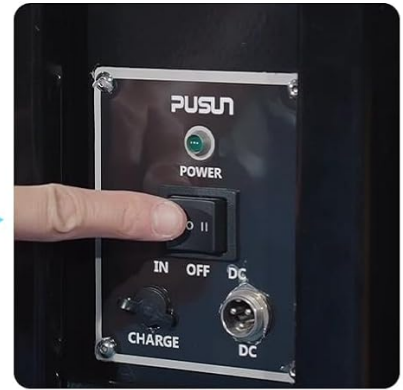
3 Press the power switch