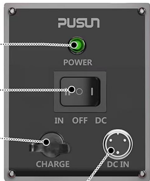
Image 2.2: Detailed view of the PUSUN PT 9001 Padel Ball Machine's components, including the retractable pull rod, ball frame, window, launch port, serve wheel, moving wheel, power indicator, IN/DC switch, charging port, and DC port.