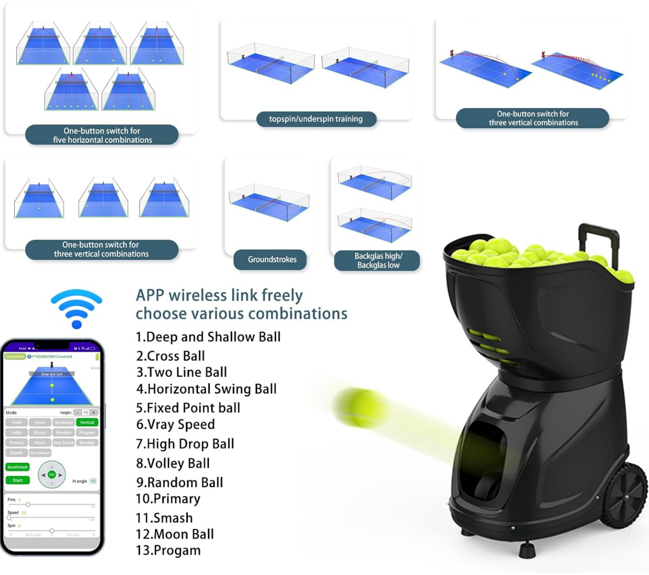
Image 4.1: An illustration of the diverse training modes available with the PUSUN PT 9001, including deep and shallow ball, cross ball, two-line ball, horizontal swing ball, fixed point ball, V-ray speed, high drop ball, volley ball, random ball, primary, smash, moon, and program modes.

PT-9001 PRO has more classic combination balls to make your training closer to the actual game