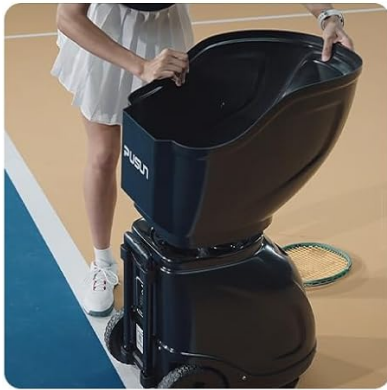
1 Attach the Top Cover(Funnel)