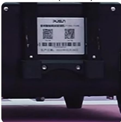
4 Scan the QR code to download the APP