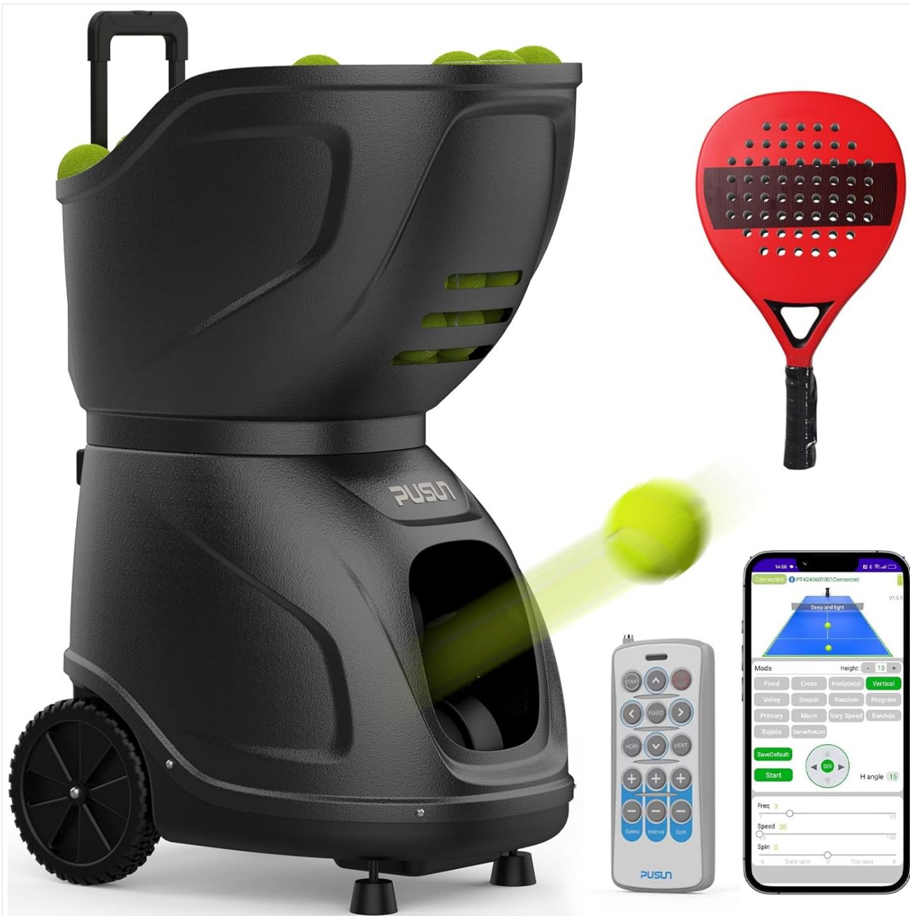
Image 1.1: The PUSUN PT 9001 Padel Ball Machine, showcasing its design, remote control, and smartphone app interface.

The PUSUN PT 9001 PRO offers a superior capacity of over 150 balls and a built-in lithium battery providing 7-10 hours of continuous training. It features complete speed and angle control, allowing ball speeds from 20 to 140 km/h and elevation angles from 5 to 45 degrees. This machine simulates various padel shots, suitable for all skill levels from beginners to advanced players.