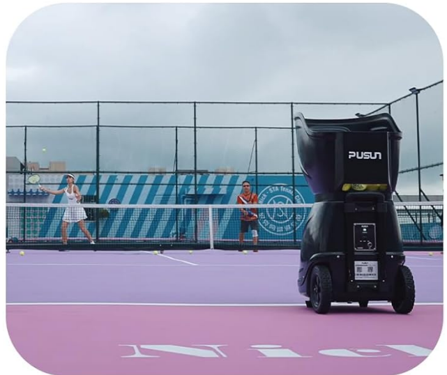
Image 5.1: Visual examples of the PUSUN PT 9001 being easily transported with its pull rod and wheels, stored compactly in a car trunk, and used on a padel court.

Weighing only 23 kg and constructed with high-quality ABS and metal components, the machine combines mobility with durability. It features a retractable pull rod and rollers for convenient movement.