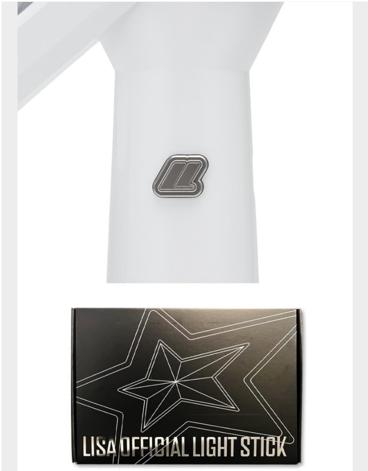
Figure 3: Light Stick Handle and Packaging Box