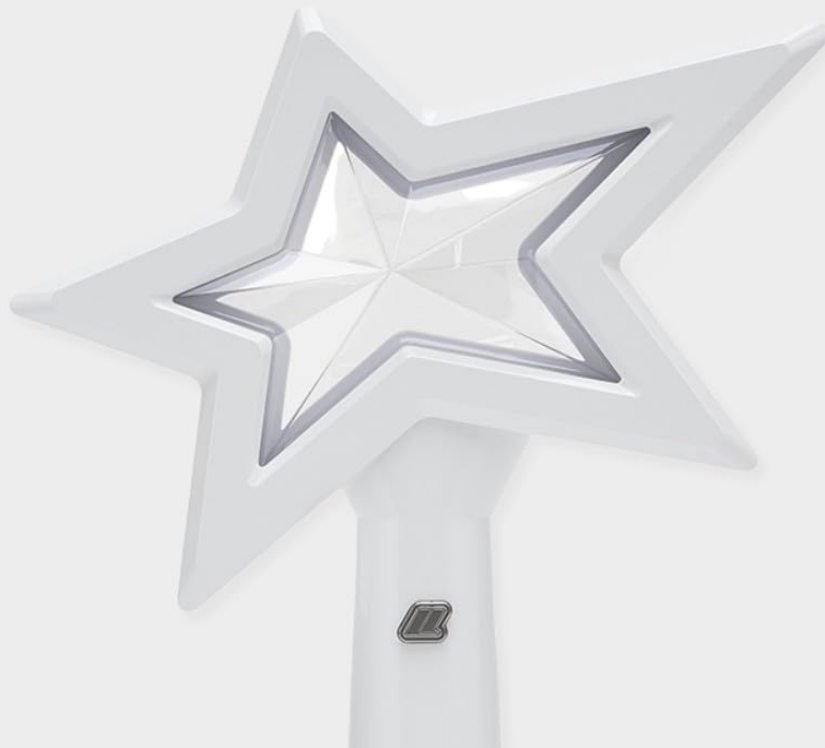
Figure 1: Lisa Official Light Stick - Front View