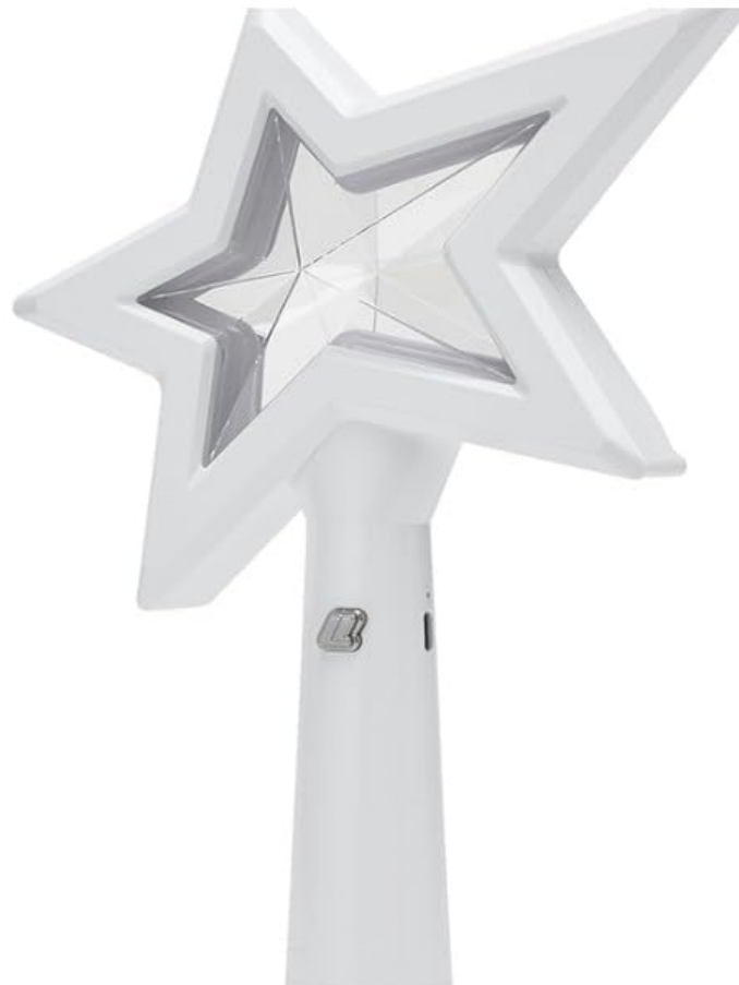
Figure 2: Lisa Official Light Stick - Front and Back Detail