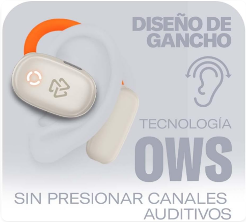
Figure 3: Diagram illustrating the Open Wireless Stereo (OWS) technology and the ergonomic hook design, which ensures comfort without blocking the ear canal.