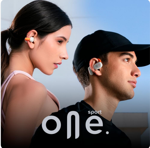
Figure 2: A person wearing the STF Sport One Pro headphones, demonstrating their secure fit around the ear, ideal for active use.