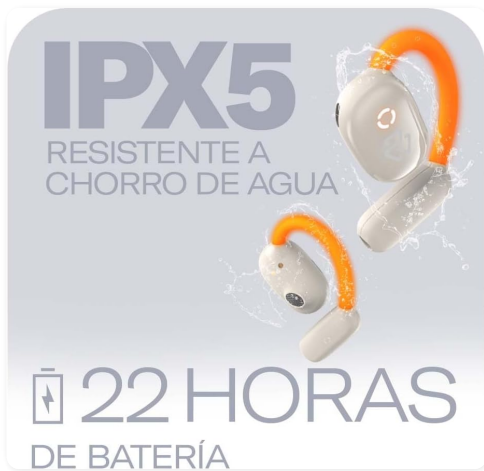
Figure 5: Visual representation of IPX5 water resistance and the impressive 22-hour total battery life (7 hours playback + 2 case charges).