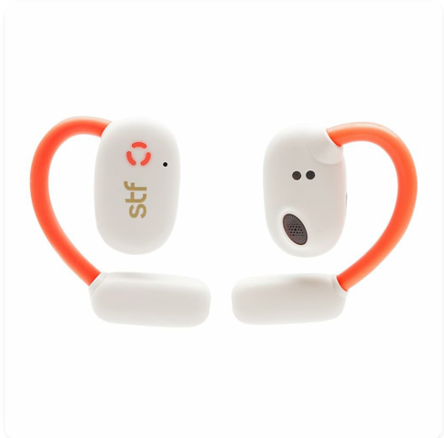
Figure 1 : STF Sport One Pro Open-Ear Headphones. These headphones feature an open-ear design and an ergonomic hook for a secure and comfortable fit.

The STF Sport One Pro headphones feature an open-ear design for comfort and situational awareness, along with an ergonomic hook for a secure fit during activities. The charging case provides additional battery life and protects your headphones.