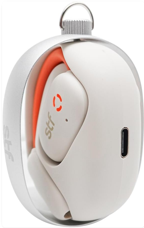
Figure 4: The STF Sport One Pro charging case with the earbuds inside, ready for charging or storage.