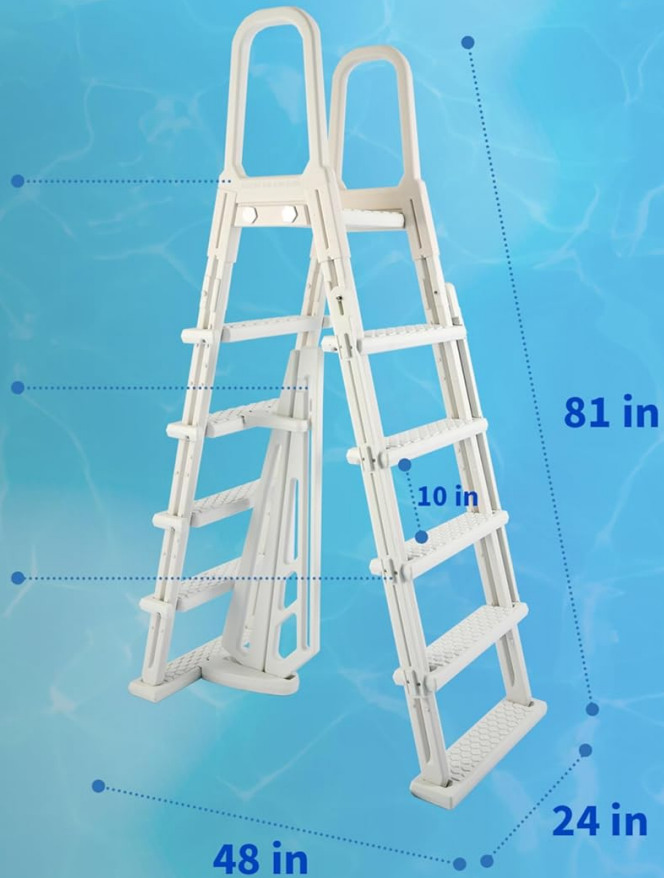
Image: The A-frame ladder, highlighting its safety features and dimensions for secure pool entry and exit.