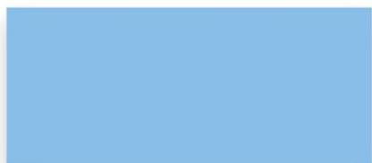
Image: The complete Blue Wave Marbella pool set, including the pool structure, sand filter system, ladder, and maintenance kit.