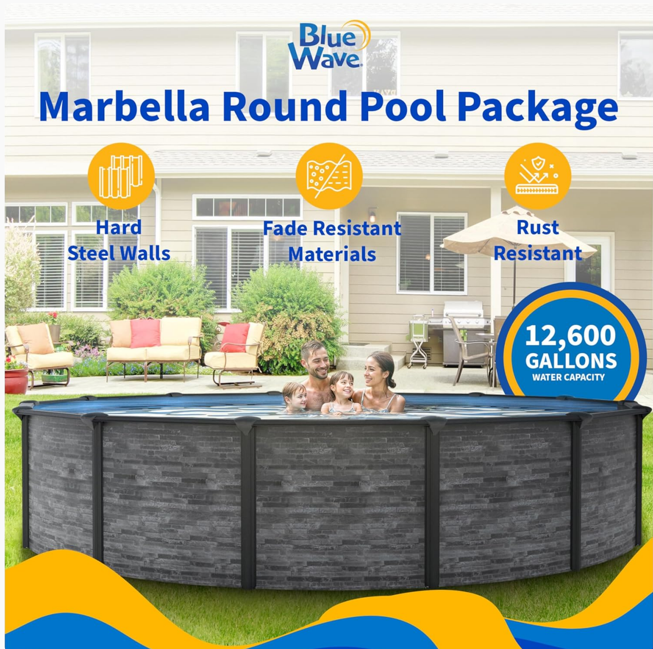
Image: A family enjoying the Marbella pool, emphasizing its robust construction and large water capacity.