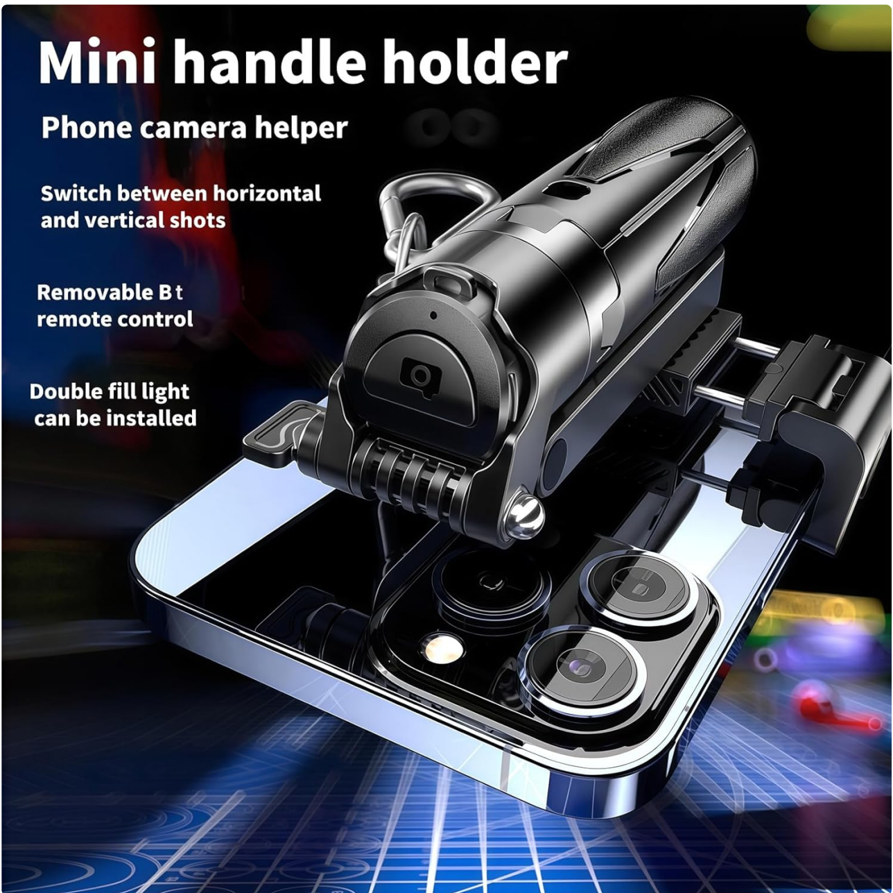
Figure 2: Mini Handle Holder Details. This view highlights the phone clamp area, indicating its ability to switch between horizontal and vertical orientations, the slot for the removable Bluetooth remote, and provisions for attaching external fill lights.