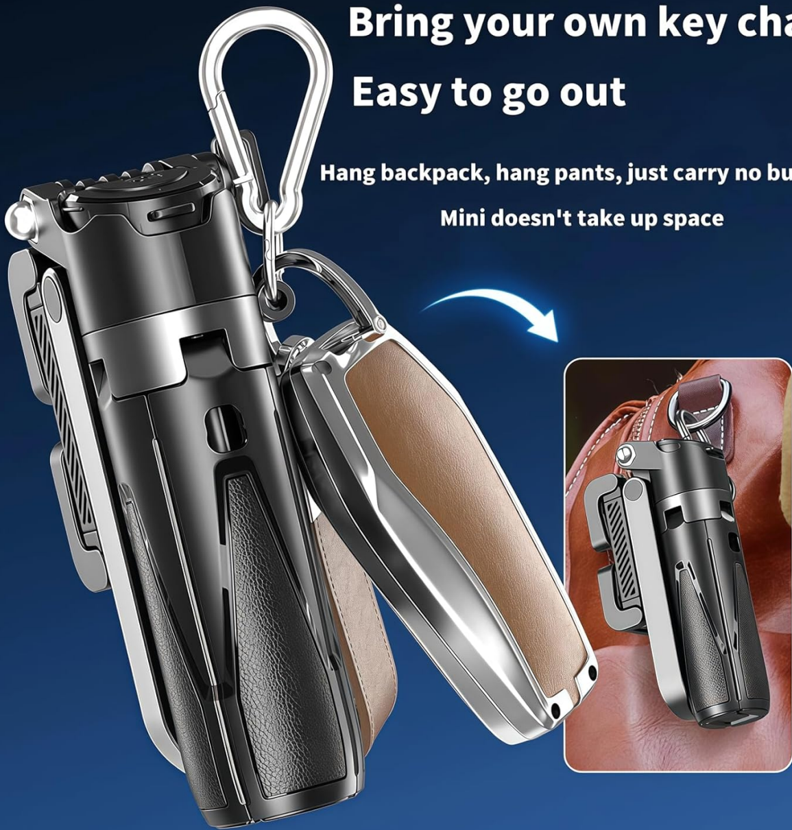
Figure 3: Portability with Keychain. The image demonstrates how the compact Tnw T26 can be easily attached to a keychain or backpack, emphasizing its lightweight and convenient design for on-the-go use.