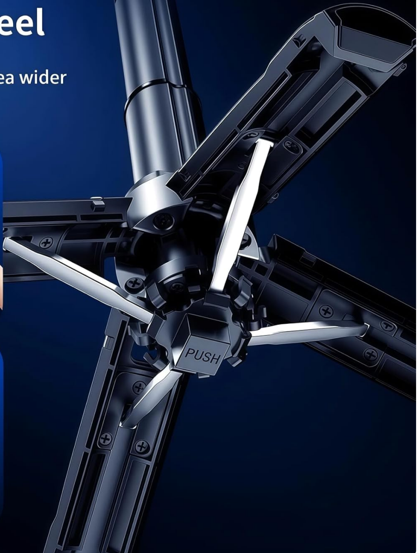
Figure 5: Opening the Tripod. This diagram illustrates the simple "one click" mechanism to deploy the tripod legs, and the "PUSH" button for safely collapsing them, preventing accidental pinching.

One click open to save worry and not pinch hands