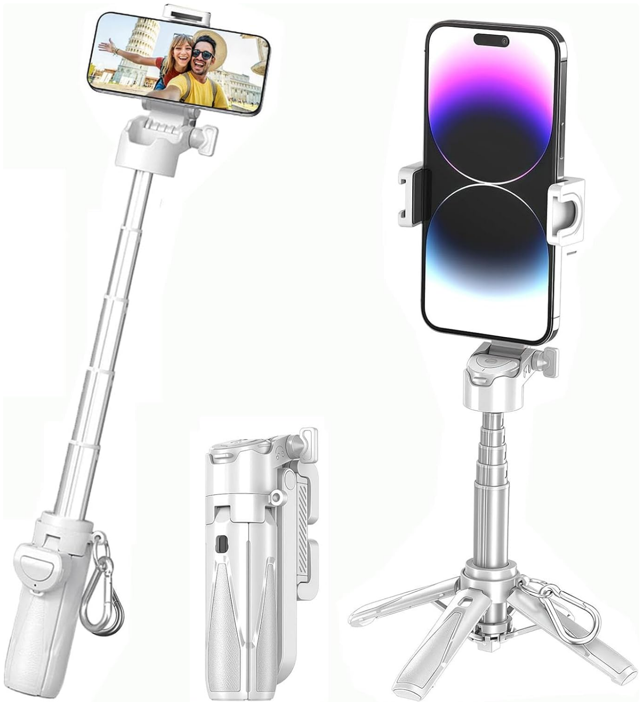
Figure 1: Tnw T26 in Selfie Stick and Tripod Configurations. This image illustrates the product's dual functionality as both an extendable selfie stick and a stable mini tripod, with a phone mounted in both scenarios.