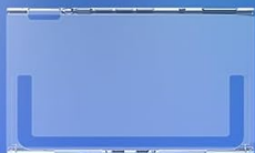
PC Hard Back Cover