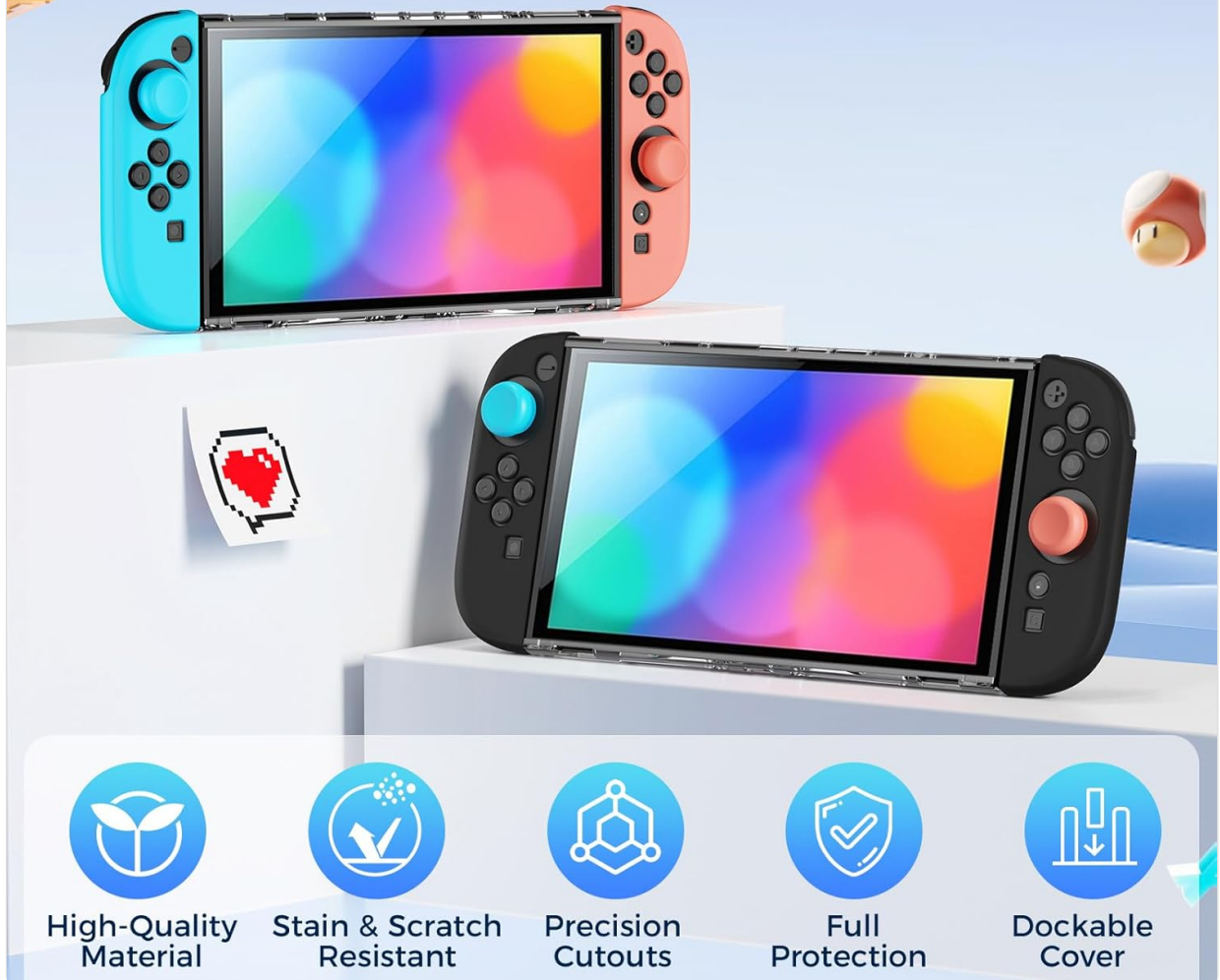
Image: The Switch 2 console, protected by the IINE case, being inserted into its docking station.