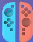
2 Pcs Soft Joypad Cover