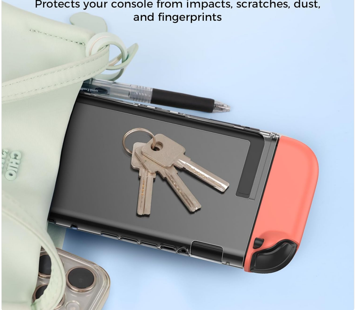
Image: The IINE Protective Case features a hollow design to allow the use of the console's built-in kickstand.

Protects your console from impacts, scratches, dust, and fingerprints