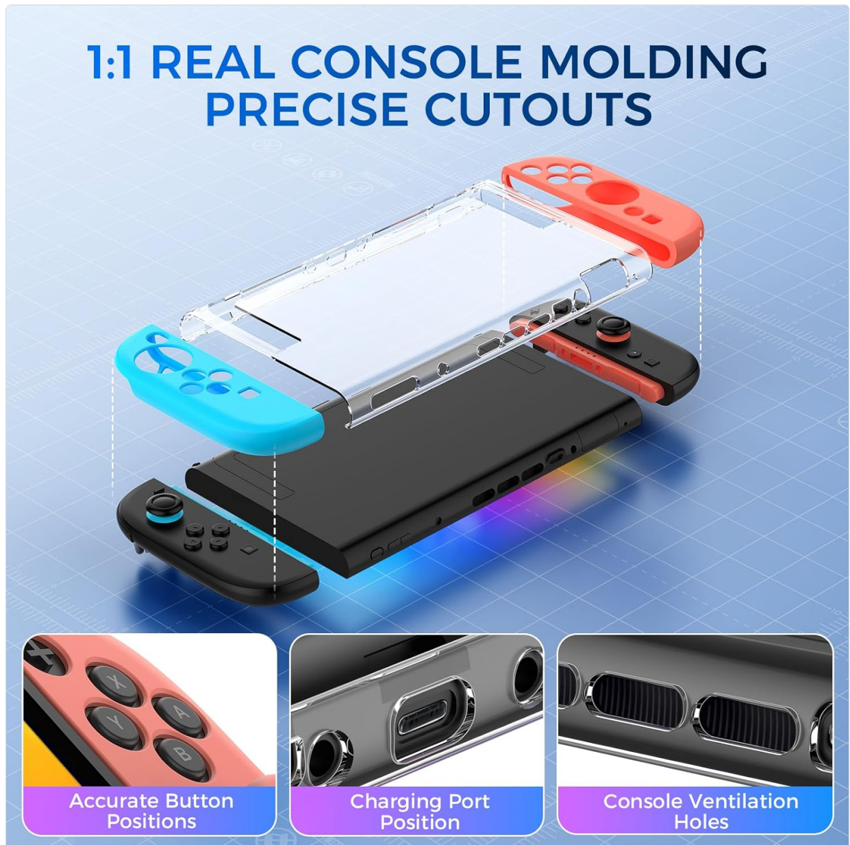
Image: Exploded view showing the precise cutouts for buttons, charging port, and ventilation holes on the IINE Protective Case.

Video: Step-by-step installation guide for the IINE Protective Case for Switch 2, demonstrating how to apply the back cover and Joypad covers.