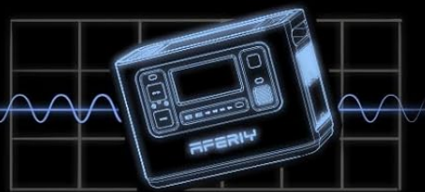
Image: Infographic detailing the AFERIY P210's 10ms UPS, intelligent BMS, and pure sine wave inverter for stable power.

Deliver Ultra-Stable Clean Power to Shield Your Appliances