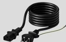
3. AC charging cable