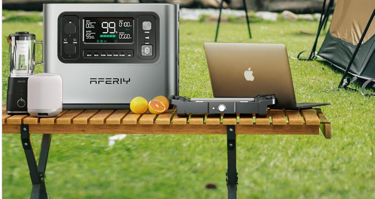
Image: AFERIY P210 powering various devices like a camping light, laptop, phone, and electric kettle in an outdoor setting.