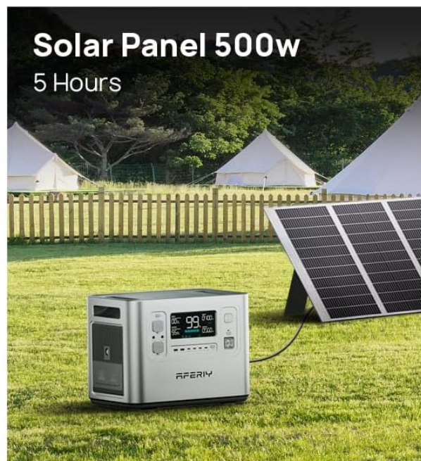
Image: Visual representation of various charging methods for the AFERIY P210, including AC, solar, and car charging.