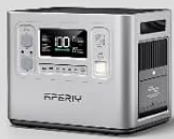
1. AF-P210 power station