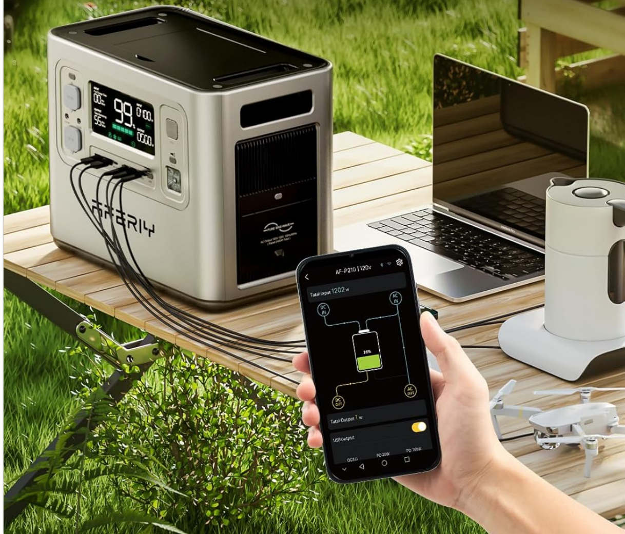
Image: AFERIY P210 connected to a laptop and controlled via a smartphone app, demonstrating remote monitoring capabilities.