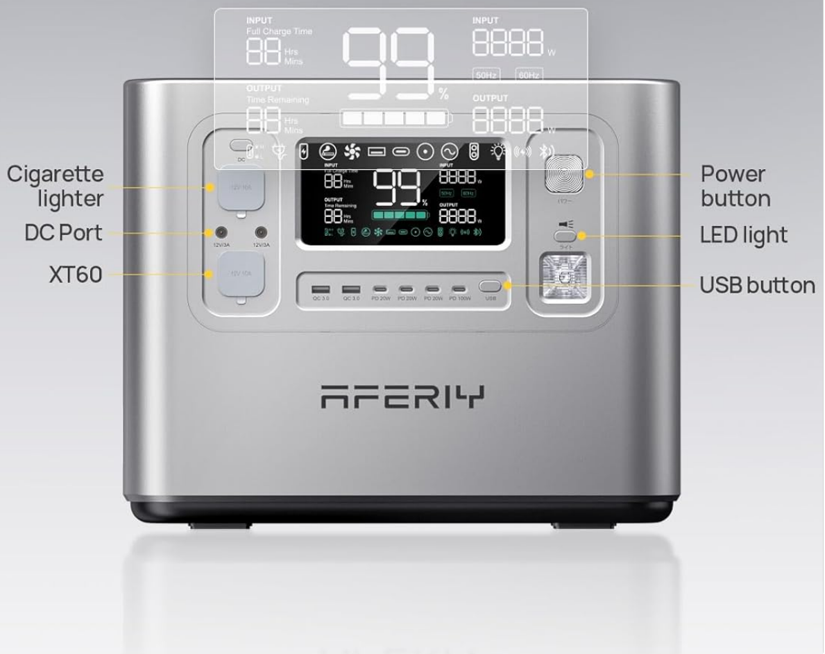
Image: Detailed view of the AFERIY P210's front panel, highlighting the various DC, USB, and display features.