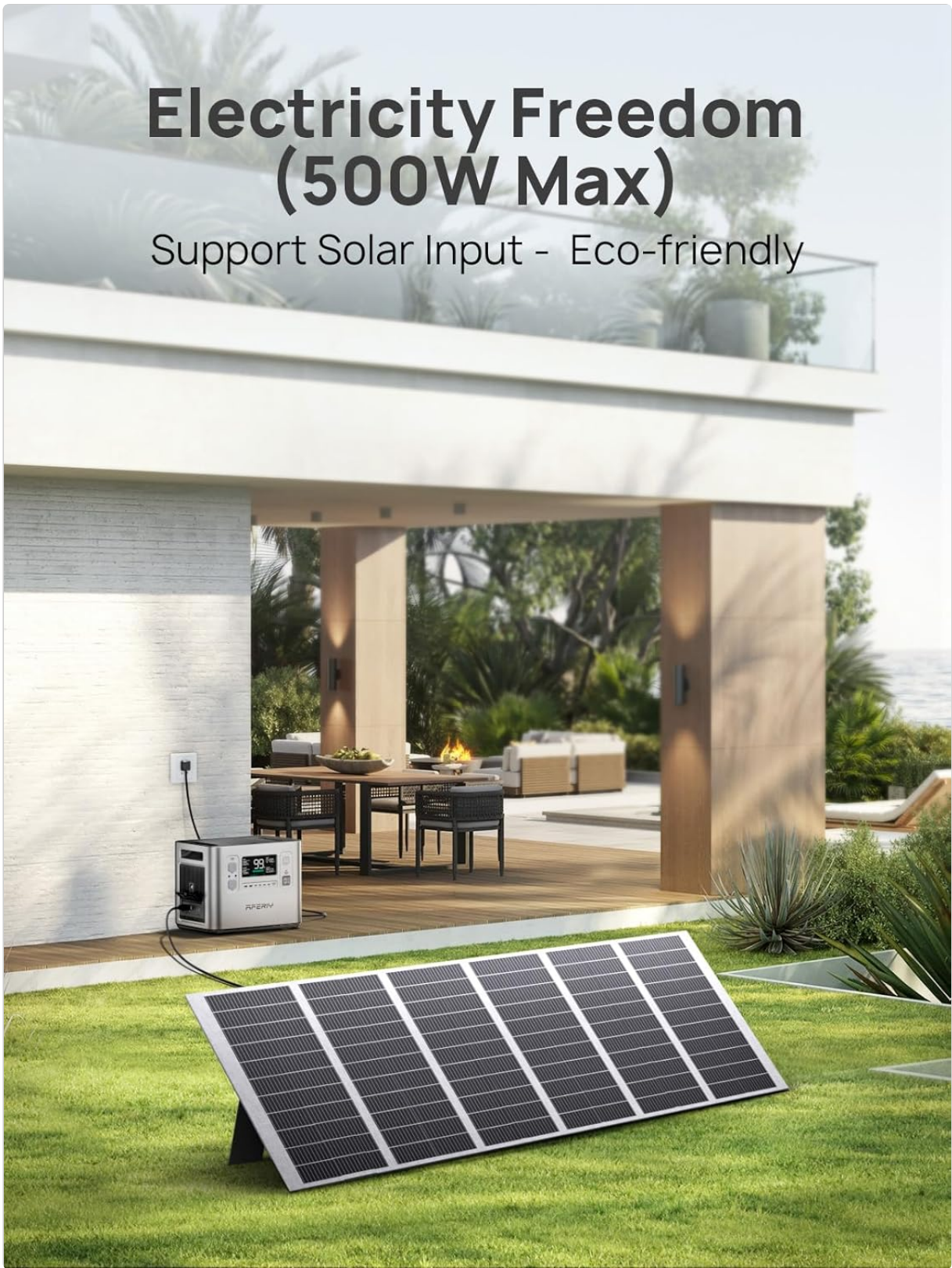
Image: The AFERIY P210 being charged by a solar panel in an outdoor setting, emphasizing eco-friendly power generation.