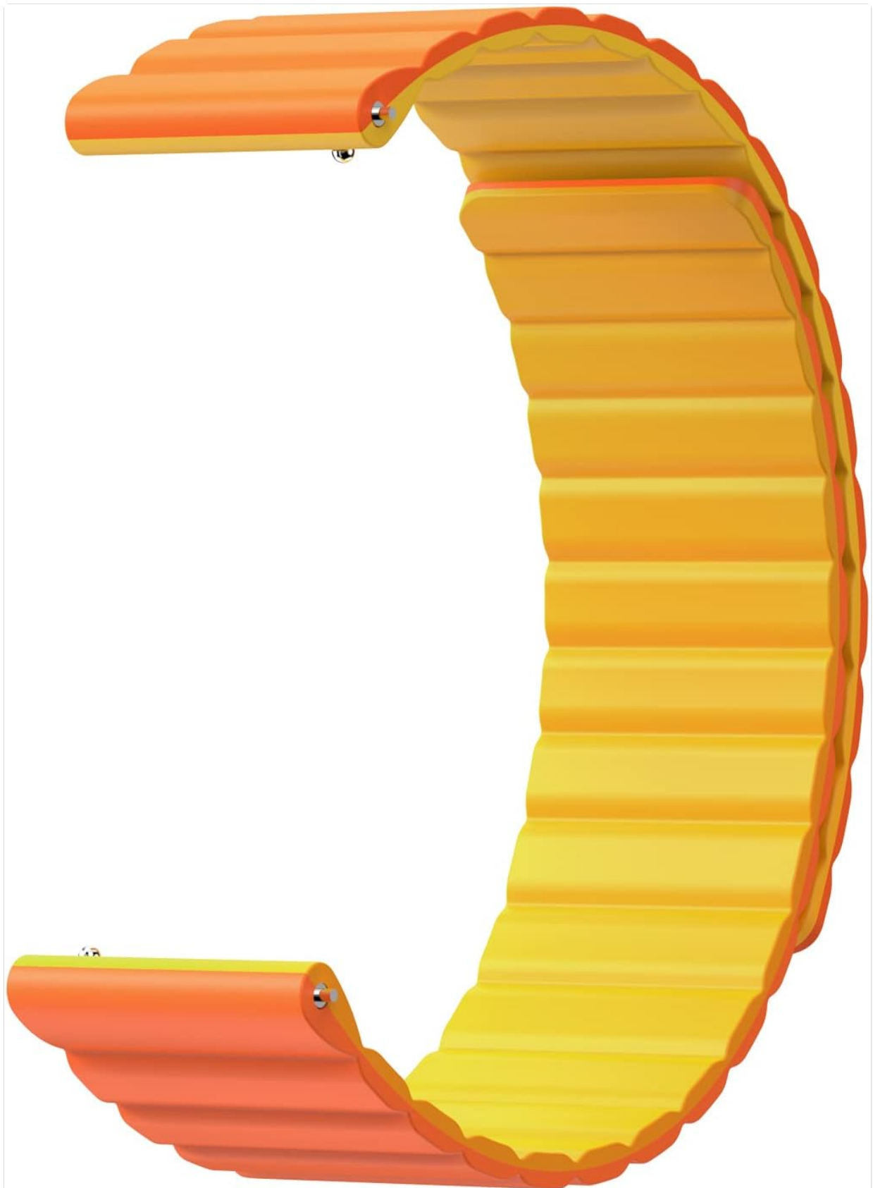
Image: A detailed view of the orange magnetic strap, highlighting its flexible design.