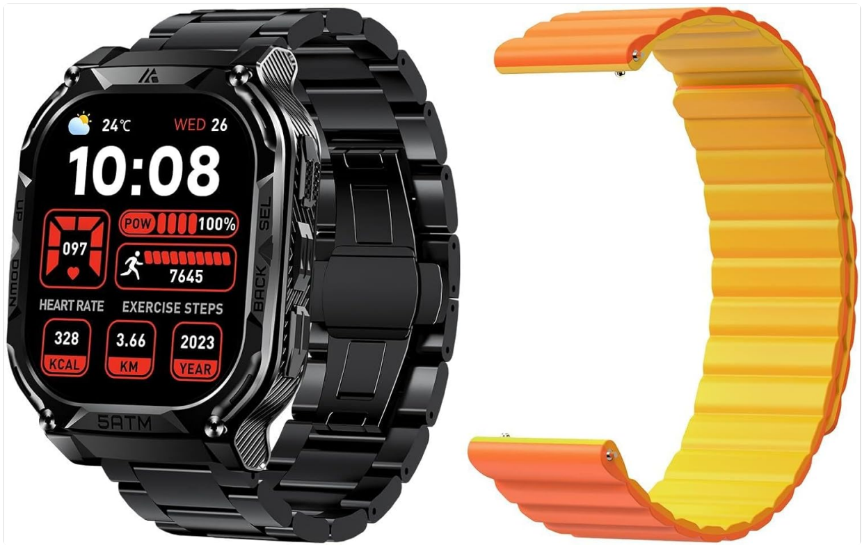
Image: The AMAZTIM M3E Smart Watch shown alongside its orange magnetic strap.