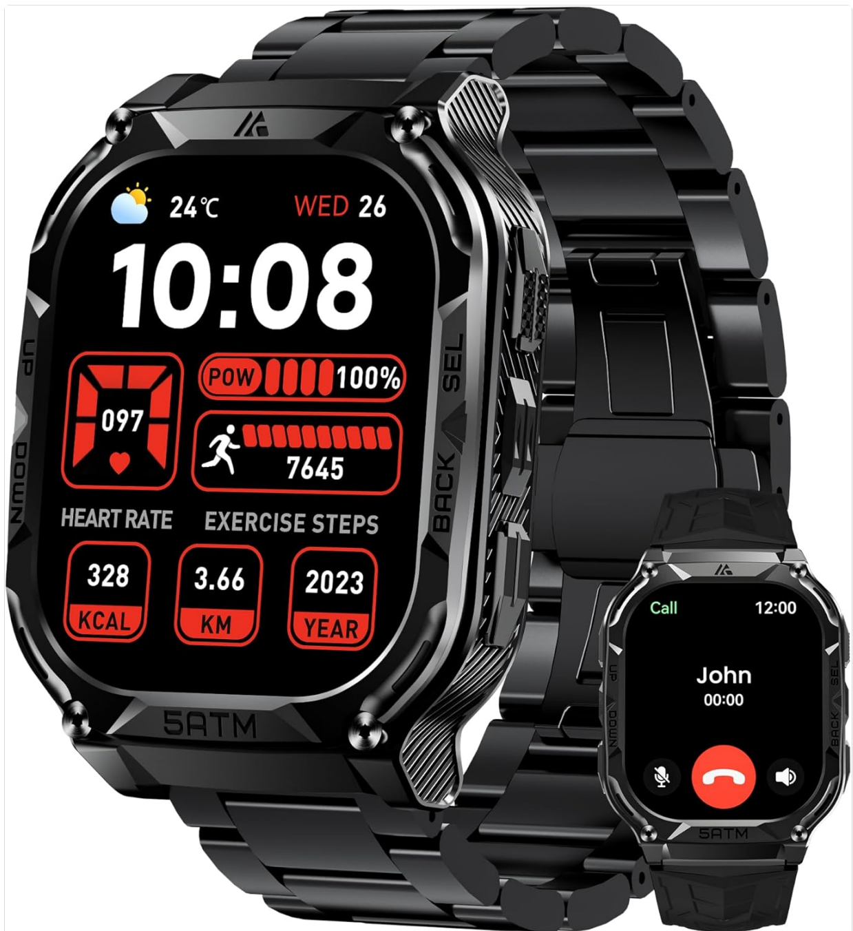
Image: The AMAZTIM M3E Smart Watch screen showing an incoming call, indicating successful pairing and communication features.