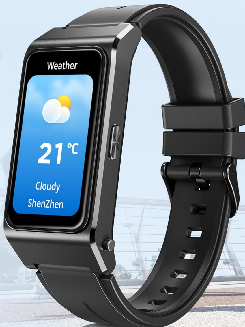
Illustration of the OUKITEL Smartwatch BT11 and its charging cable, representing the typical package contents.