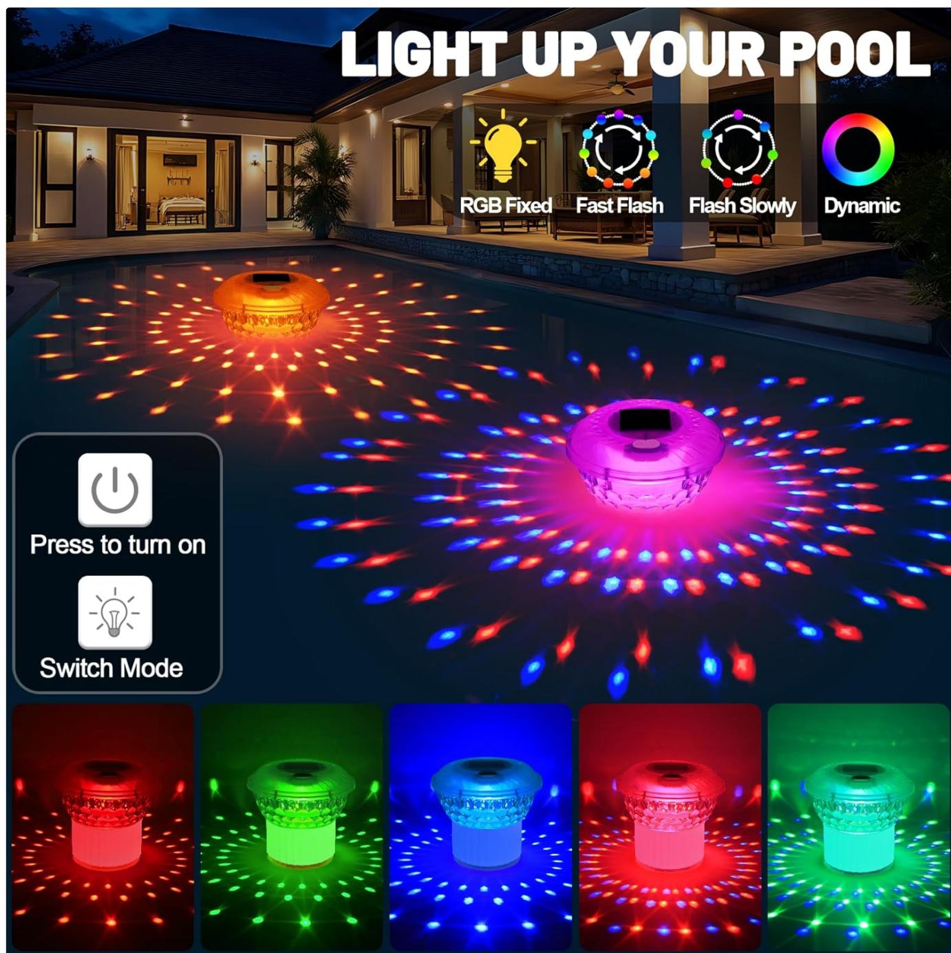
Image: Displays the top of the KingSom floater with its power and mode buttons, illustrating the different light effects such as RGB fixed colors, fast flash, slow flash, and dynamic color changes.

Fixed (single color), Fast Flash, Flash Slowly, and Dynamic (color changing).