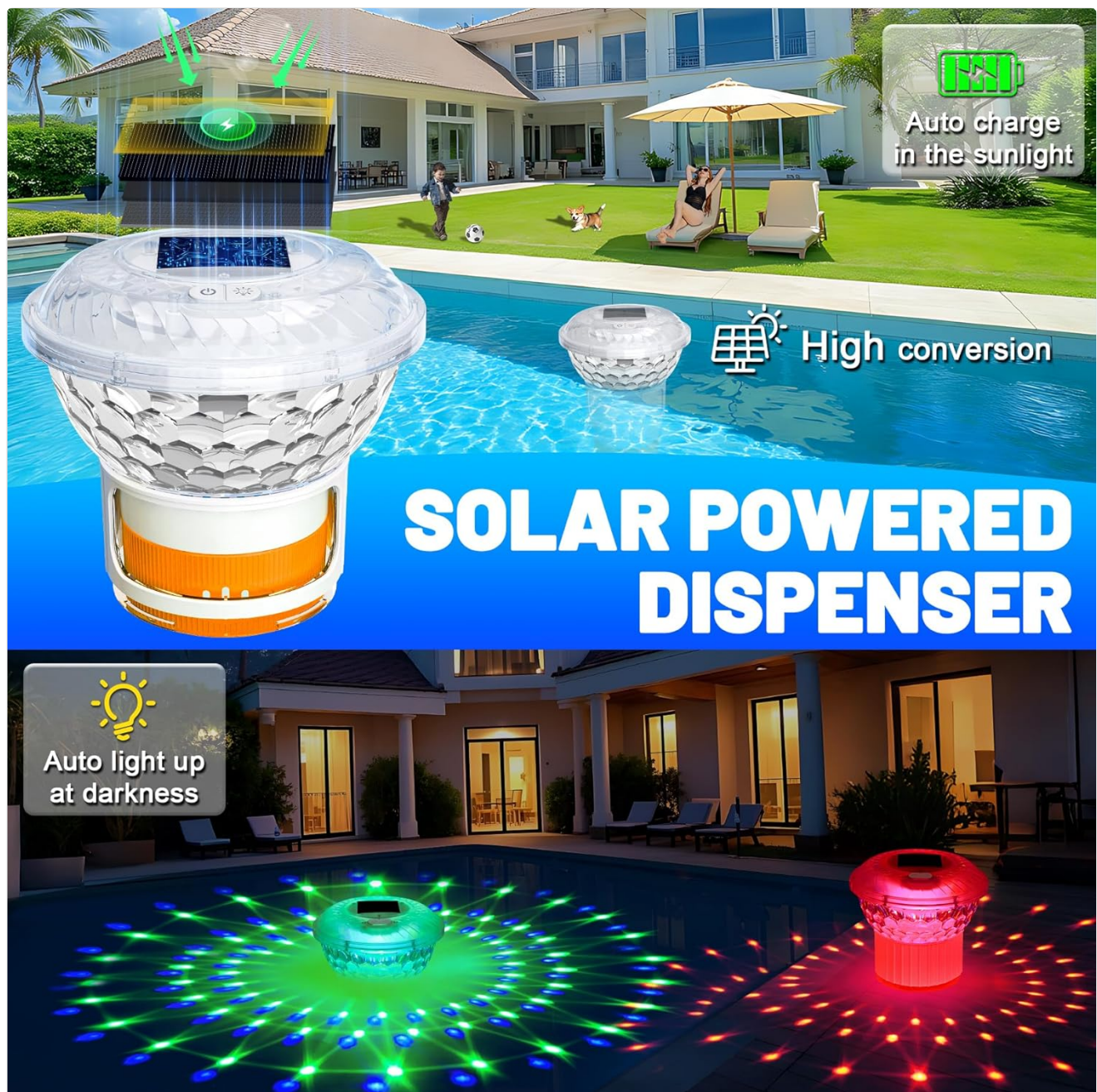
Image: The KingSom Pool Chlorine Floater, demonstrating its solar charging capability during the day and automatic illumination at night.