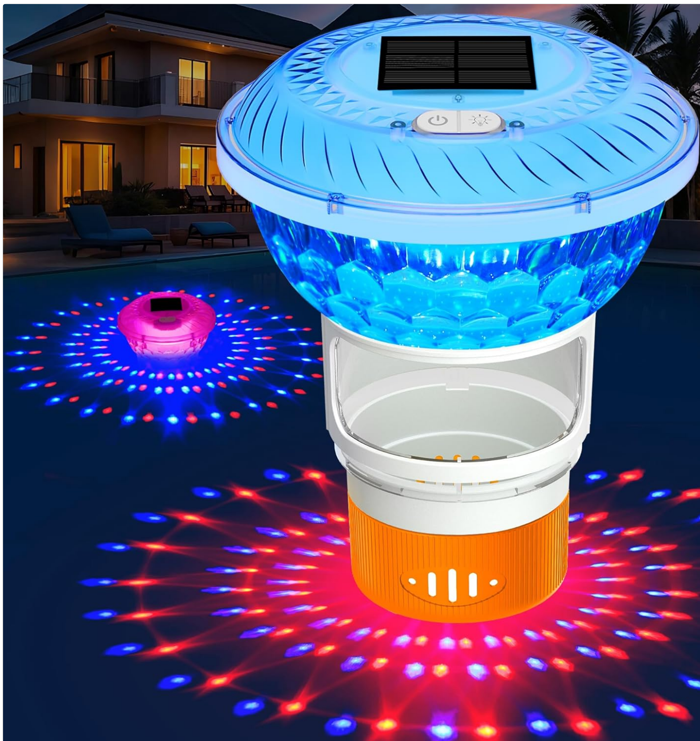
Image: The KingSom Pool Chlorine Floater, showcasing its integrated light and chlorine dispensing capabilities. The top section houses the solar panel and light, while the bottom section is for chlorine tablets.