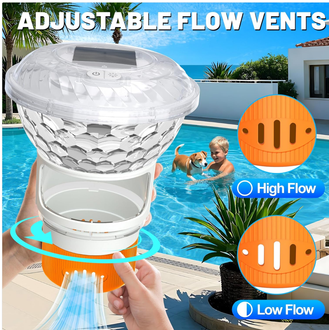
Image: Illustrates the adjustable flow vents on the KingSom floater, allowing users to select between high and low chlorine release rates by rotating the orange ring.

5. Place in Water: Gently place the floater into your pool or hot tub. It is designed to float upright.