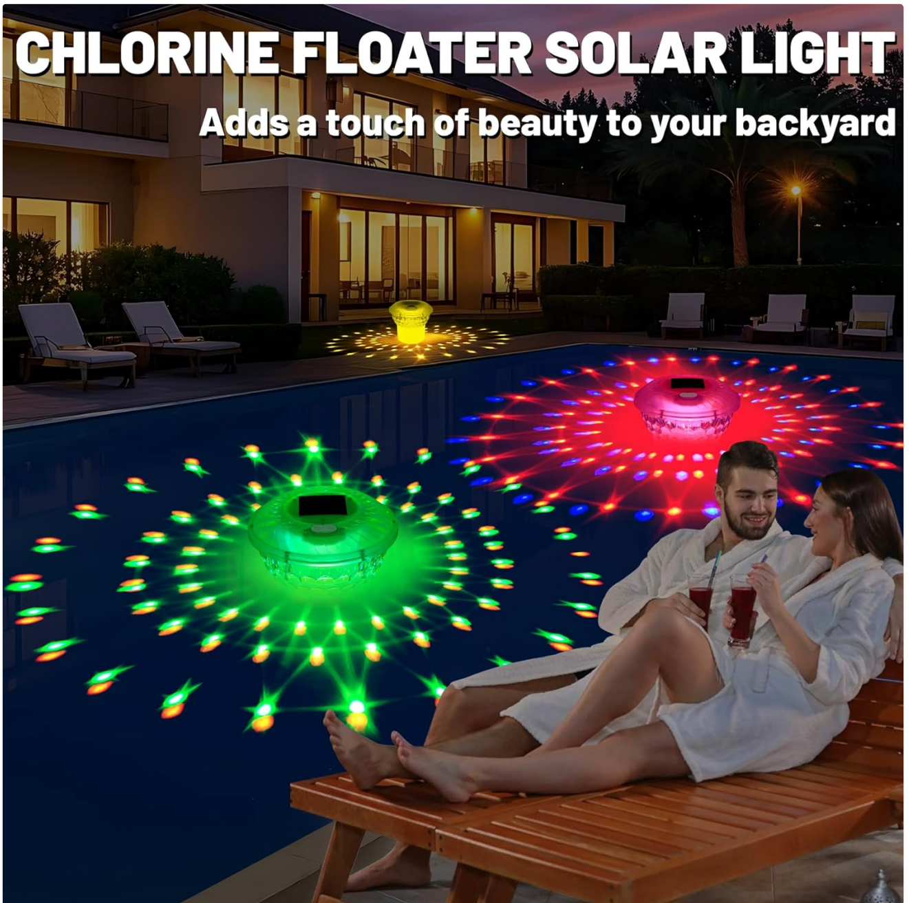
Image: The KingSom Pool Chlorine Floater casting vibrant, colorful lights across a pool at night, enhancing the overall aesthetic.