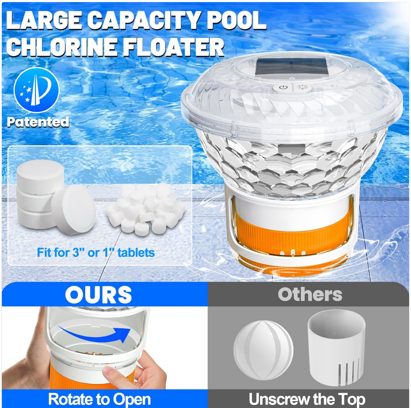
Image: Demonstrates how to rotate the orange ring to open the chlorine tablet compartment for easy loading, highlighting the large capacity for 3-inch or 1-inch tablets.