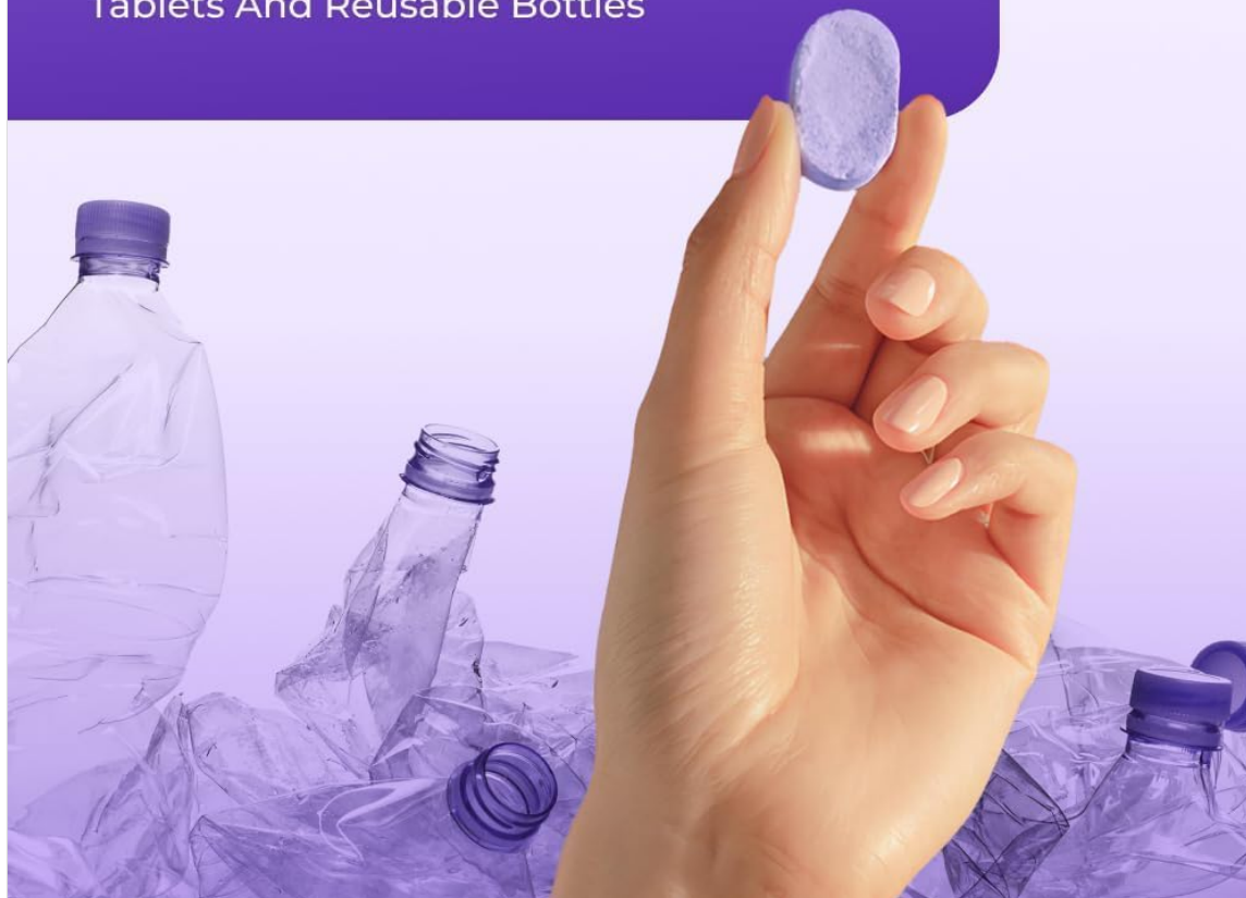
Image: Emphasizes the eco-friendly aspect of using concentrated tablets and reusable bottles.

Reduced Plastic Waste With Concentrated Tablets And Reusable Bottles