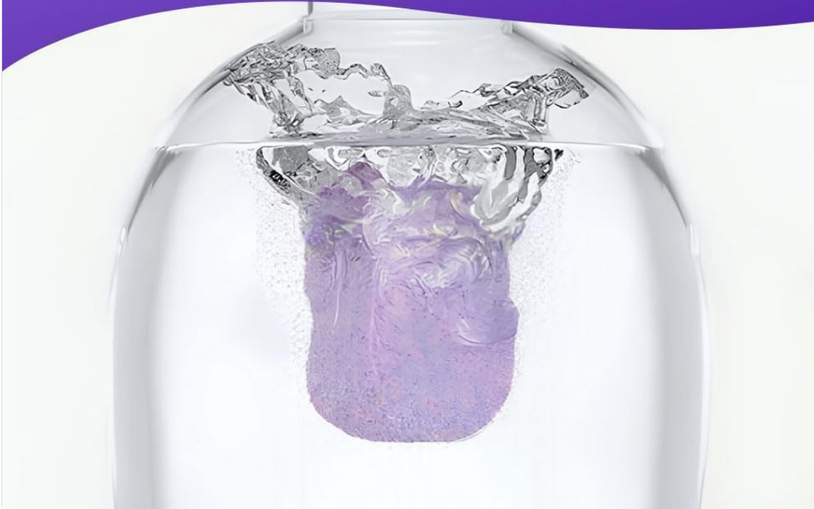
Image: A cleaning tablet dissolving in water within the spray bottle.