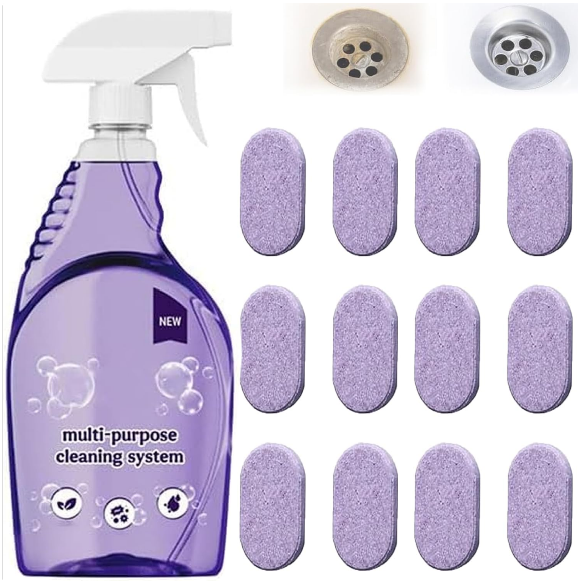
Image: Demonstrates the cleaning system's effectiveness on a sink drain.