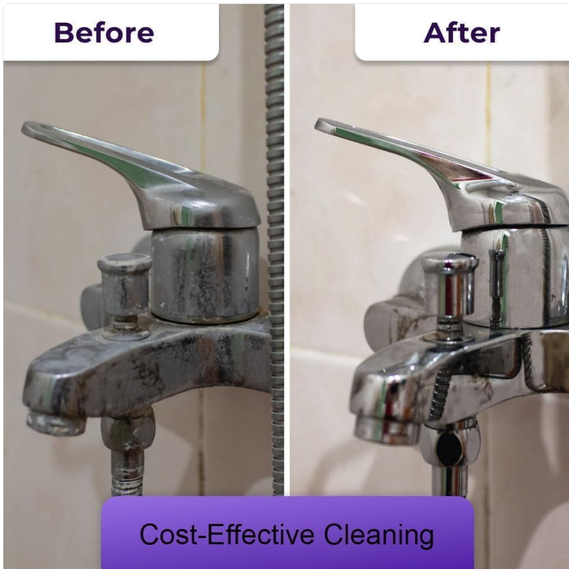
Image: Before and after cleaning a metal faucet.