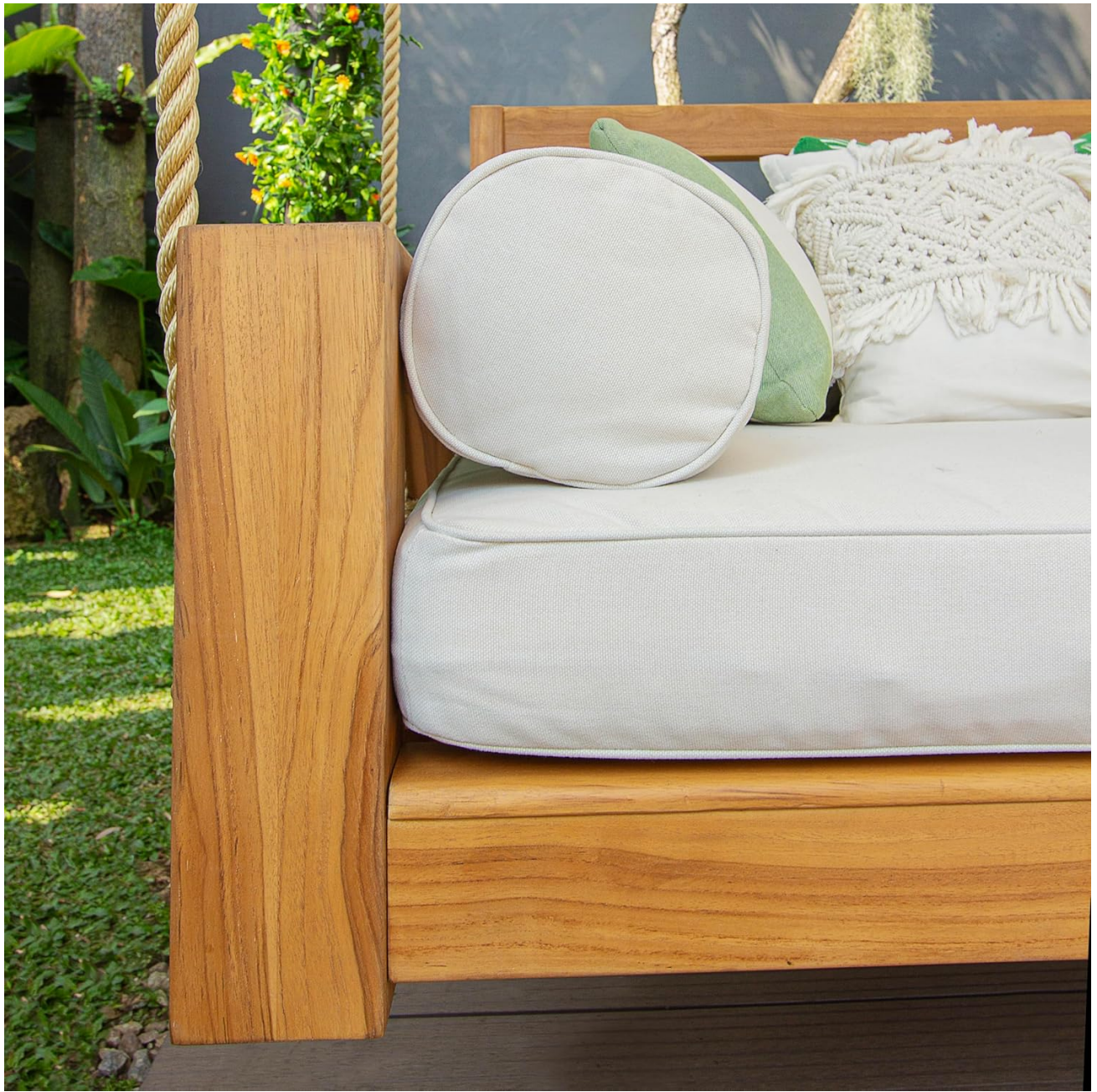
Image: Close-up of the secure rope attachment point on the swing frame.