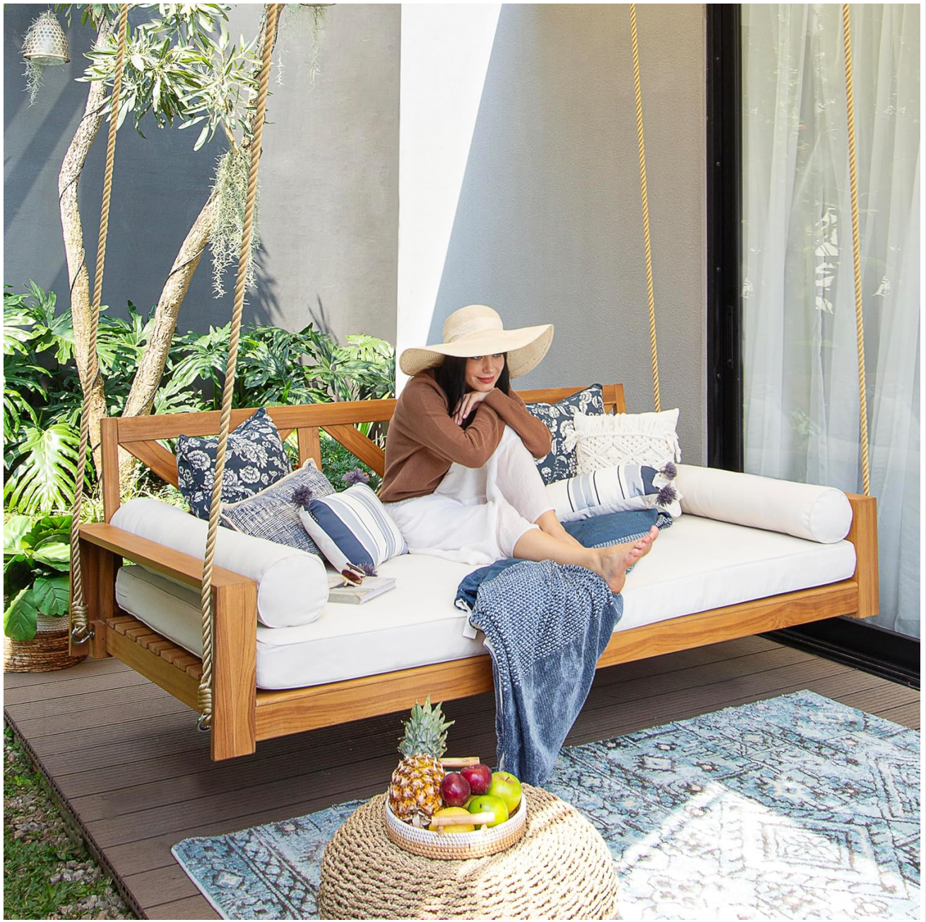
Image: The swing daybed providing a comfortable spot for relaxation.