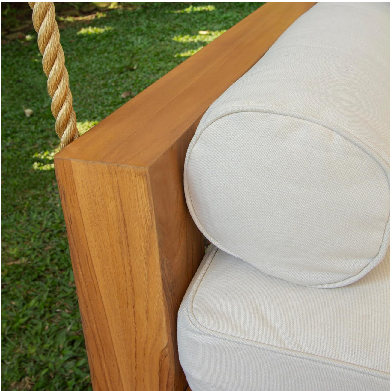
Image: Detail of the cushion and teak wood, highlighting the materials for care instructions.