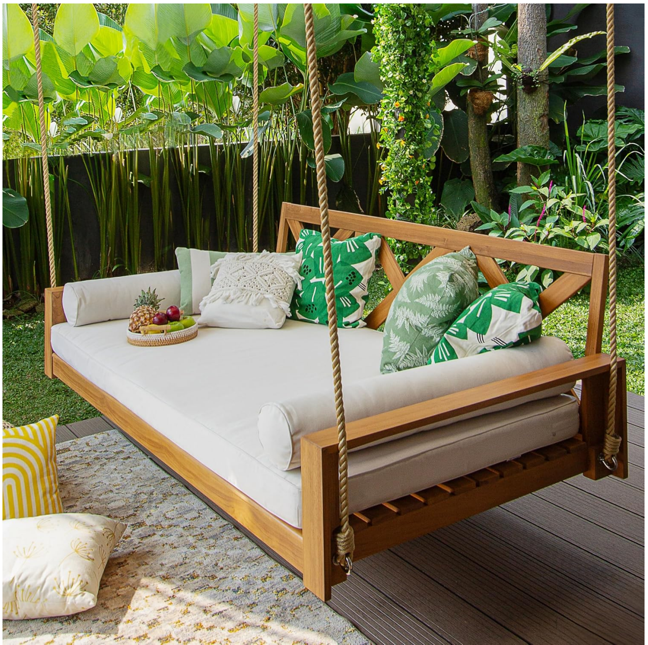
Image: The Logan Teak Wood Porch Swing Bed, showcasing its design and comfort in an outdoor environment.