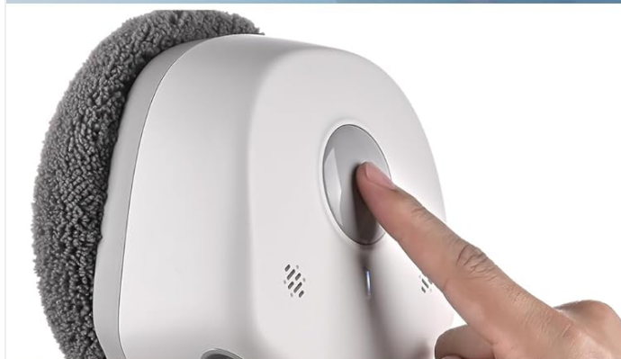
5. Allumer l'appareil