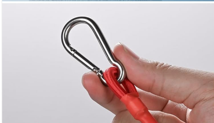
3. Attacher la corde de sécurité