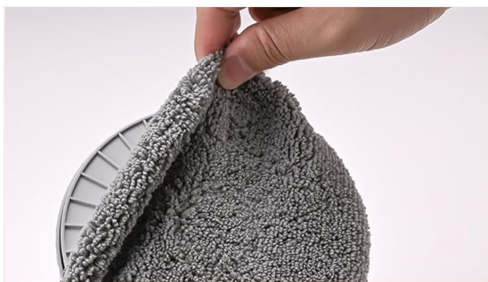
1. Fixer les lingettes

Hang the safety rope buckle on a solid, reliable, and immovable object. When fixing, it is advisable to wind it around the object one or two more times for added security.