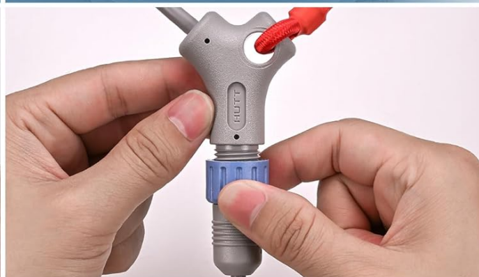
4. Brancher l'alimentation