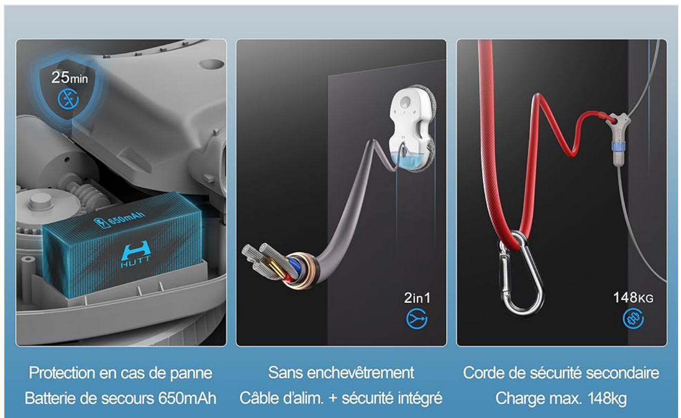
Image: Safety features of the HUTT S7, including backup battery and safety rope.