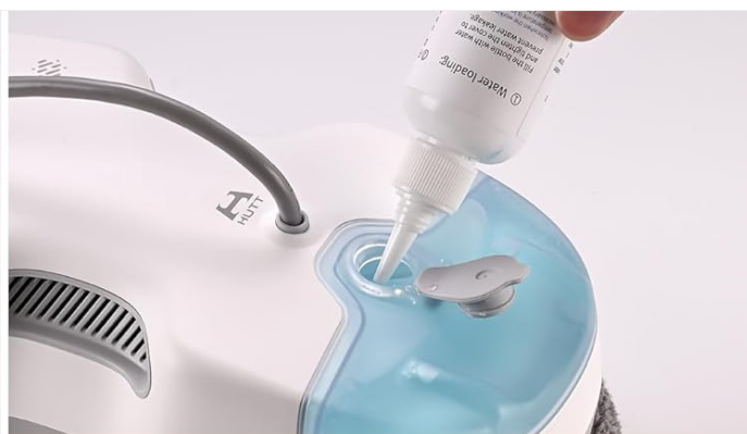
2. Remplir d'eau ou de nettoyant