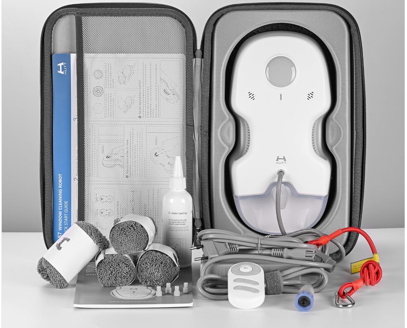
Image: All-in-one storage box with included accessories.