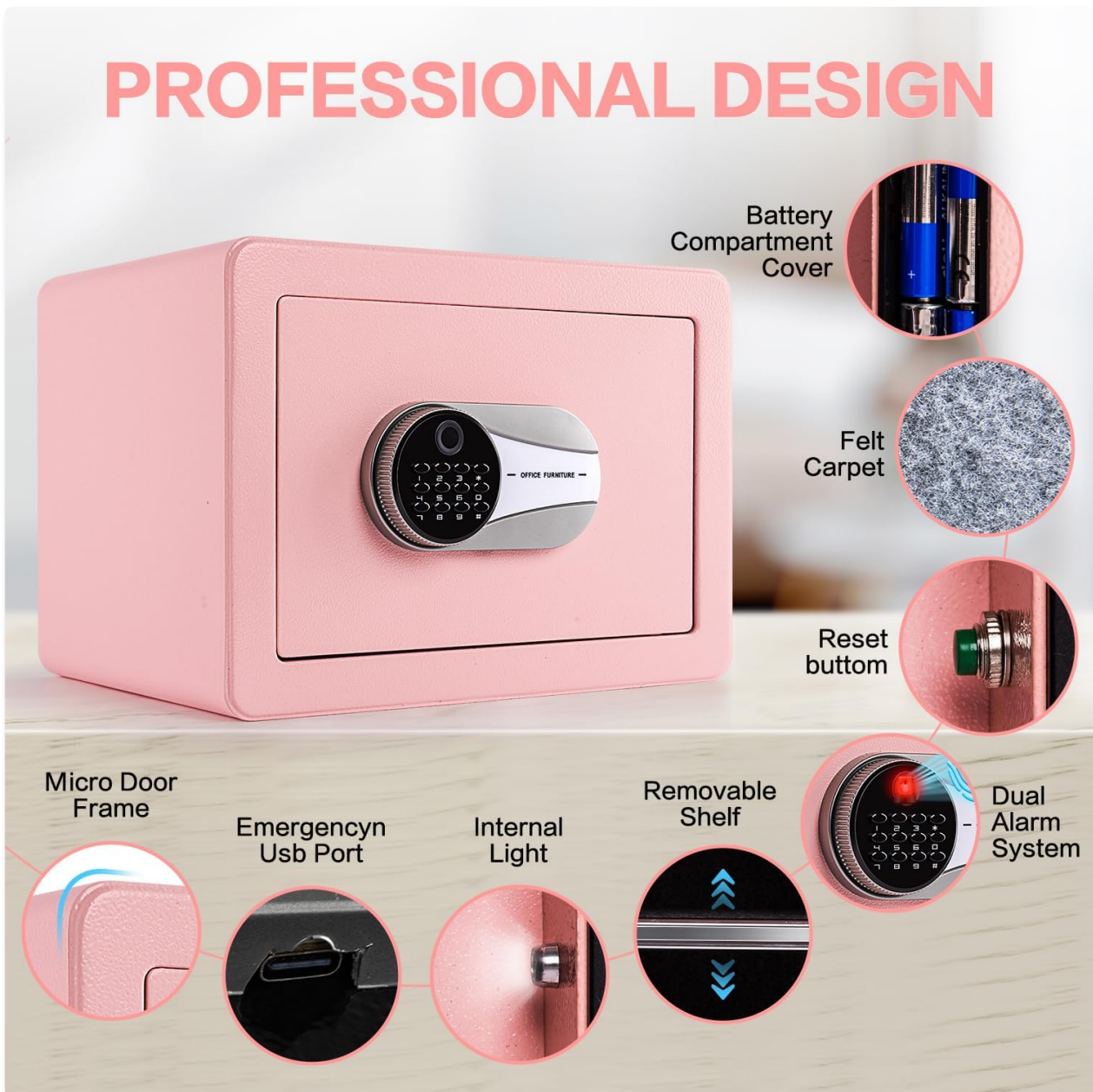
Figure 3.2: Battery compartment location.