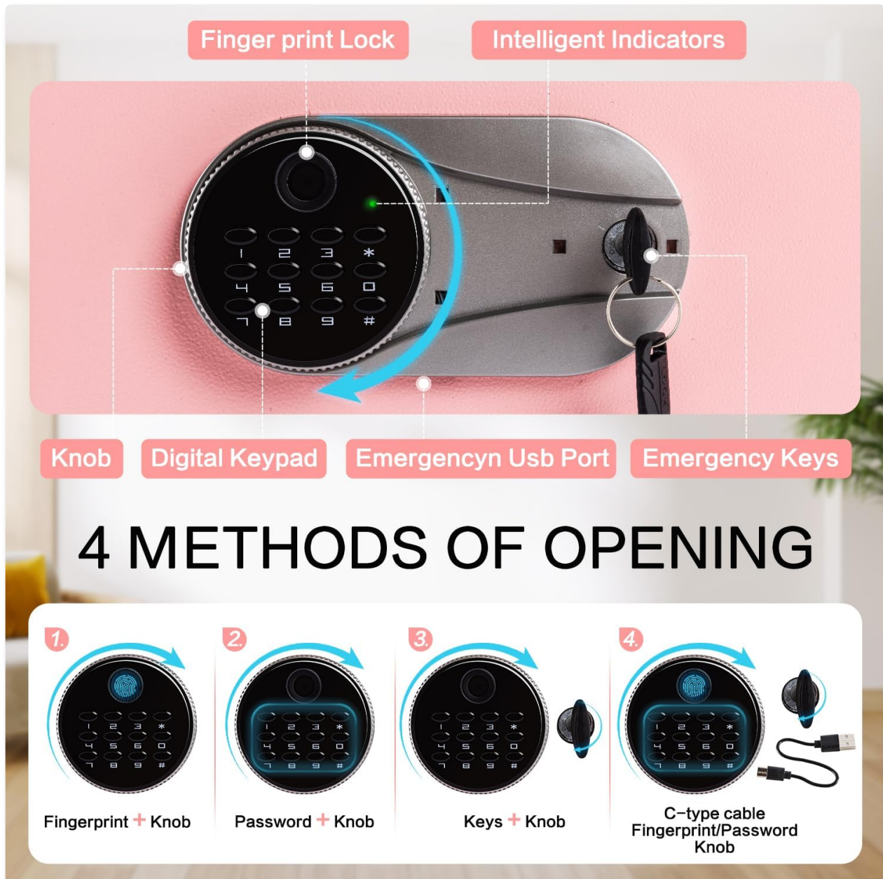
Figure 3.1: Four methods of opening the safe.

Note: The safe is shipped in a default mode where any fingerprint can open it until you set up your own fingerprint. It is crucial to set up your personal fingerprint and password immediately after initial opening.