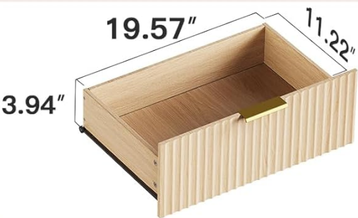
Figure 8.1: Detailed product dimensions and maximum load capacities for the desktop and individual drawers.