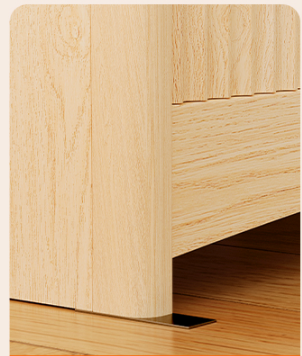
Integrated, Stable Base