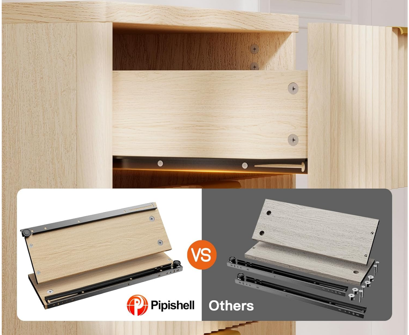
Figure 4.1: The pre-installed drawer slides simplify assembly compared to traditional methods, ensuring smooth operation without snagging.