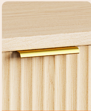
High- Quality Metal Hand les