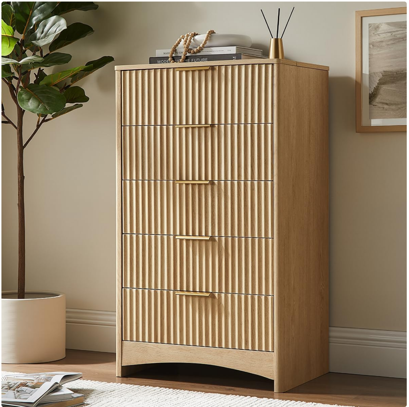
Figure 1.1: The Pipishell Fluted 5-Drawer Dresser, showcasing its natural oak finish and fluted drawer fronts.