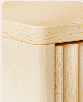
Rounded Corner Design