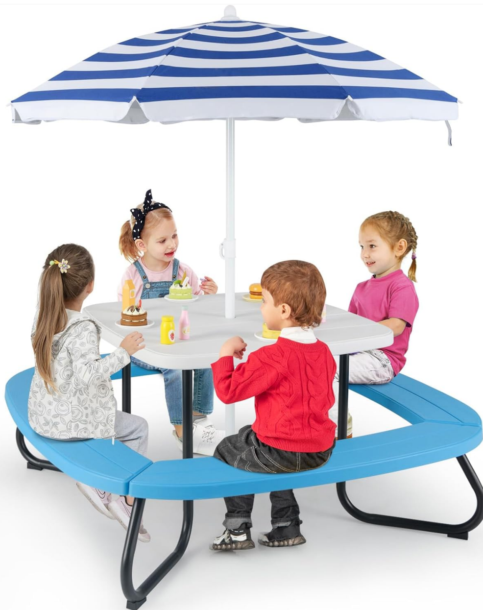
Figure 1: The Costzon Kids Picnic Table in use with four children.