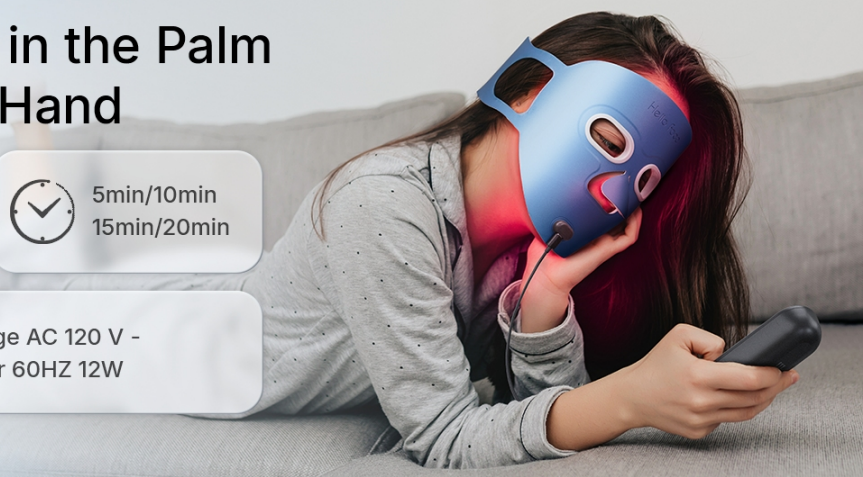
Image: The remote controller for the Hello Face mask, detailing buttons for selecting light modes, setting the timer, and power, emphasizing ease of use.

Rated Voltage AC 120 V - Rated Power 60HZ 12W