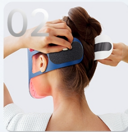
Wear the Protective Goggles and Fit the Mask Securely