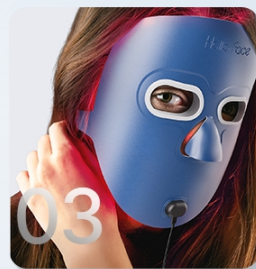
Select Light Mode, Power & Time. Relax for 10-20 Minutes