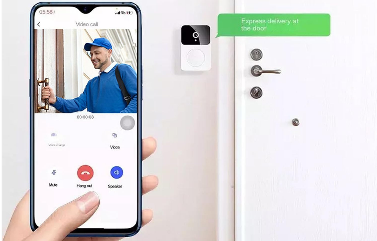
Image 4.1: A mobile phone displaying the video call interface, allowing users to easily respond to visitors at their door.

When someone presses the doorbell, the doorbell will push the notification to the mobile phone, and the owner can enter the mobile phone video conversation interface to support sharing to up to 10 members at the same time.