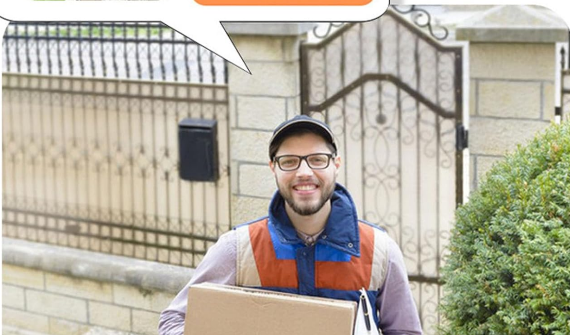
Image 4.3: Another example of a visitor record in the app, showing a delivery person at the door.