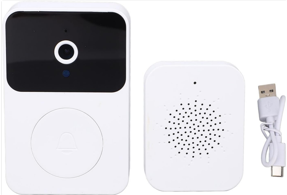
Image 2.1: All components included in the Diyeeni Smart Video Doorbell package: doorbell unit, indoor chime, and charging cable.