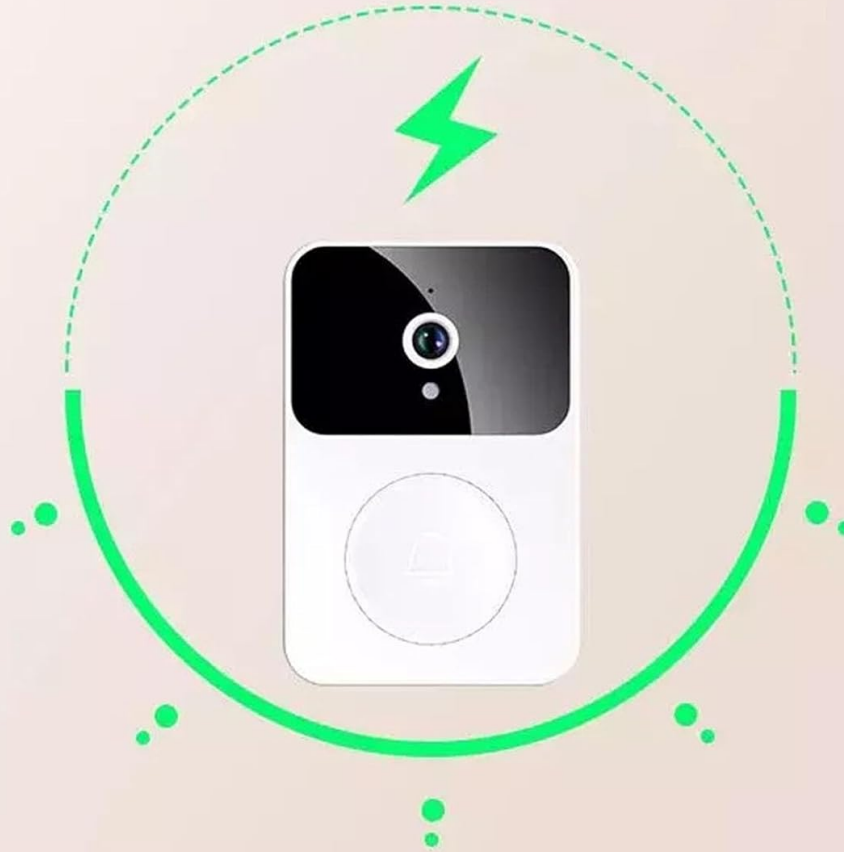
Image 3.1: The doorbell unit displaying a charging indicator, signifying its long standby time capability.

DETACHABLE, RECHARGEABLE, VOICE-CHANGING