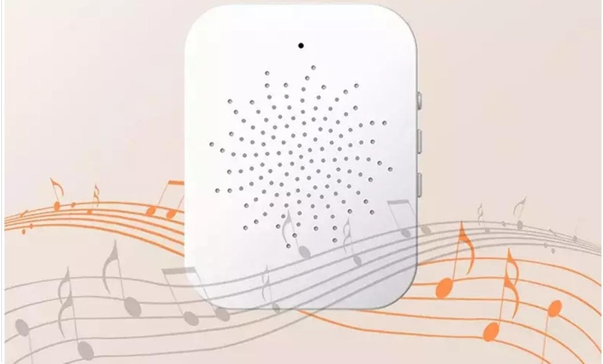
Image 4.4: The indoor chime unit, highlighting its capability to switch between 38 different melodies.

It contains 38 music songs with adjustable volume.