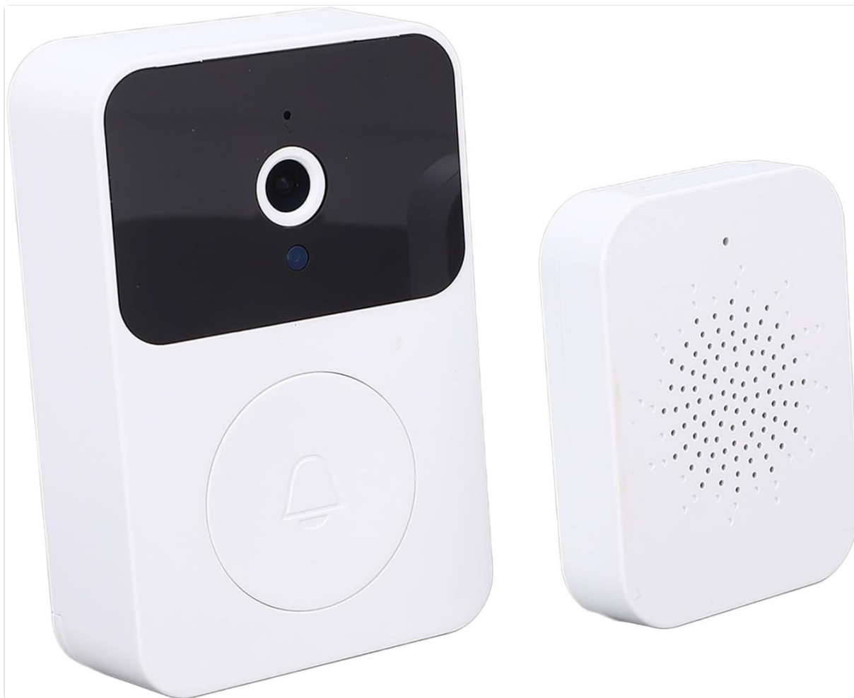
Image 1.1: The Diyeeni Smart Video Doorbell and its accompanying indoor chime unit.

Thank you for choosing the Diyeeni Smart Video Doorbell. This device provides enhanced home security with its wireless connectivity, HD wide-angle lens, and two-way communication features. This manual will guide you through the setup, operation, and maintenance of your new video doorbell system.