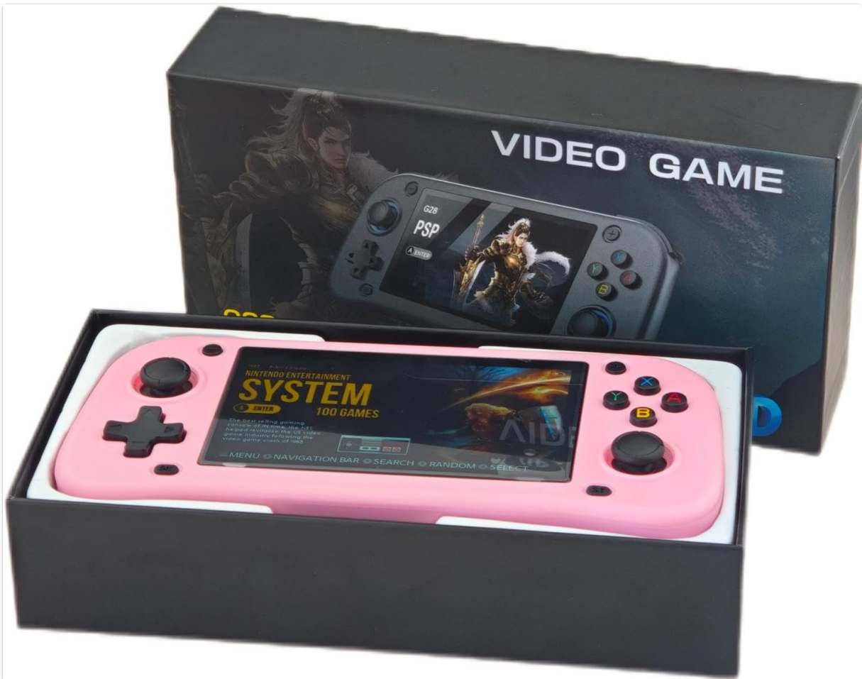
Image: The G28 Retro Handheld Game Console, presented in its retail packaging. The pink console is visible within the box, alongside the "VIDEO GAME" branding on the outer packaging.