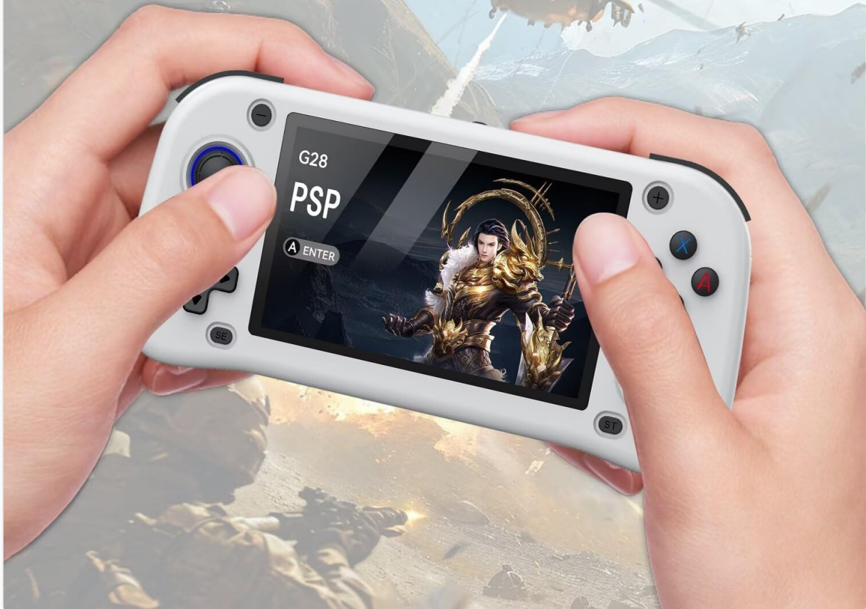
Image: The G28 console held in hands, showcasing its vibrant 4.3-inch IPS screen displaying game content, set against a dynamic background.

Support up to 25 kinds of classic simulators to play classic nostalgic games