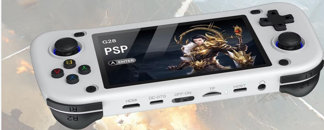
Image: A close-up view of the console's dual 3D joysticks, highlighting their ergonomic design and anti-skid texture for enhanced gaming precision.

Special game rocker for arcade high sensitivity and anti-skid design