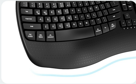
Comfortable Ergonomic Wrist Rest