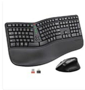
Image: Contents of the MEETION DirectorD-KB package, including the keyboard, user manual, USB-A receiver, and USB-C adapter.