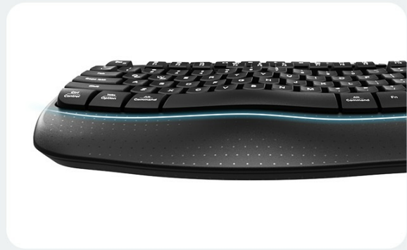
Wave Curved Key Frame

Image: A visual representation of the independent and combined multimedia keys available on the keyboard.