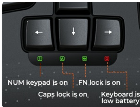
Image: Close-up of the keyboard's indicator lights, showing status for Num Lock, Caps Lock, FN Lock, and low battery warning.

The keyboard features an auto-sleep mode to conserve battery life. After 20 minutes of inactivity, it will enter hibernation. To wake it up, simply press any key.