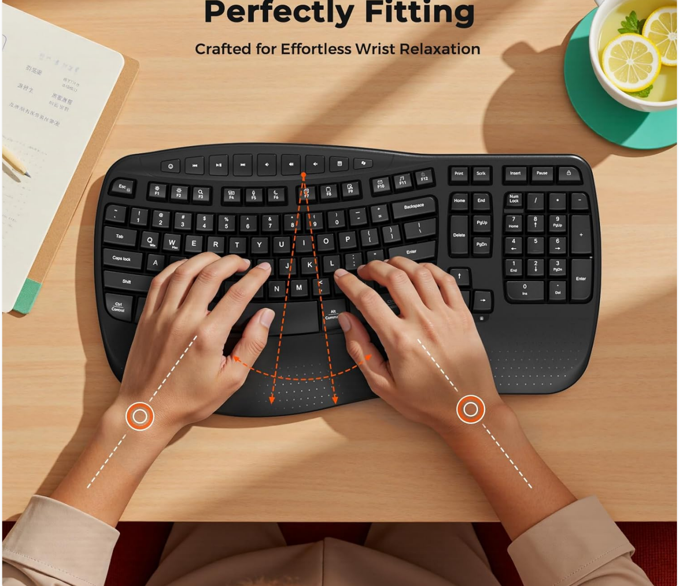
Image: A user's hands resting comfortably on the integrated wrist rest while typing on the ergonomic keyboard.