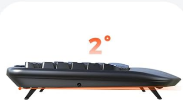
Image: Side profiles of the keyboard demonstrating three different adjustable tilt angles for personalized comfort.