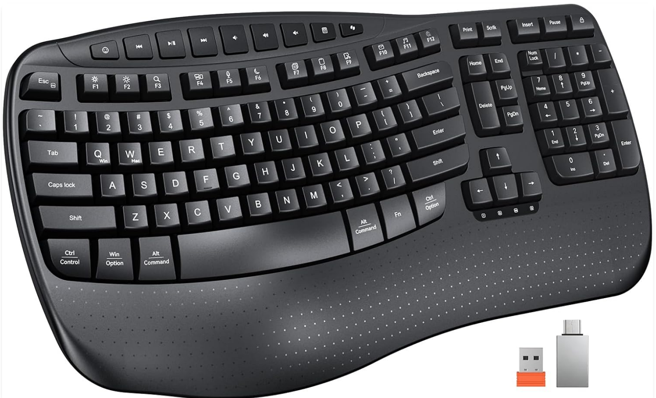
Image: The MEETION DirectorD-KB Wireless Ergonomic Keyboard positioned on a wooden desk, showcasing its wave-curved design and integrated wrist rest.

The MEETION DirectorD-KB is a wireless ergonomic keyboard designed for comfortable and natural typing. It features a scientific wave key design and a built-in firm wrist rest to support your hands during extended use. This keyboard offers broad compatibility with Windows and macOS devices through a 2.4GHz wireless connection.