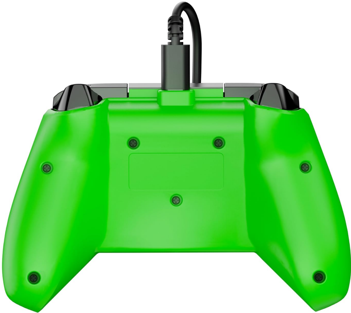
Image illustrating the connection of the USB-C cable to the controller.