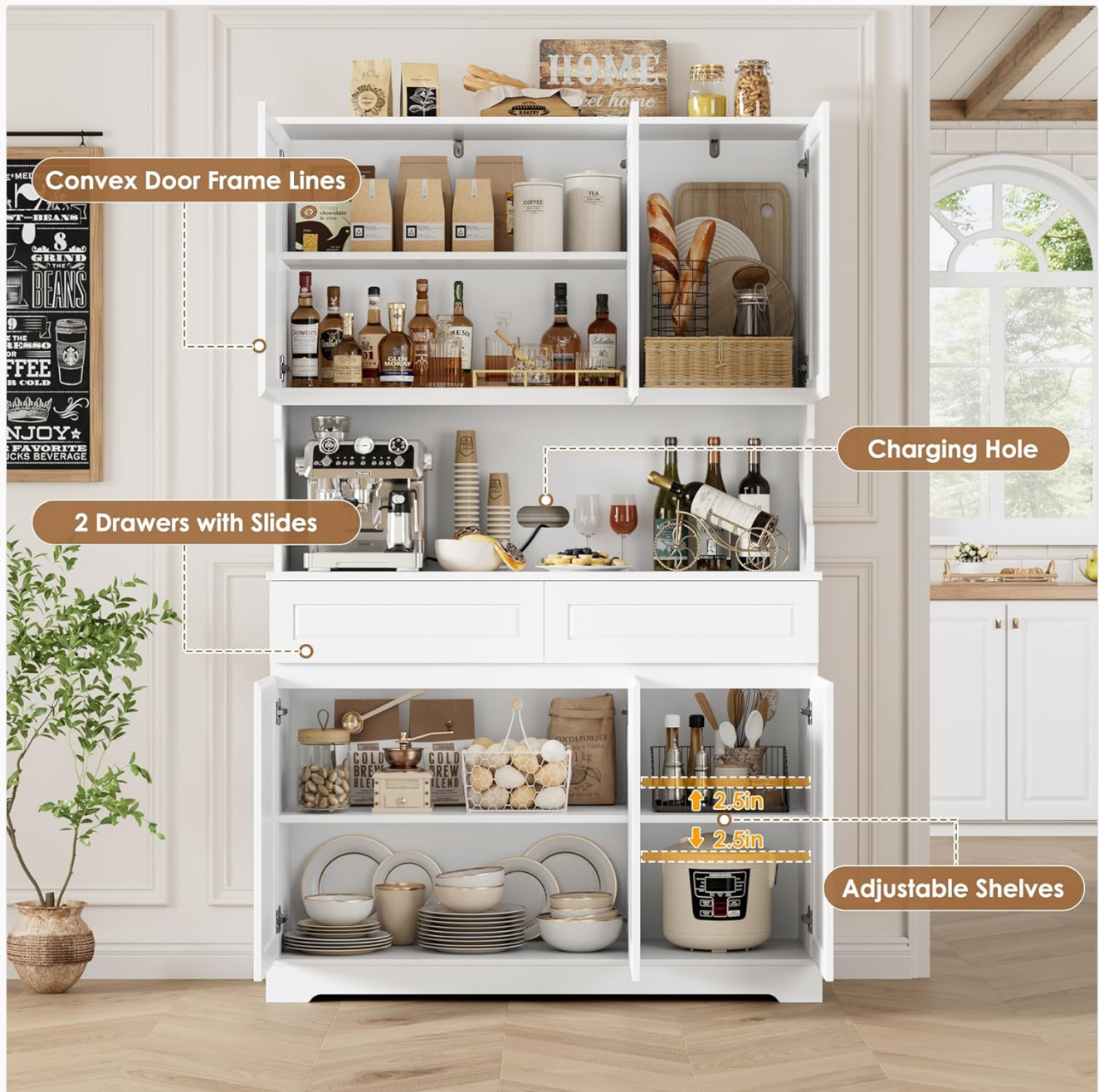
Image 5.1: Close-up of the cabinet's features, including adjustable shelves and the integrated charging hole.

The cabinet features multiple compartments behind six doors, providing ample space for various kitchen items. The upper section is ideal for frequently accessed items or decorative pieces, while the lower section can store larger appliances or bulkier goods.