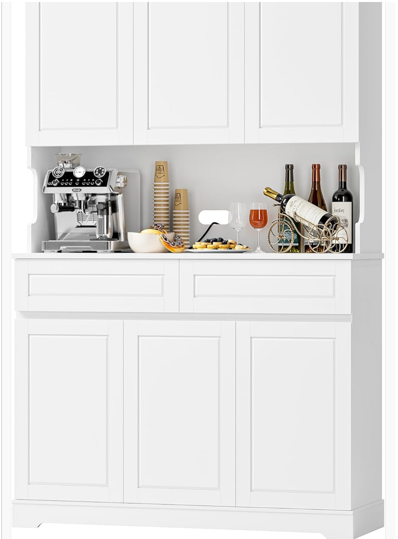
Image 5.3: The cabinet's countertop accommodating a microwave and other kitchen items.