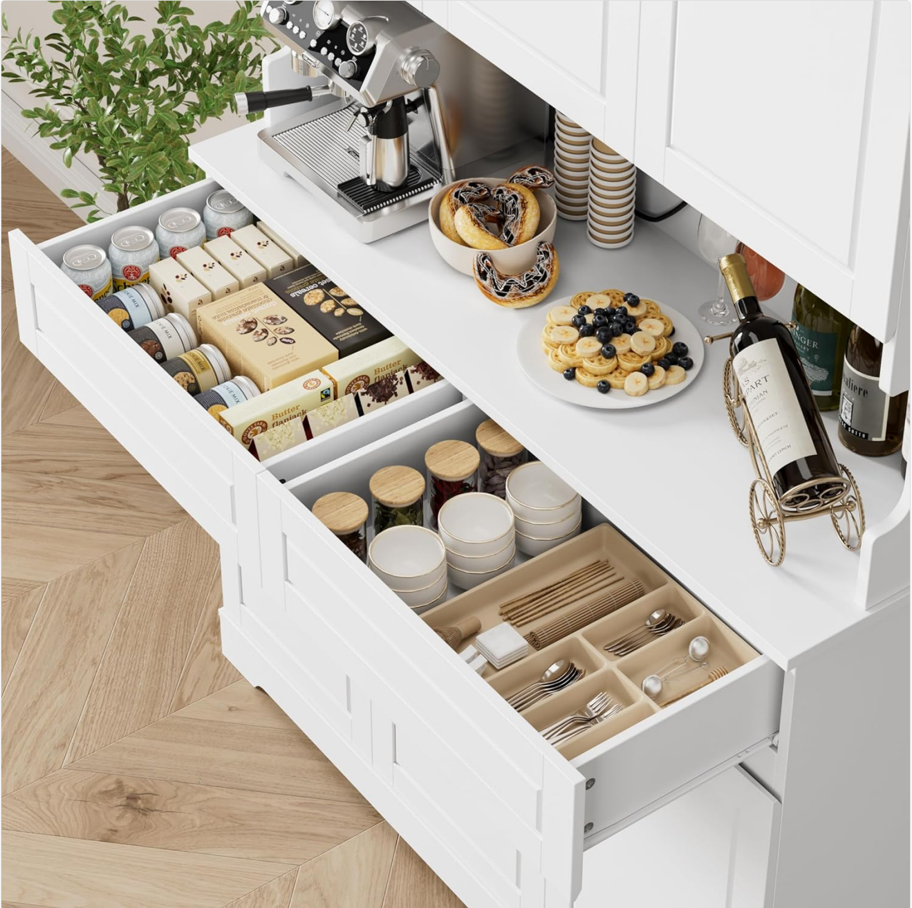
Image 5.2: The two spacious drawers, shown open and organized with various kitchen essentials.

Two smooth-gliding drawers are located beneath the countertop. These are suitable for storing smaller items such as cutlery, spices, or linens.