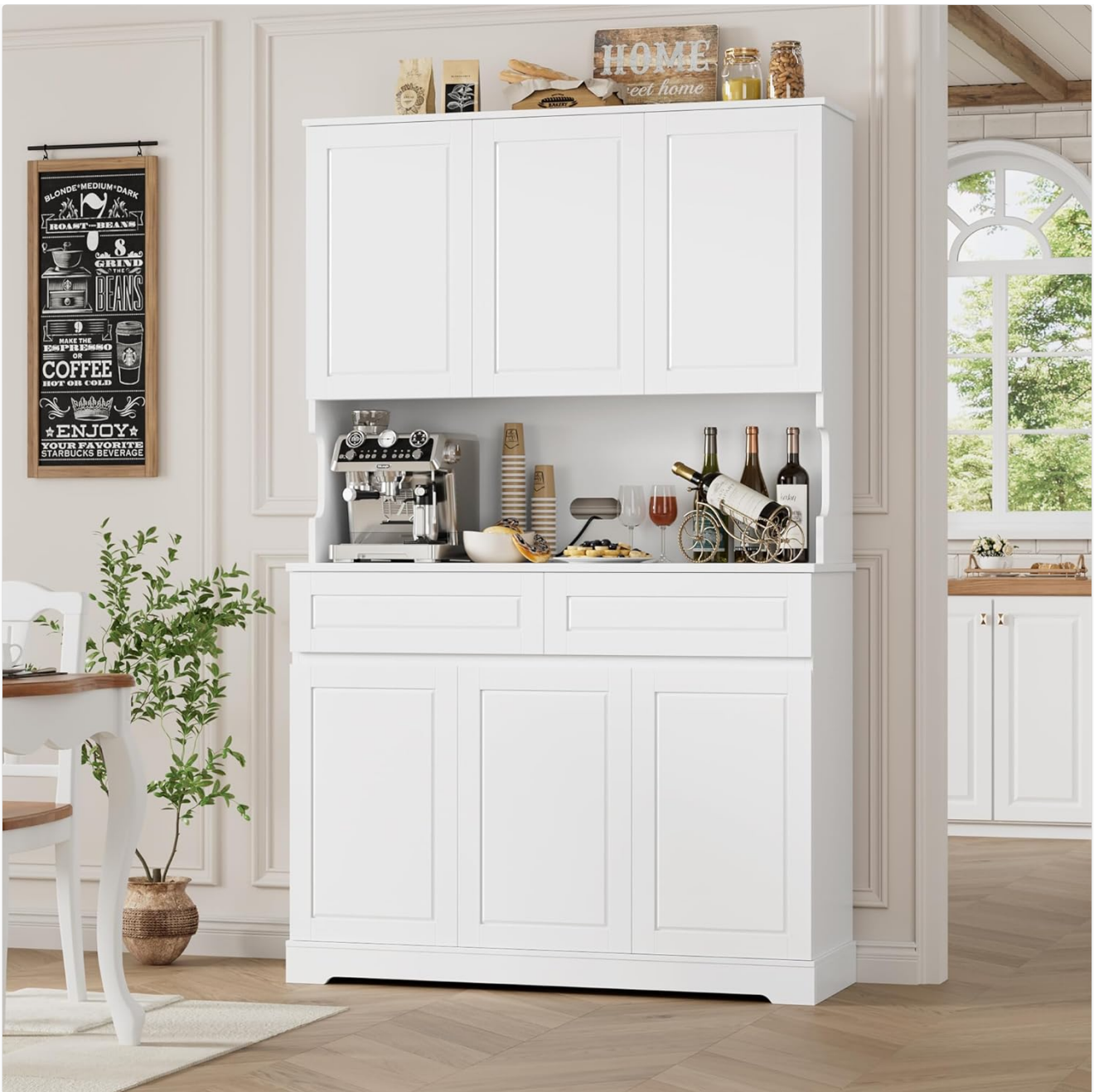
Image 2.1: The FACBOTALL 74-inch Tall Kitchen Pantry Cabinet, showcasing its design and storage capabilities in a kitchen environment.