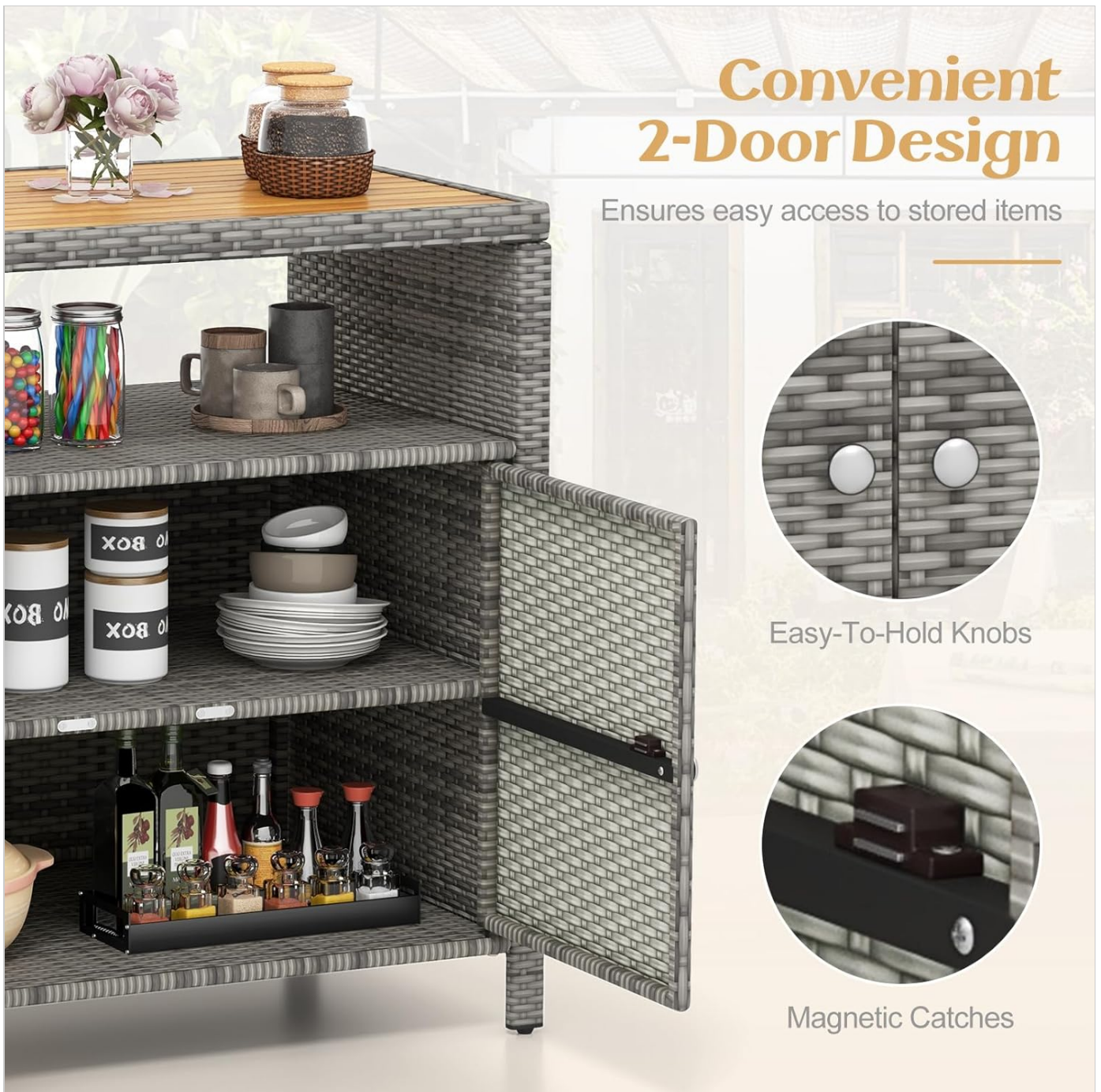
Image: Detail of the convenient 2-door design, highlighting the easy-to-hold knobs and secure magnetic catches.