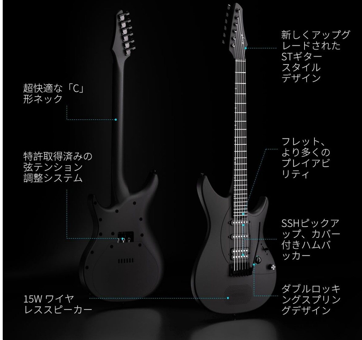
Image: A detailed diagram illustrating the key components and features of the Enya Inspire guitar, including its 15W wireless speaker, SSH pickup configuration, comfortable C-shaped neck, and 24 frets for extended playability.