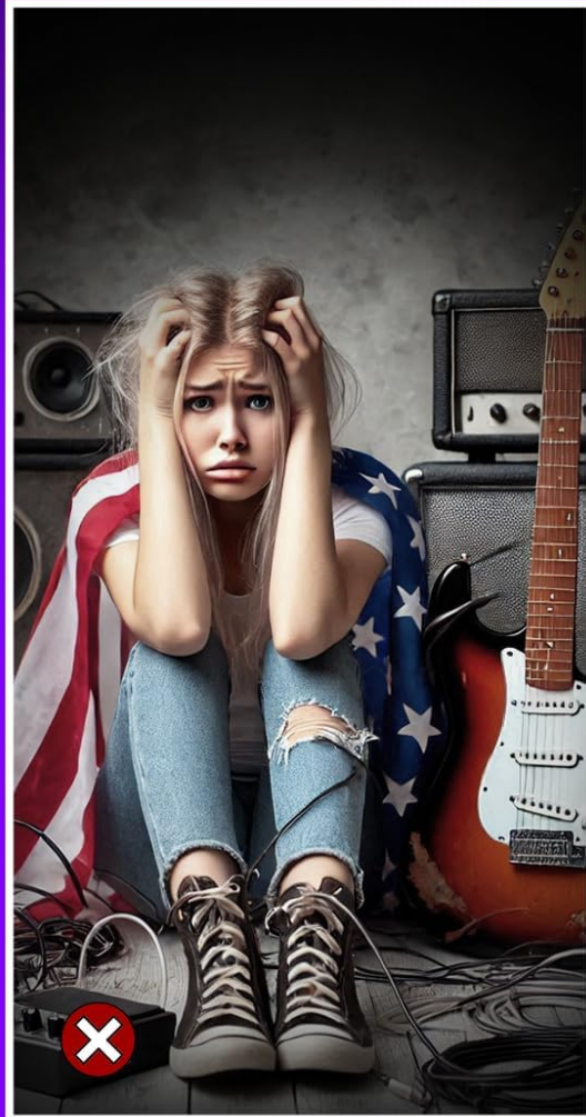
Image: A visual comparison highlighting the convenience of the Enya Inspire's 15W wireless speaker, showing a user enjoying cable-free playing versus the traditional setup with multiple cables and an external amplifier.