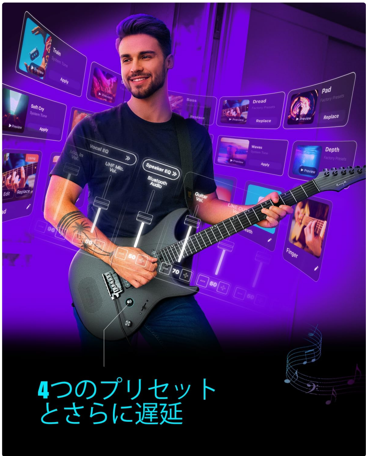
Image: A user interacting with the ENYA MUSIC app on a smartphone, showcasing the seamless integration and customization options available for the Enya Inspire guitar.