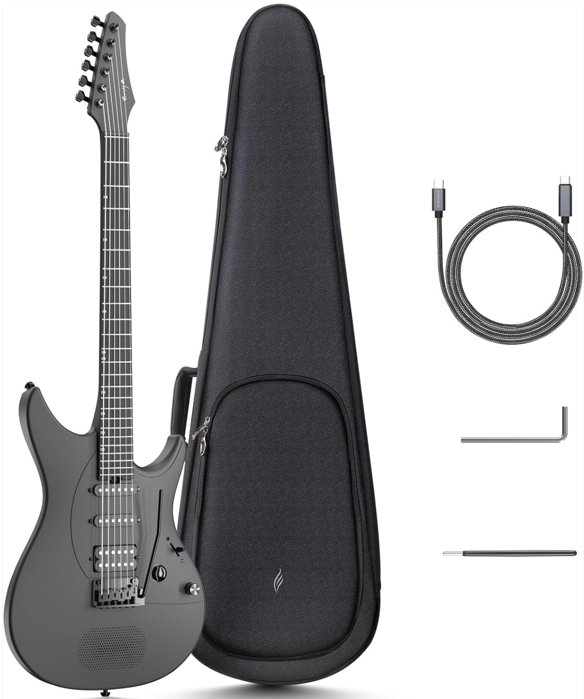
Image: The Enya Inspire Smart Electric Guitar, its protective gig bag, USB-C charging cable, and included adjustment wrenches.