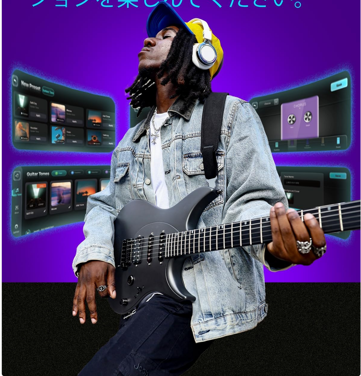
Image: A musician enjoying an OTG (On-The-Go) practice session with the Enya Inspire guitar, highlighting its portability and direct recording capabilities.