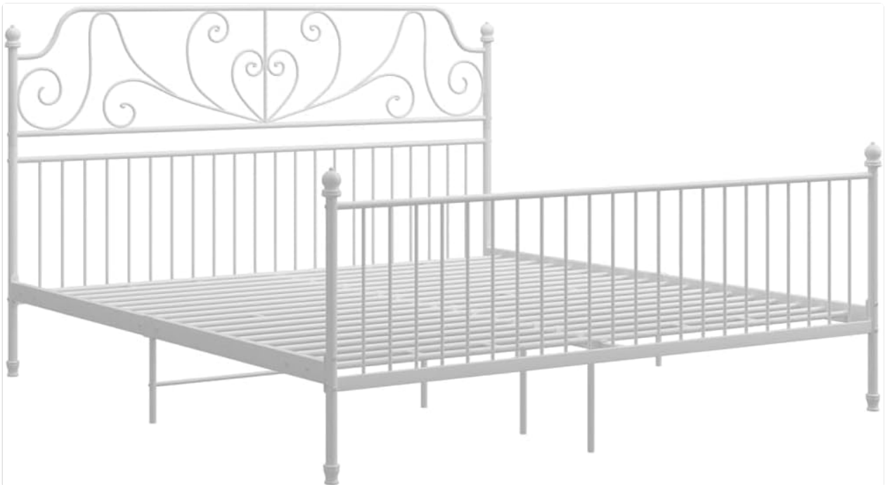
Image 4.1: Assembled bed frame structure before mattress placement.