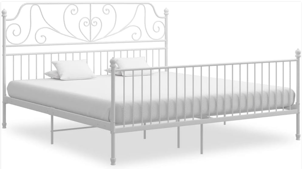
Image 1.1: Fully assembled Generic White Metal Super King Bed Frame with mattress.

This bed frame is designed to provide a sturdy and comfortable foundation for your Super King size mattress (180x200 cm). It features a durable powder-coated metal construction in a white finish.