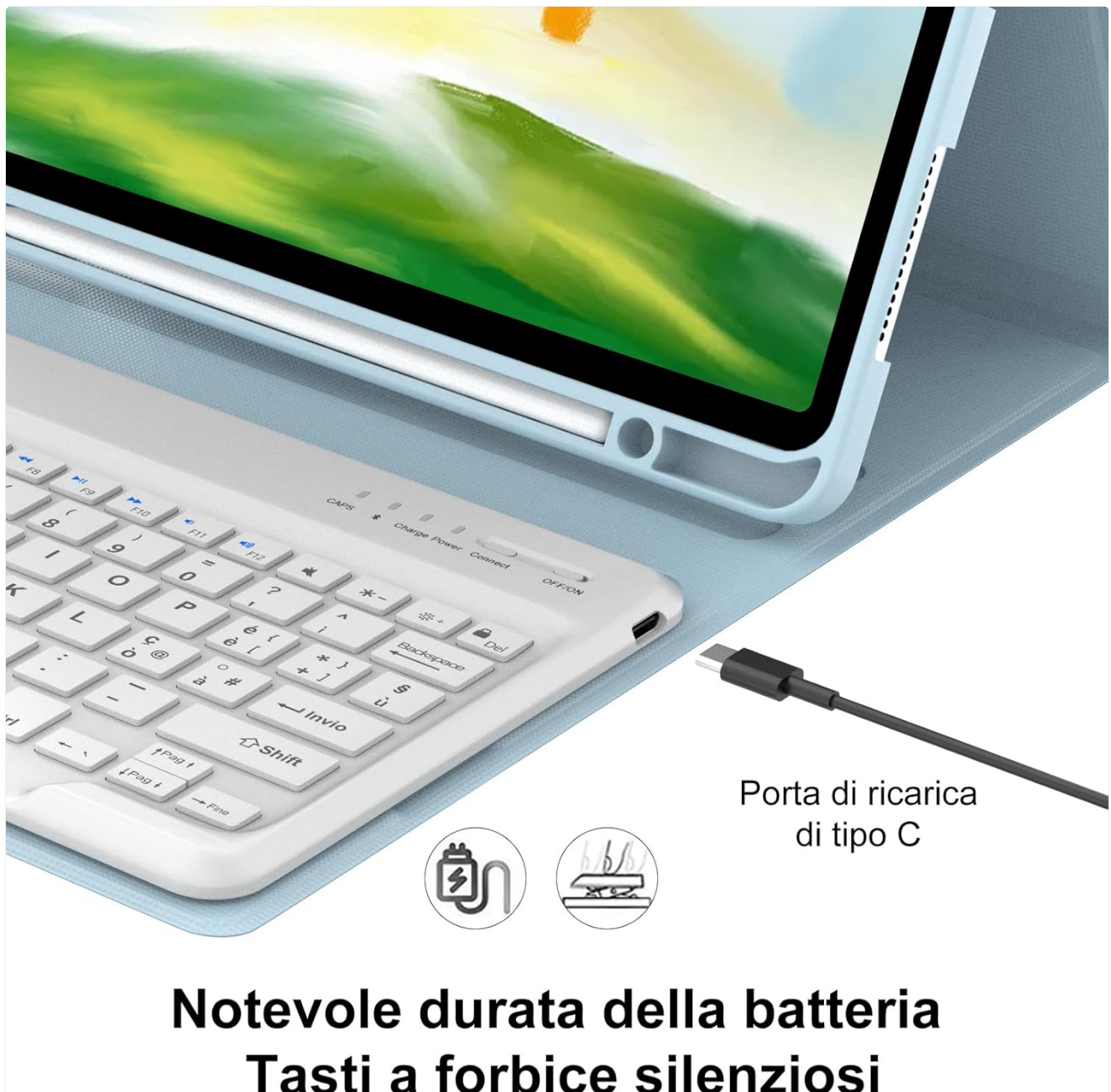
Figure 5.1: Keyboard with Type-C charging port highlighted.