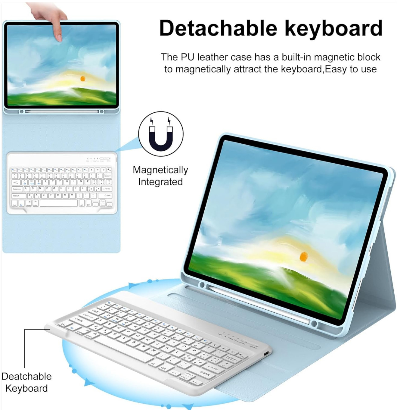
Figure 6.1: Detachable keyboard with magnetic integration.

The PU leather case has a built-in magnetic block to magnetically attract the keyboard, Easy to use