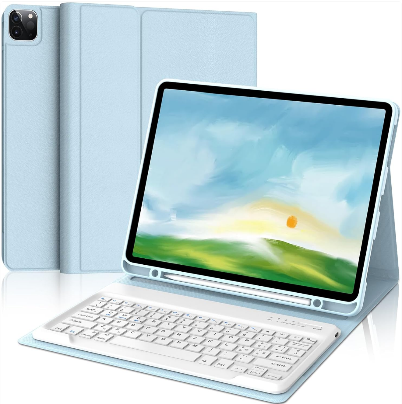
Figure 4.1: The FOGARI Keyboard Case with iPad Pro and detachable keyboard.