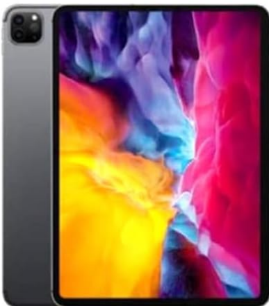
iPadPro 12.9" 2020 4th Gen (A2232/A2233/A2229/A2069)