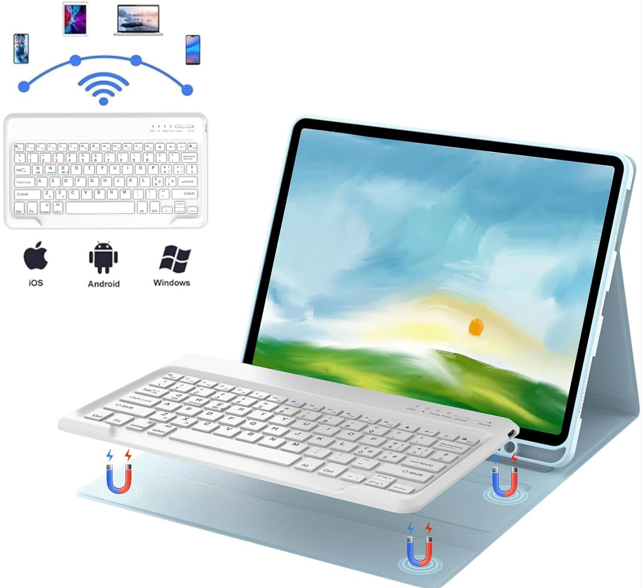
Figure 5.2: Detachable Bluetooth keyboard and multi-system compatibility.

Supporta Android,iOS,Windows,smartphone,tablet,laptop e altro ancora