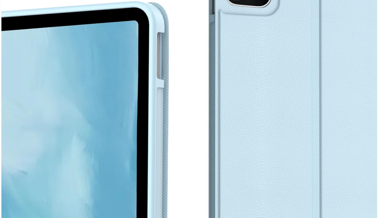
Figure 4.2: Case features including full protection and integrated pen slot.