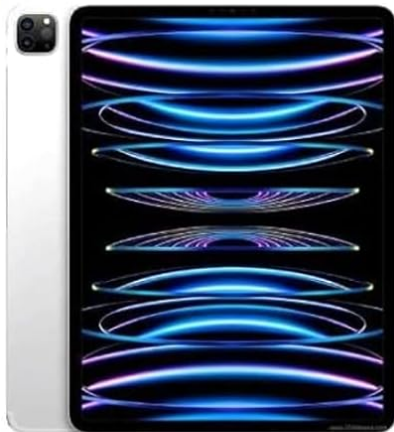
iPadPro 12.9" 2022 6th Gen (A2437/A2764/2766)