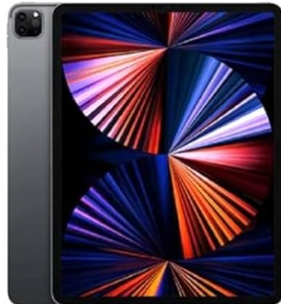
iPadPro 12.9" 2021 5th Gen (A2378/A2379/A2461/A2462)