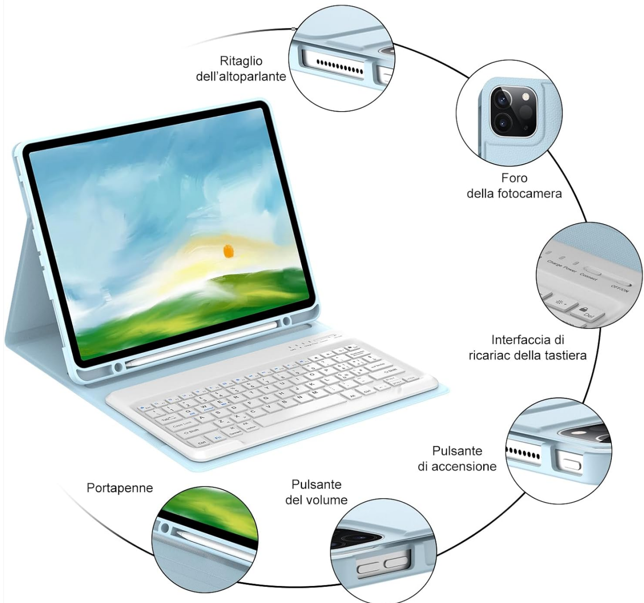
Figure 4.3: Detailed view of 360-degree protection and precise cutouts.